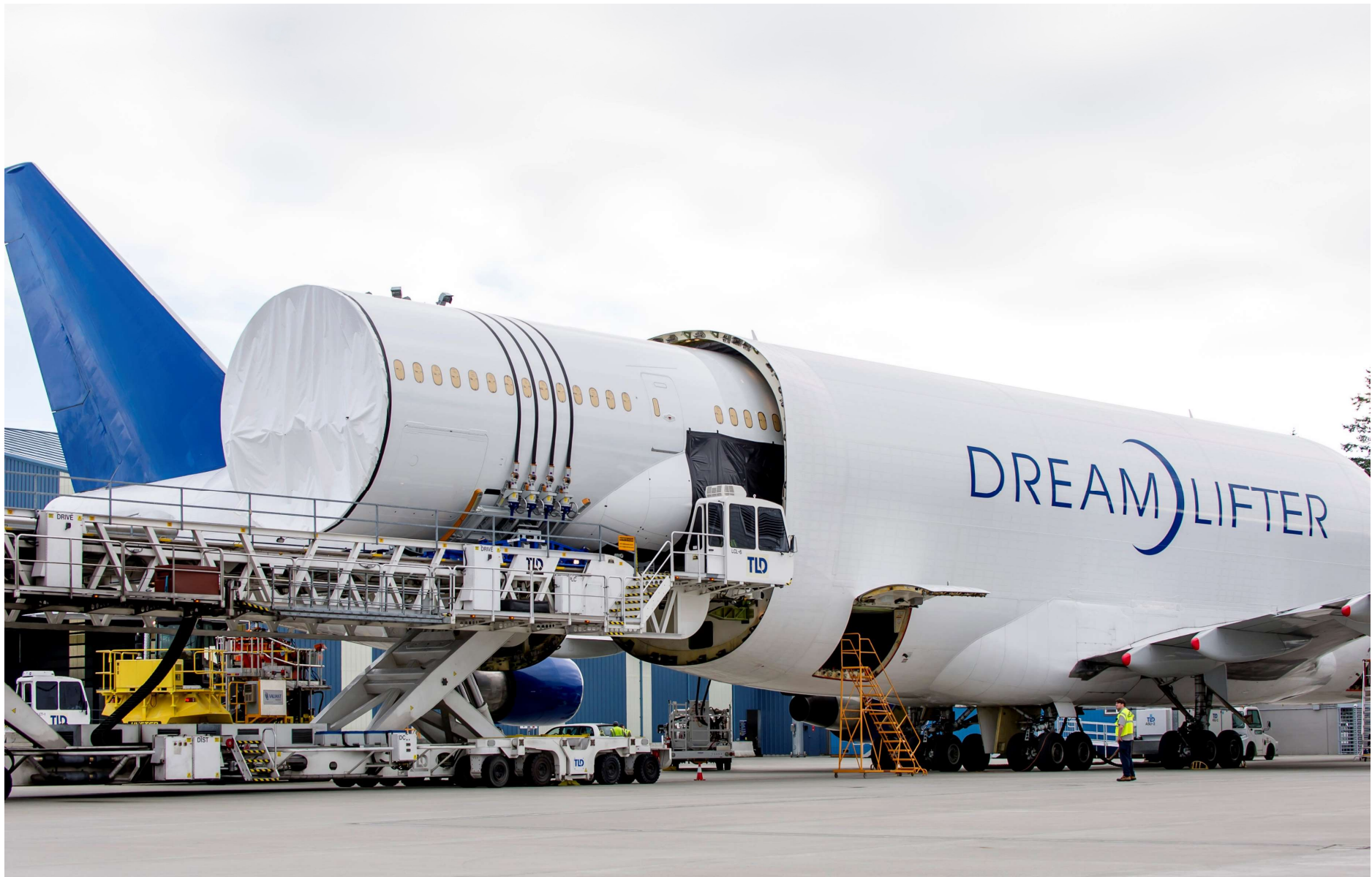
27-Jul-17 - Unloading Mid-Body from Boeing Charleston