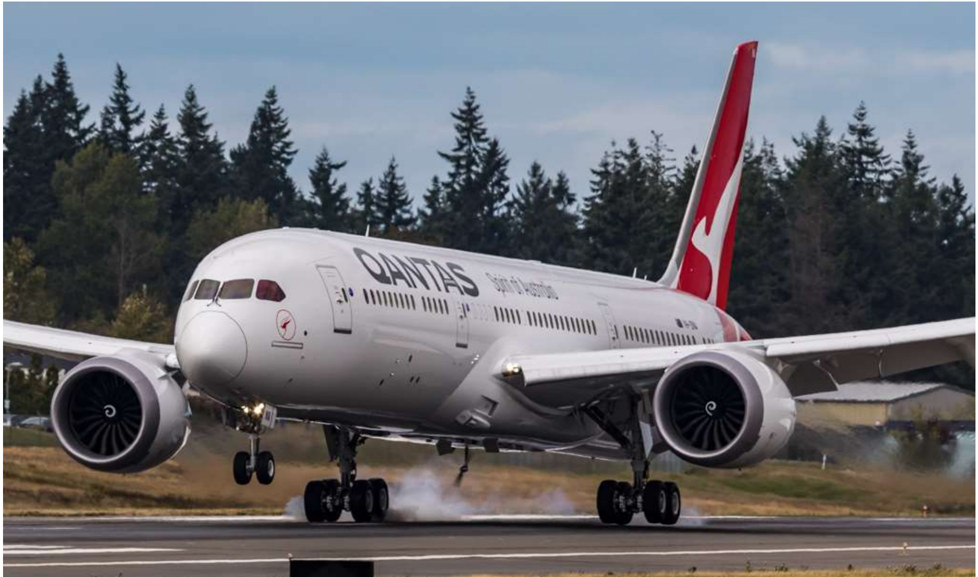
6-Oct-17 – B2 Flight Landing