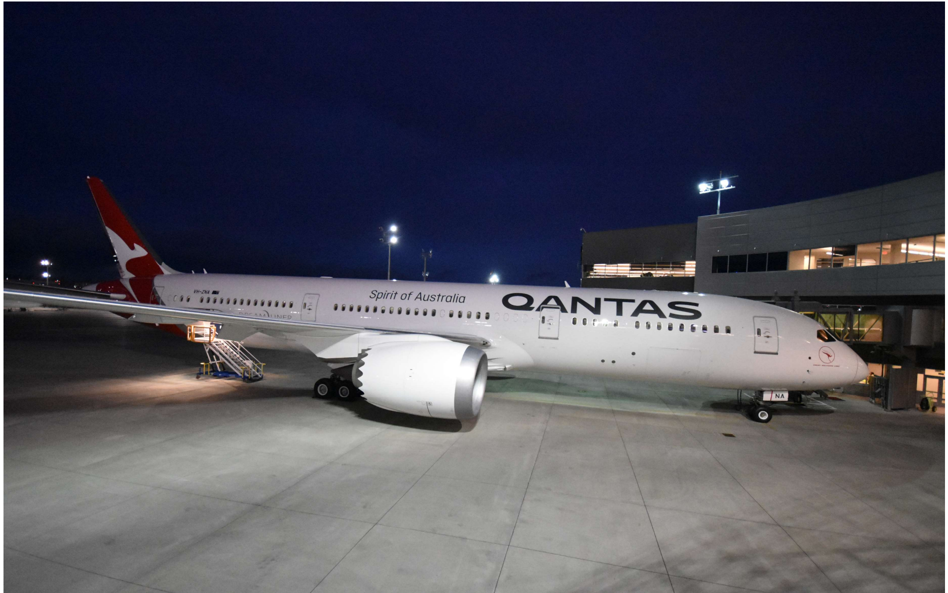
17-Oct-17 – Preparation for Departure