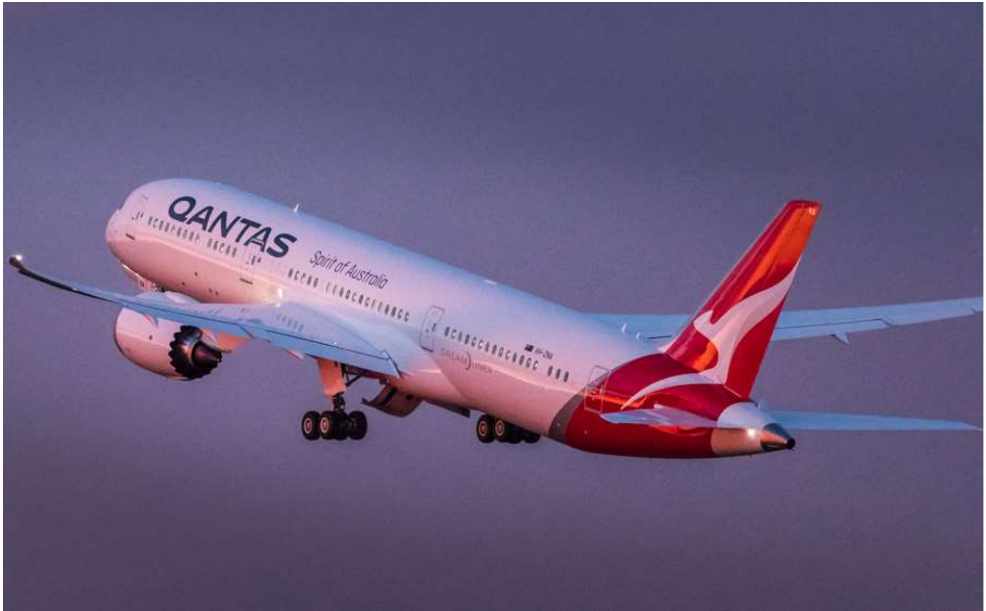
6-Oct-17 – B2 Flight Take Off