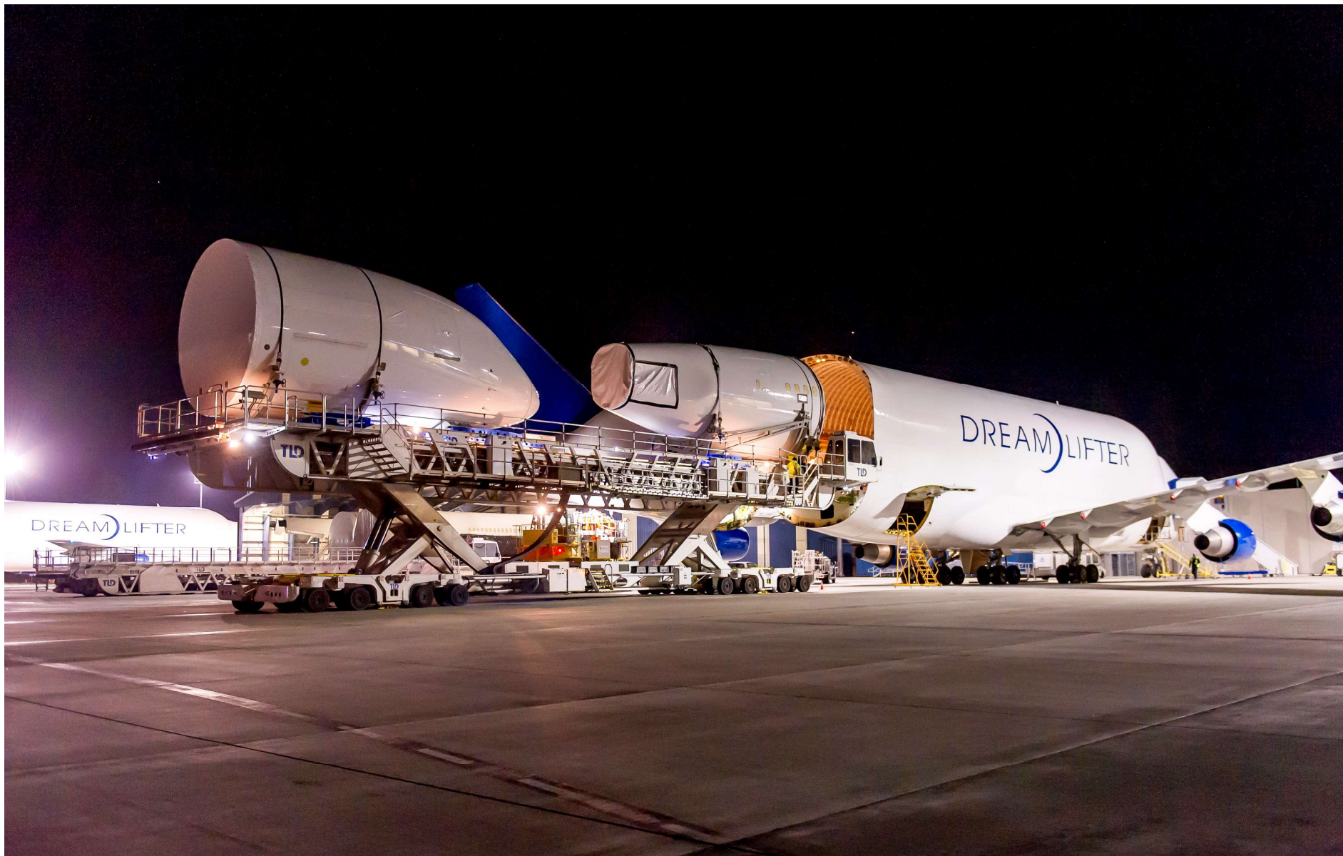
27-Jul-17 – Unloading Forward Fuselage & Aft Fuselage