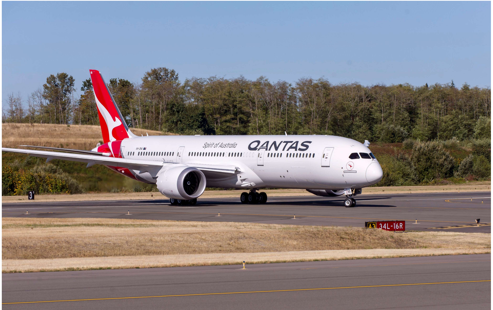
28-Sep-17 – Taxi for B1 Flight