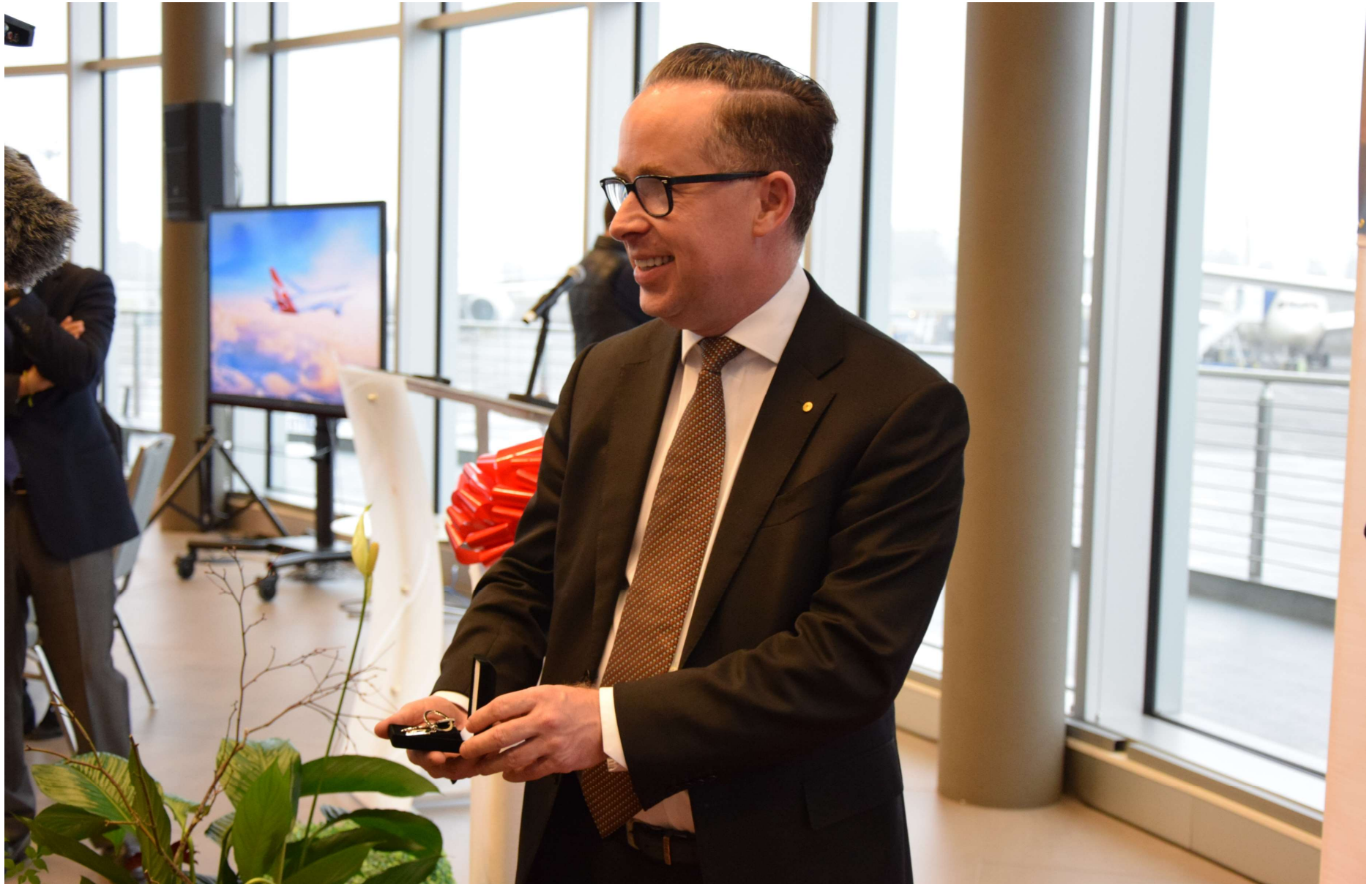
17-Oct-17 – Alan Joyce and Ceremonial Key