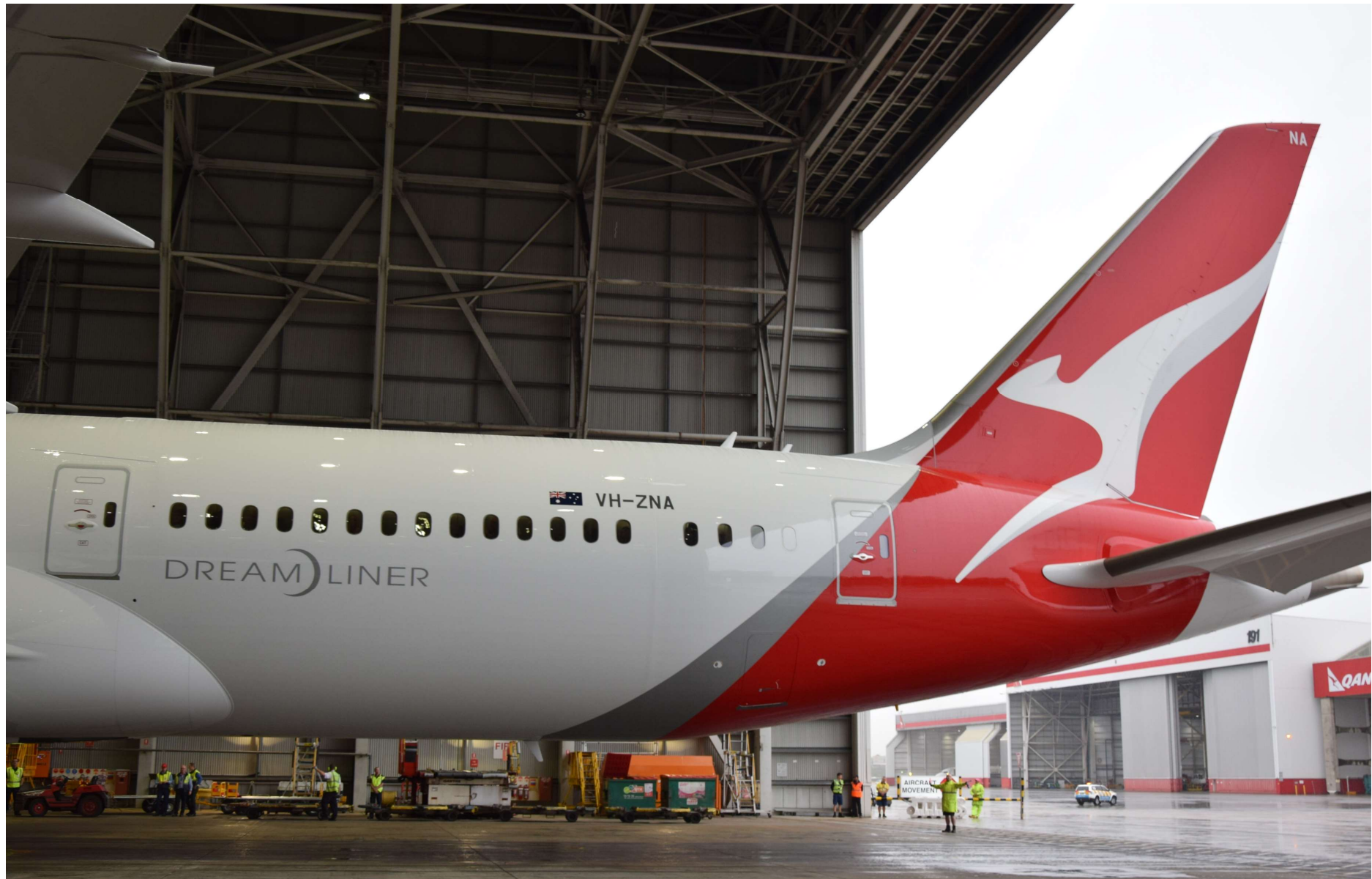
20-Oct-17 – Boeing 787-9 VH-ZNA