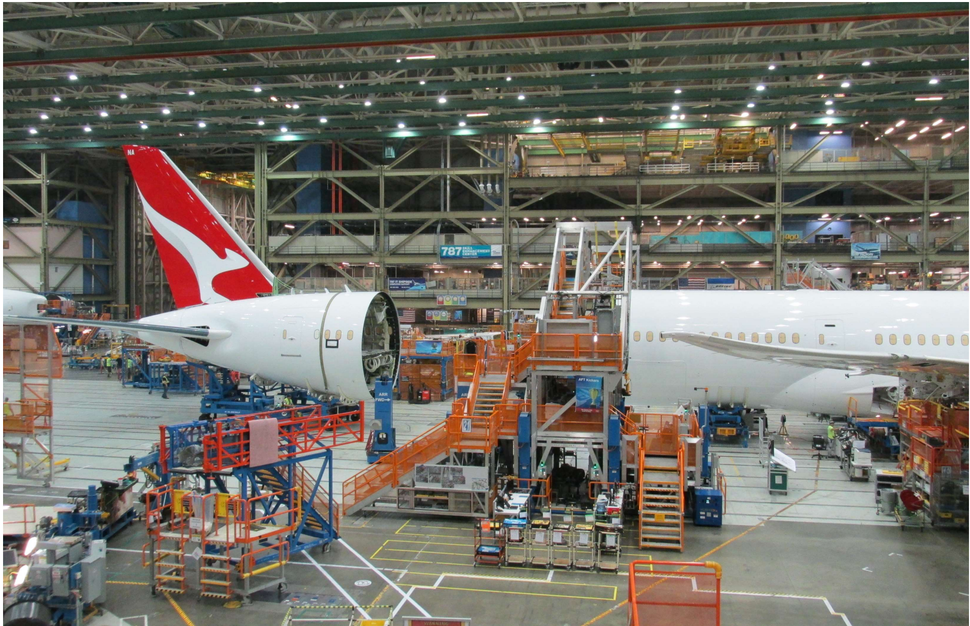
8-Aug-17 – Position 1 – Aft Fuselage Positioning