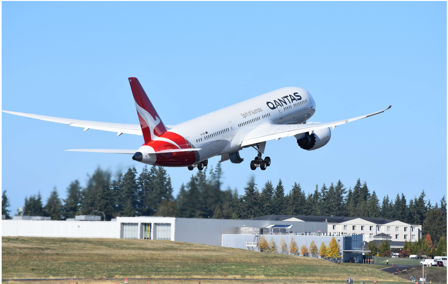
17-Oct-17 – Airbourne to Honolulu