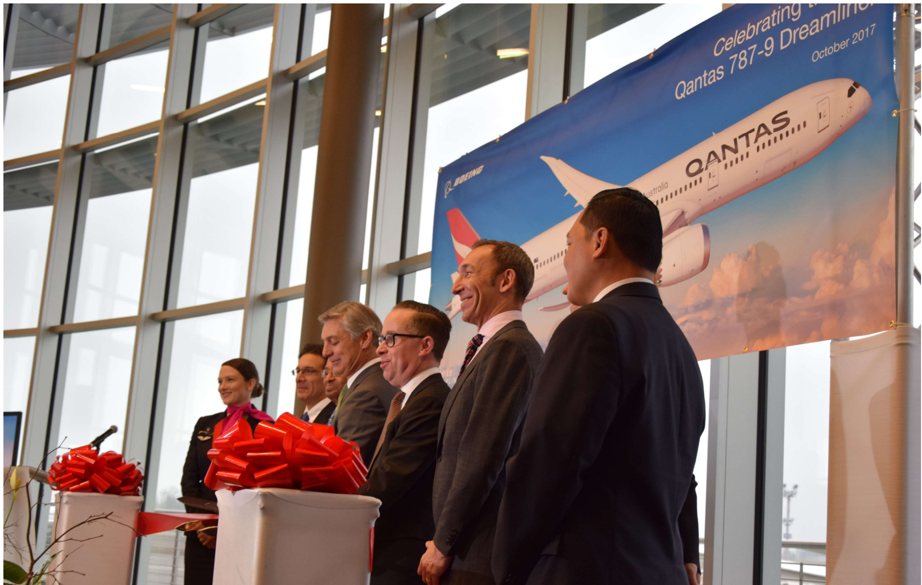
17-Oct-17 – Ribbon Cutting Ceremony