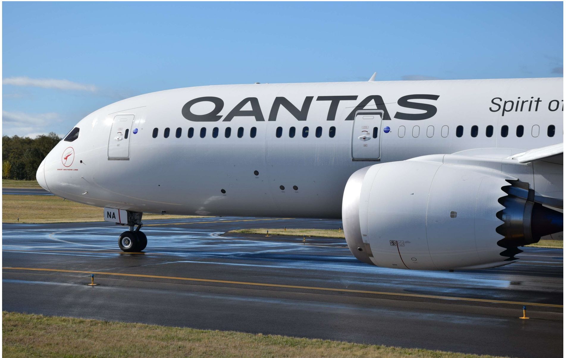
17-Oct-17 – Taxi for Take Off