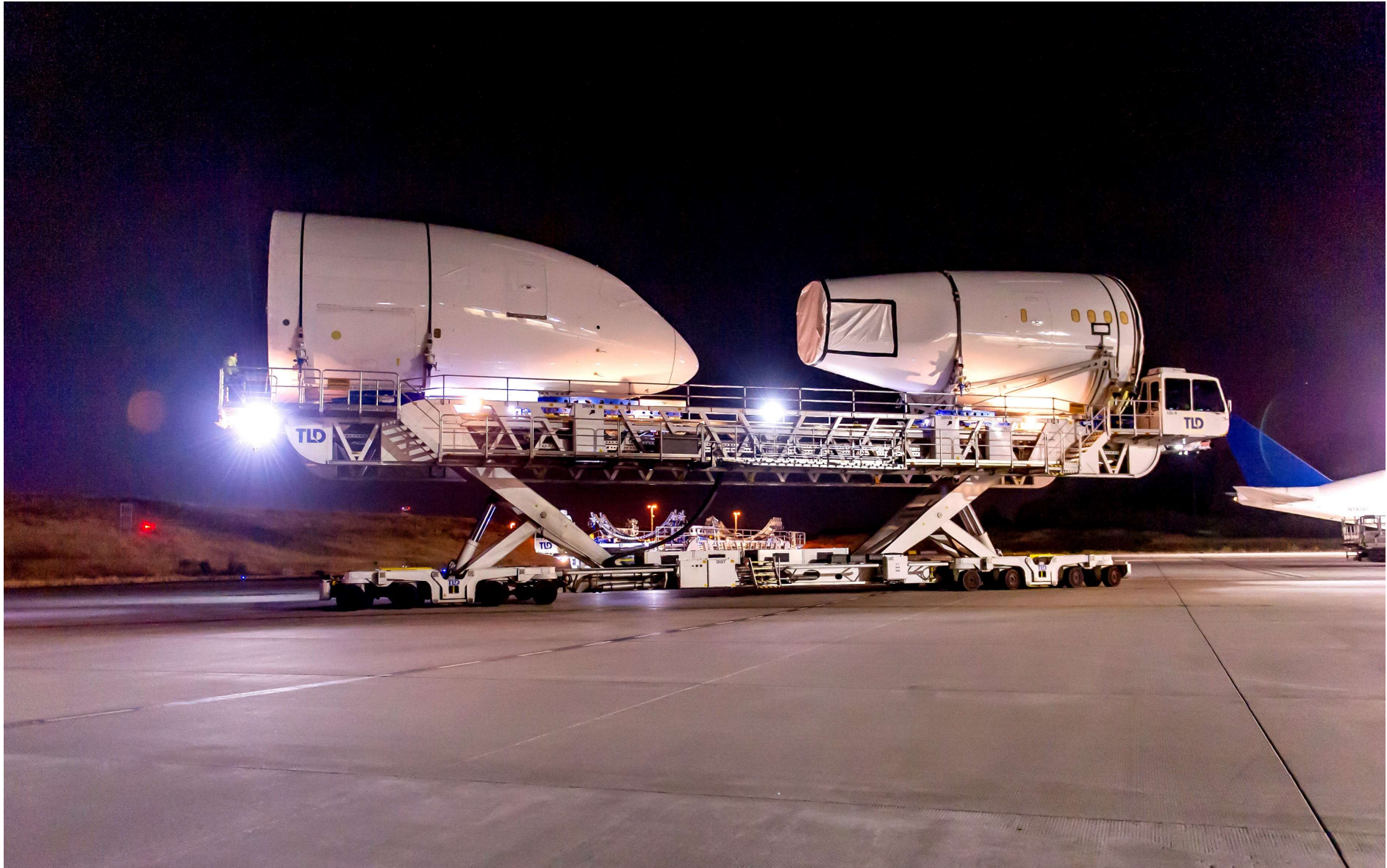
27-Jul-17 – Forward Fuselage from Wichita & Aft Fuselage from Charleston