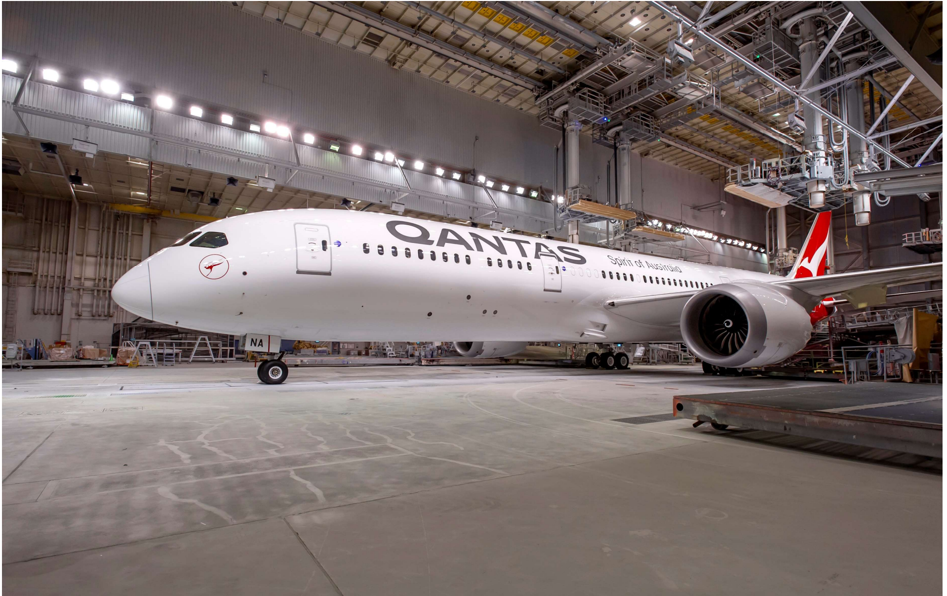
20-Sep-17 - Paint Hangar Roll-Out