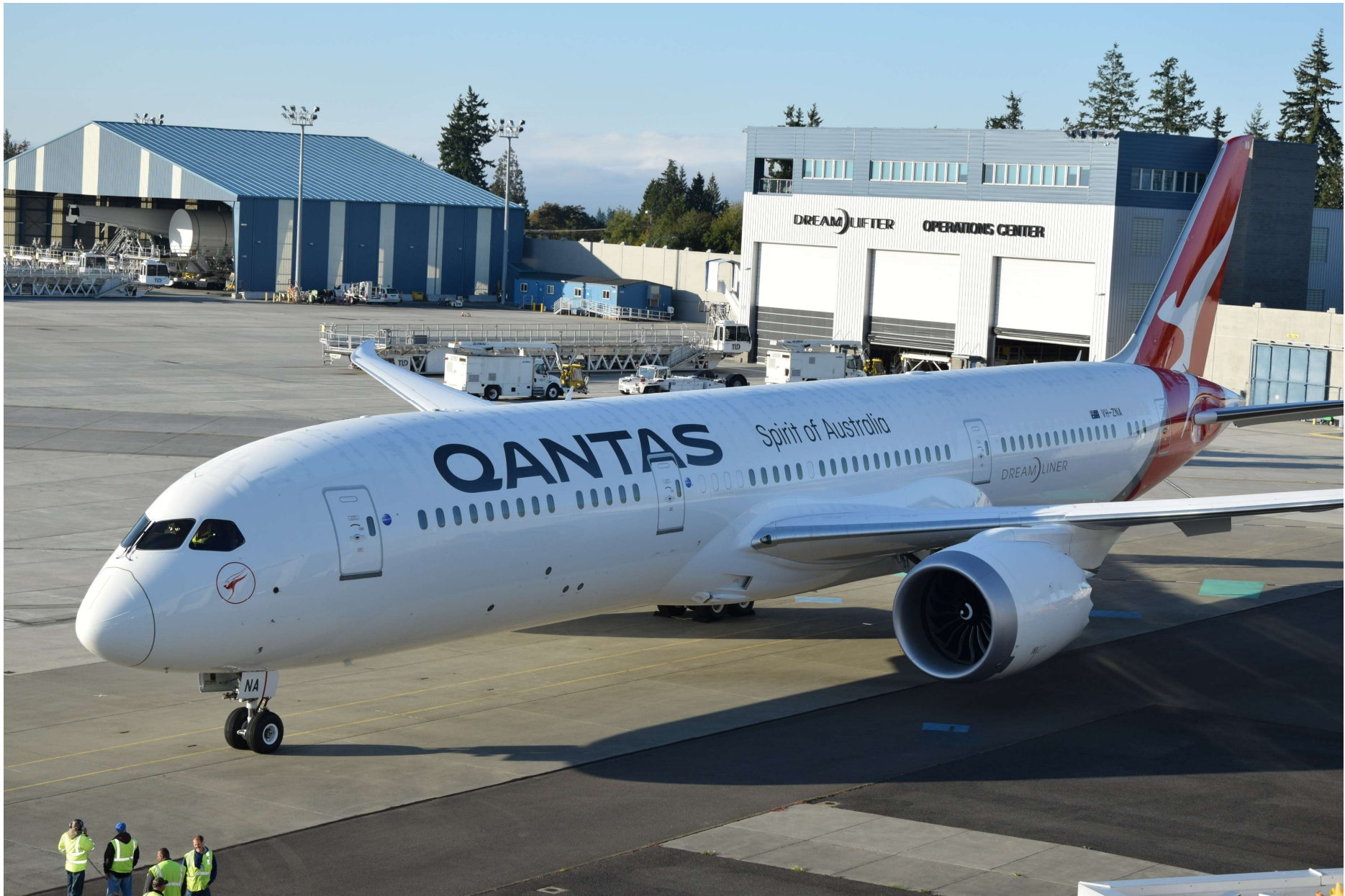
16-Oct-17 – Aircraft Movement