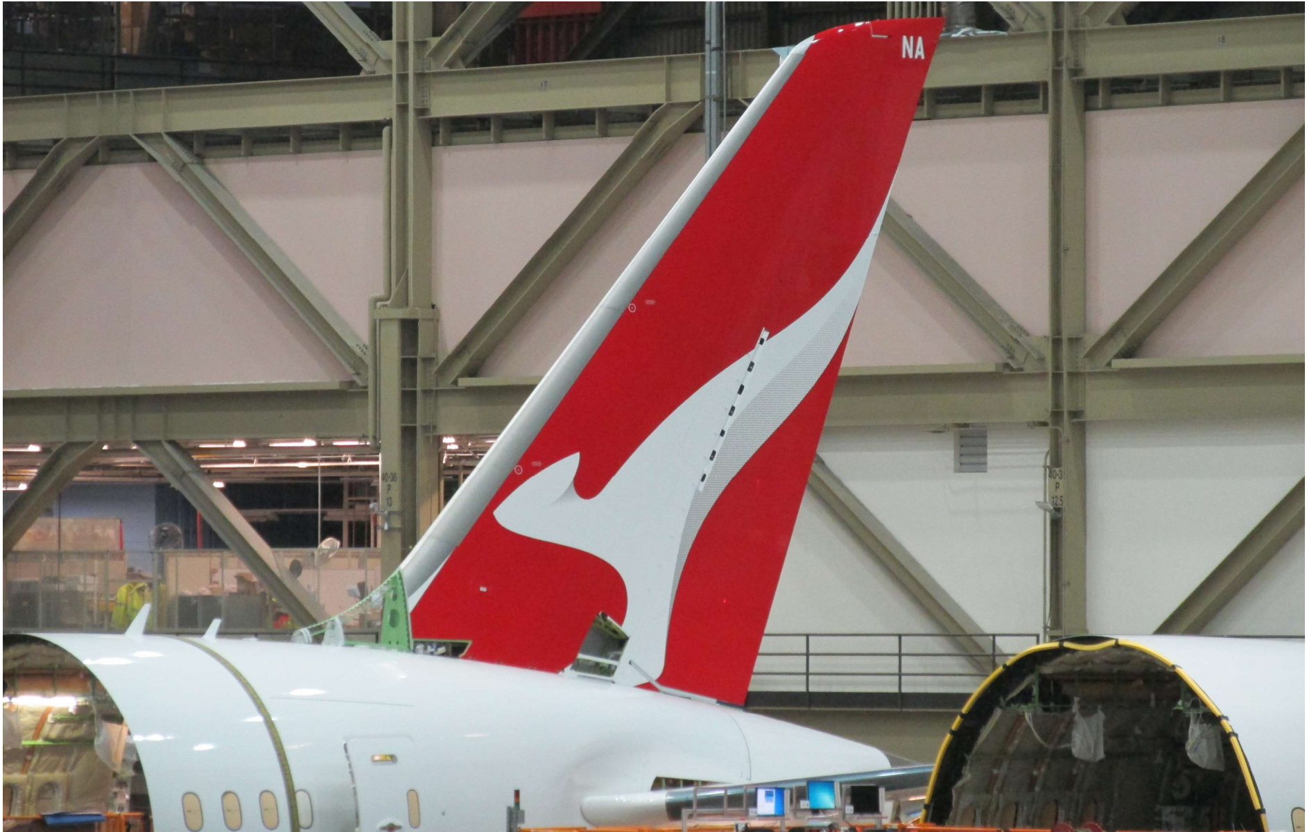
8-Aug-17 – Position 0 – Aft Fuselage and Fin