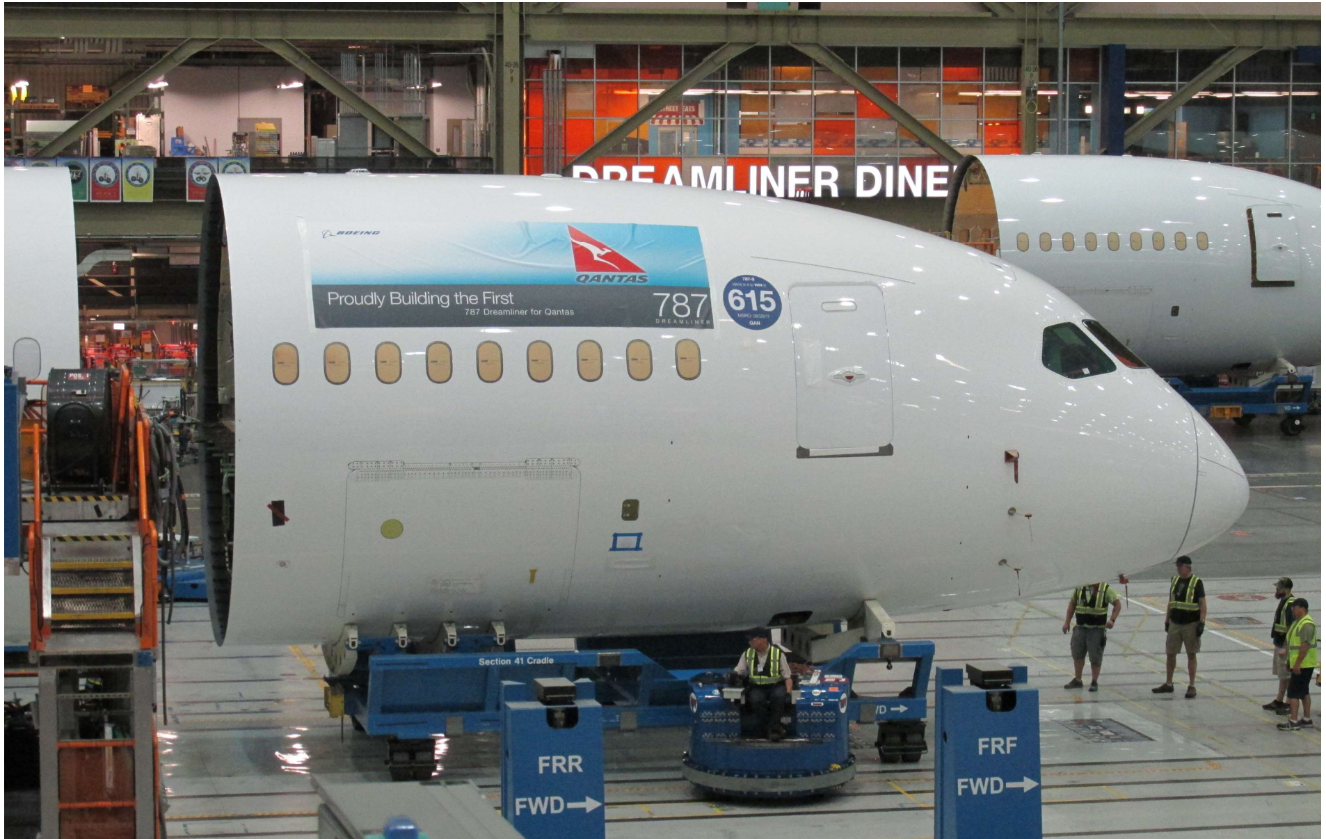
8-Aug-17 – Position 1 – Forward Fuselage