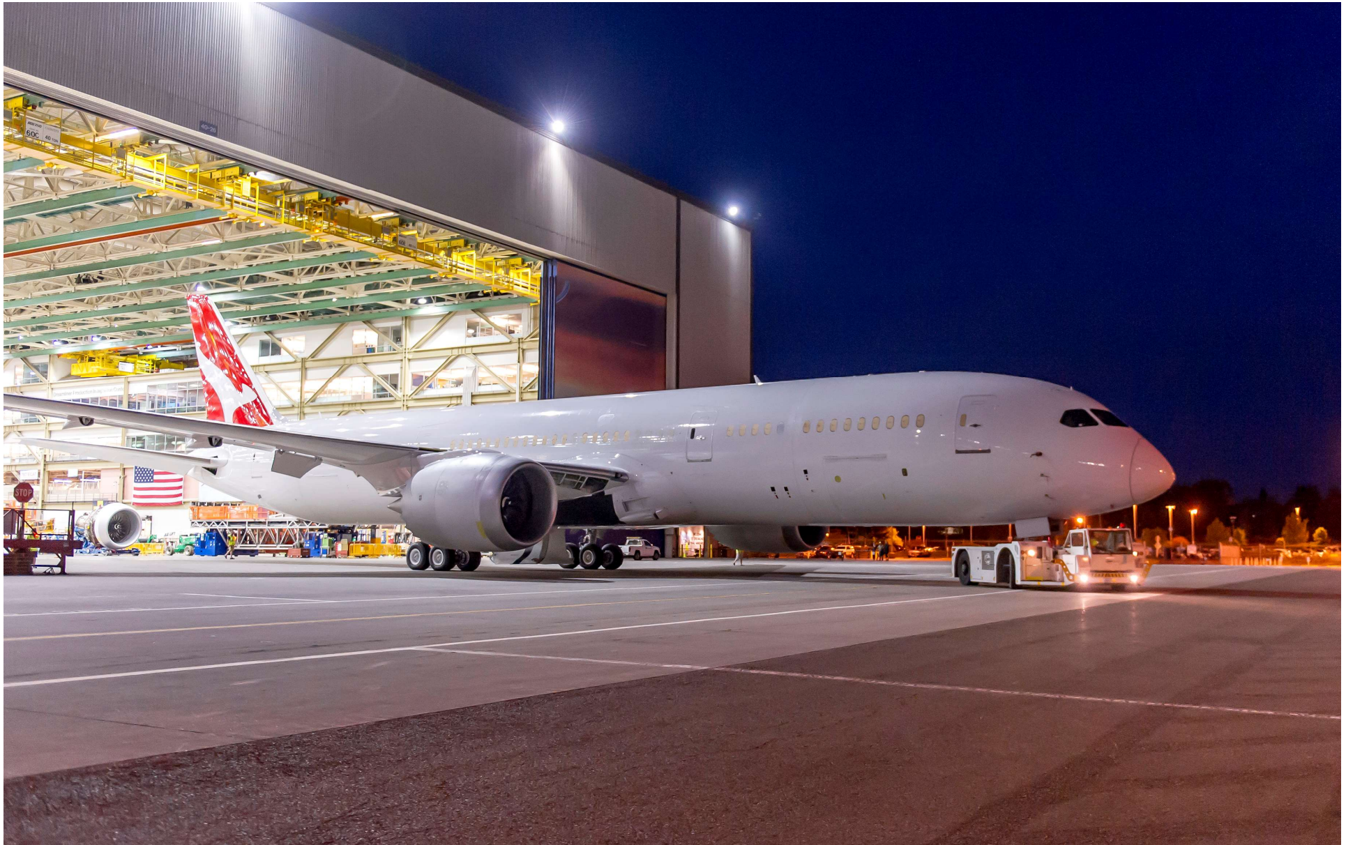
28-Aug-17 - Factory Roll-Out