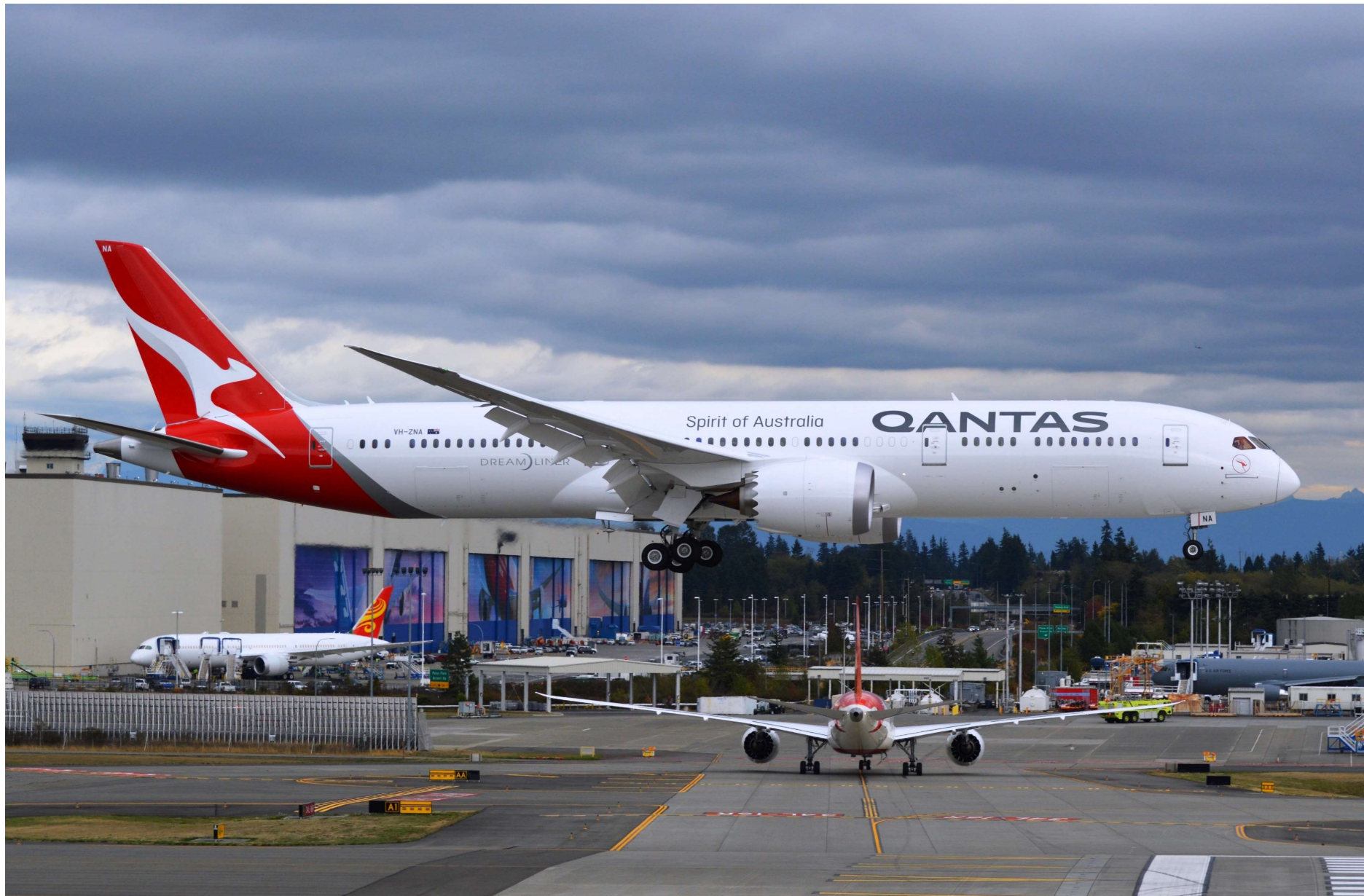
6-Oct-17 - C1 Flight Landing