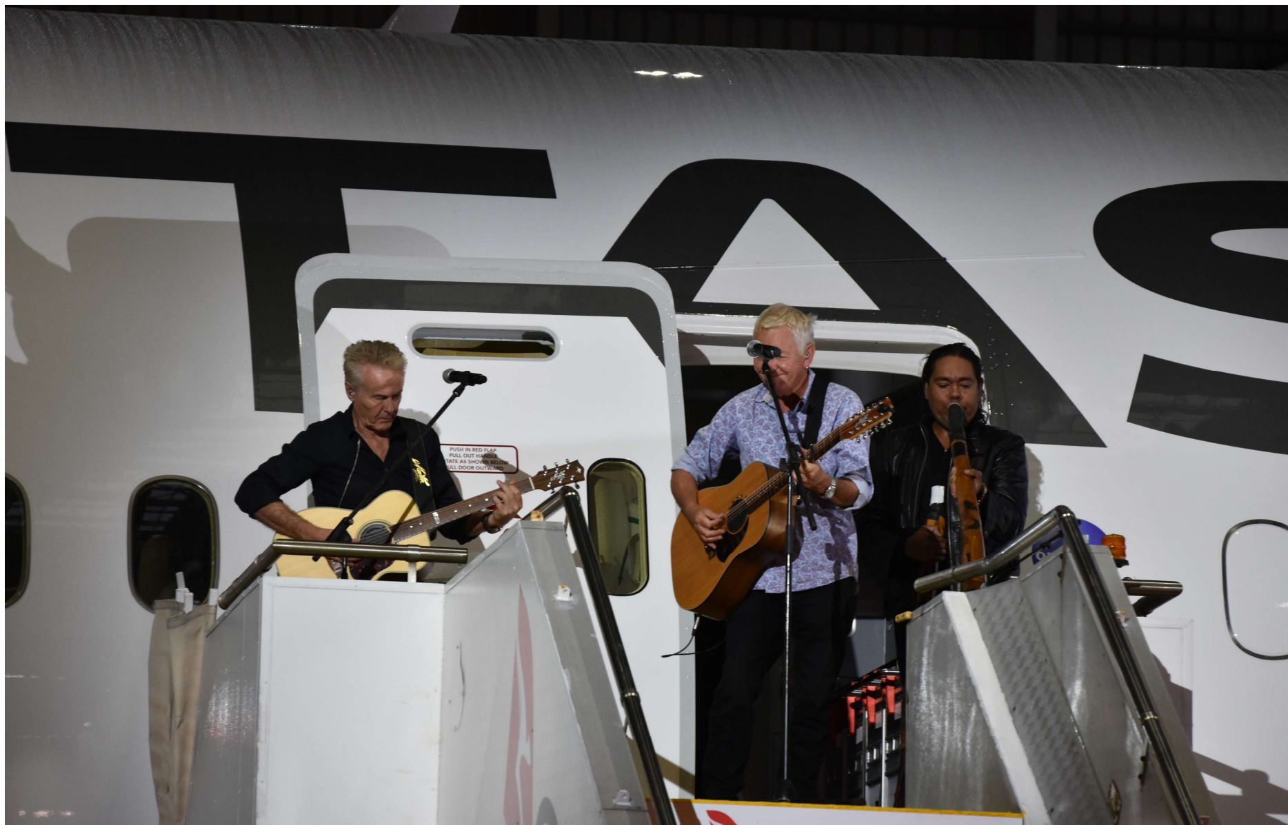
20-Oct-17 – Icehouse playing Great Southern Land