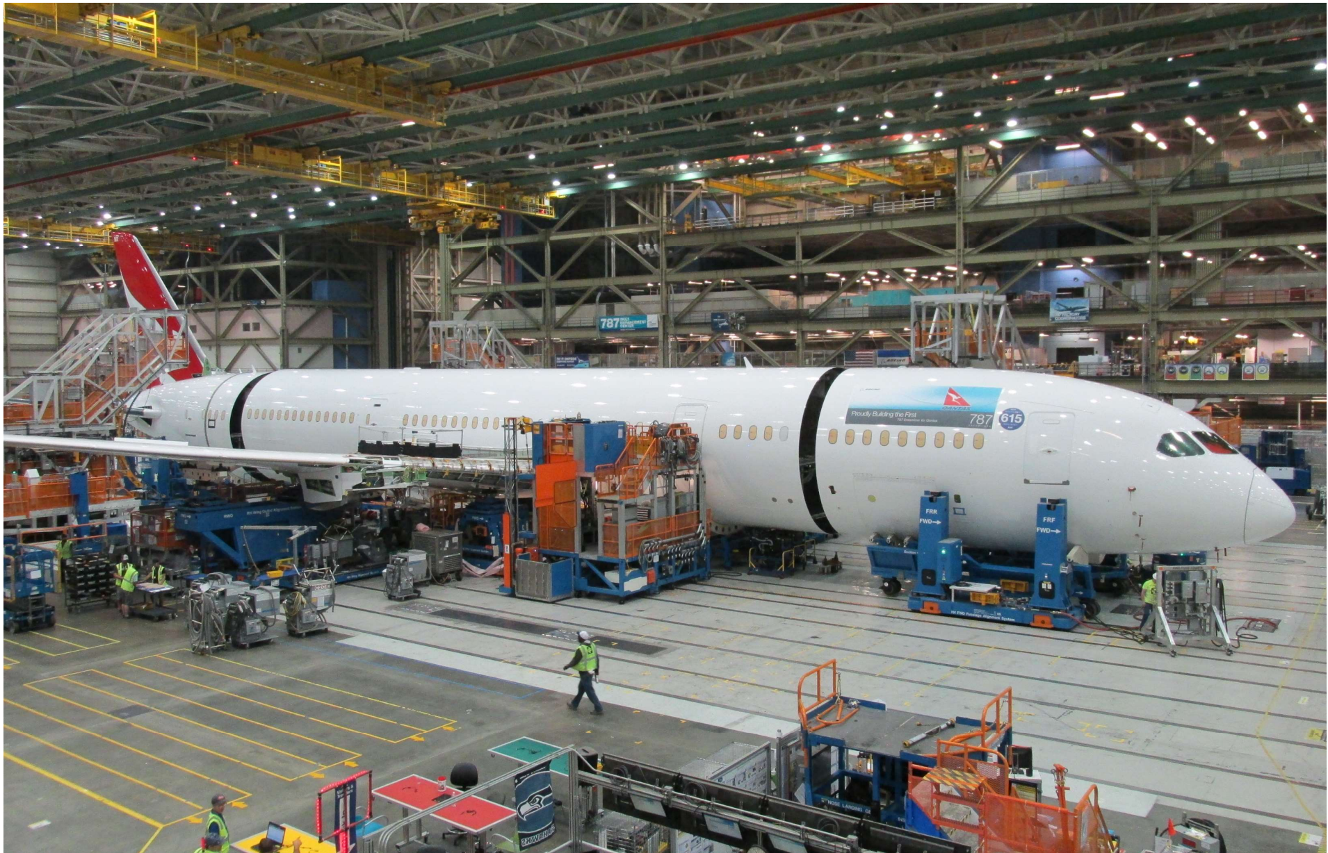
8-Aug-17 – Position 1 – Preparation for Body & Wing joins