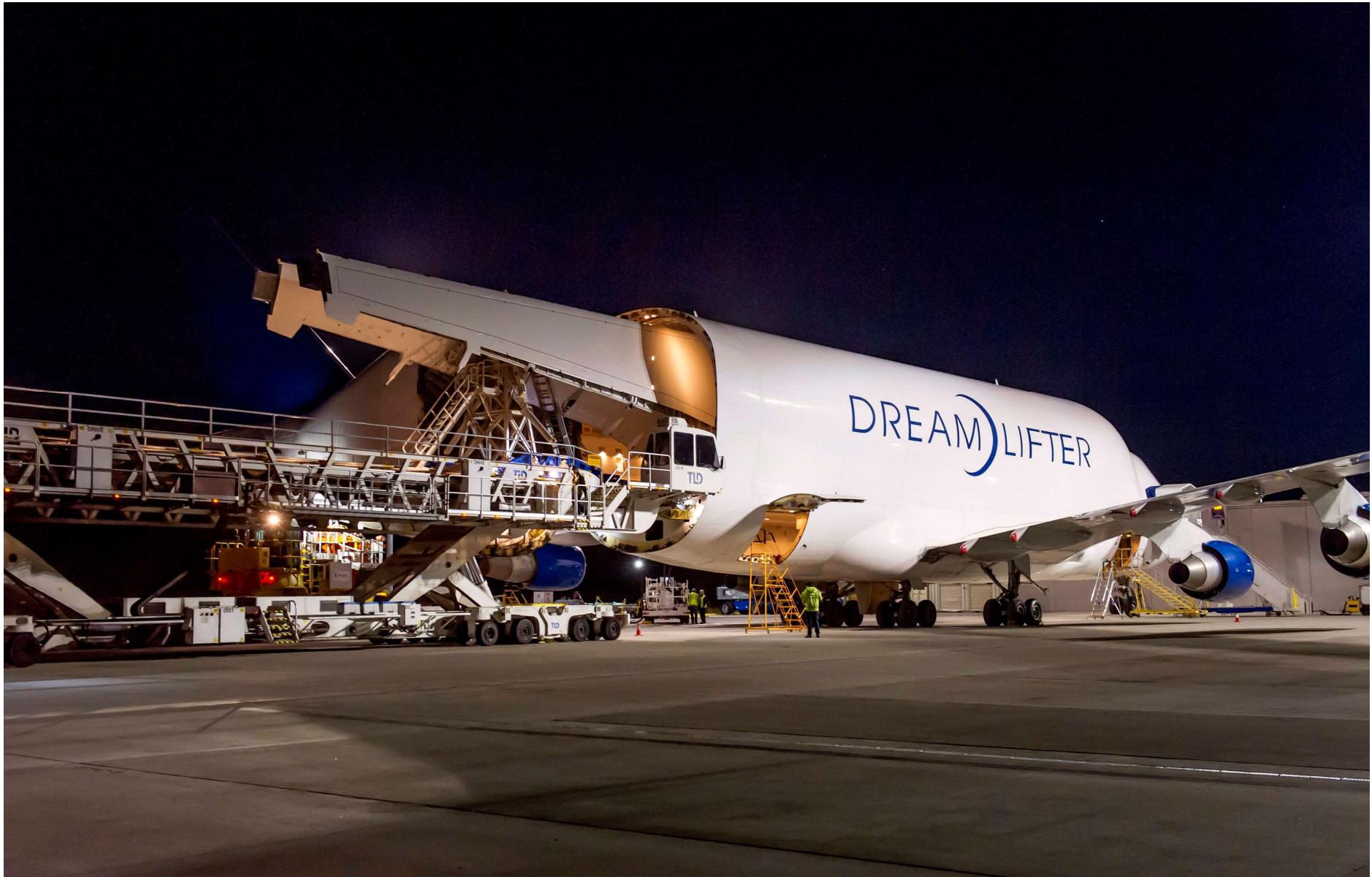
27-Jul-17 – Unloading Wings from MHI Japan