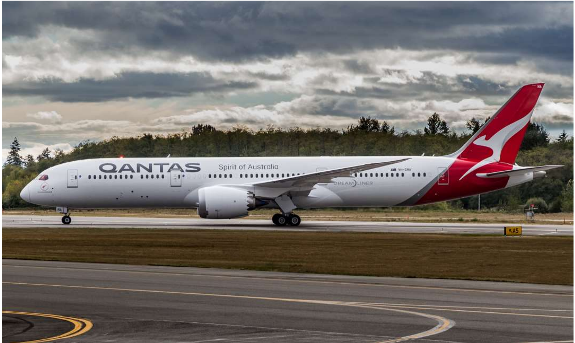
6-Oct-17 – B2 Flight Landing