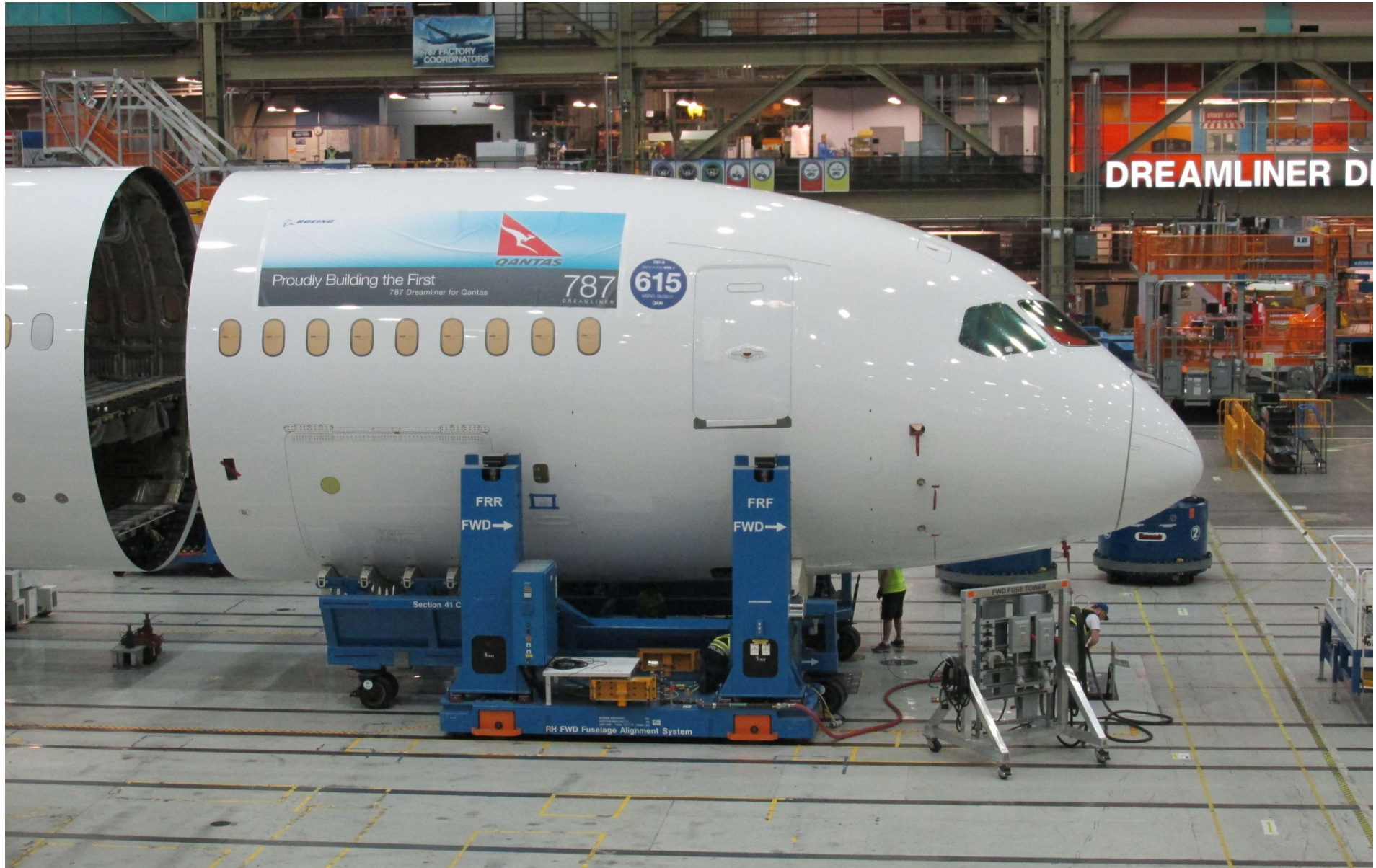
8-Aug-17 – Position 1 – Forward Fuselage Positioning