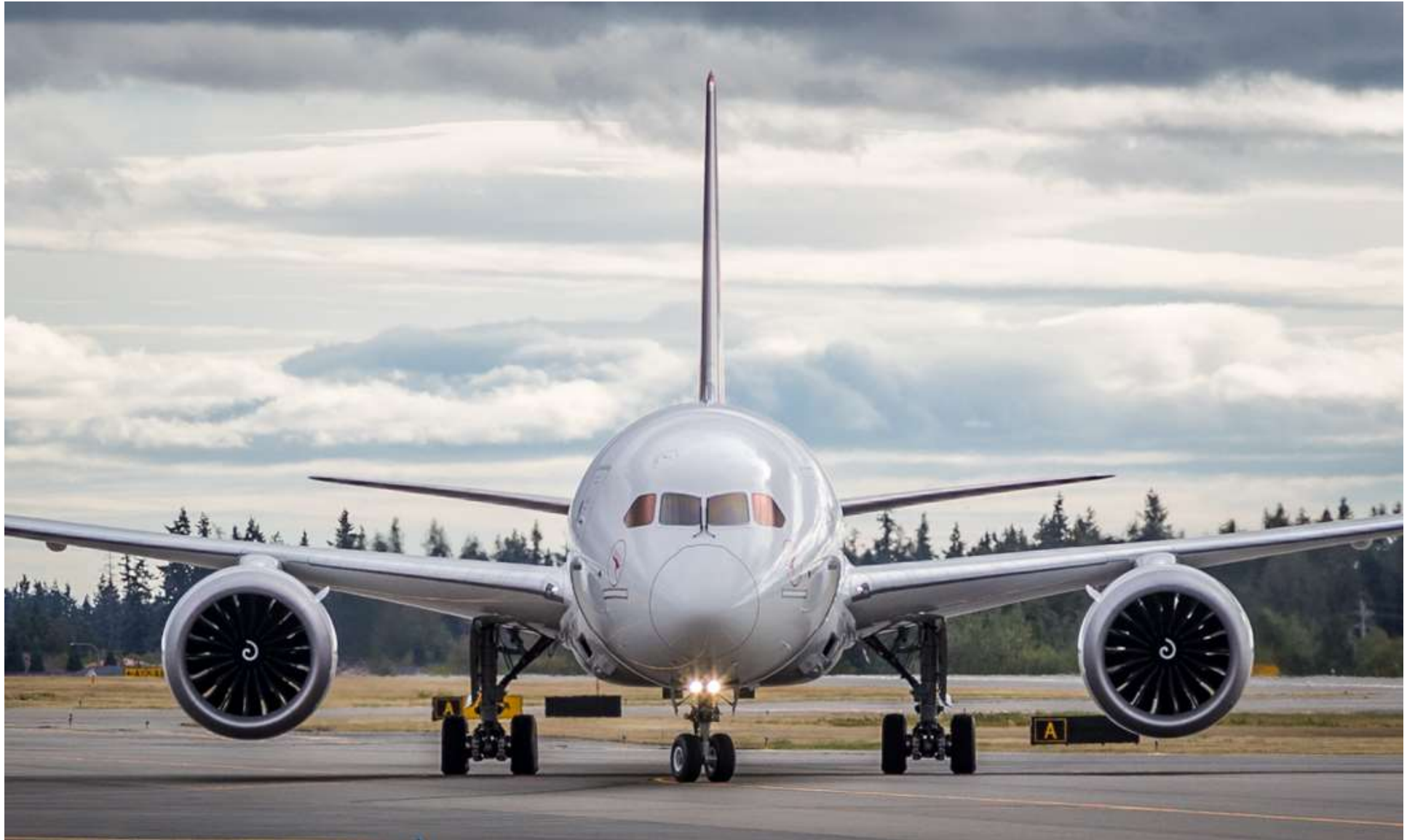
6-Oct-17 – B2 Flight Landing