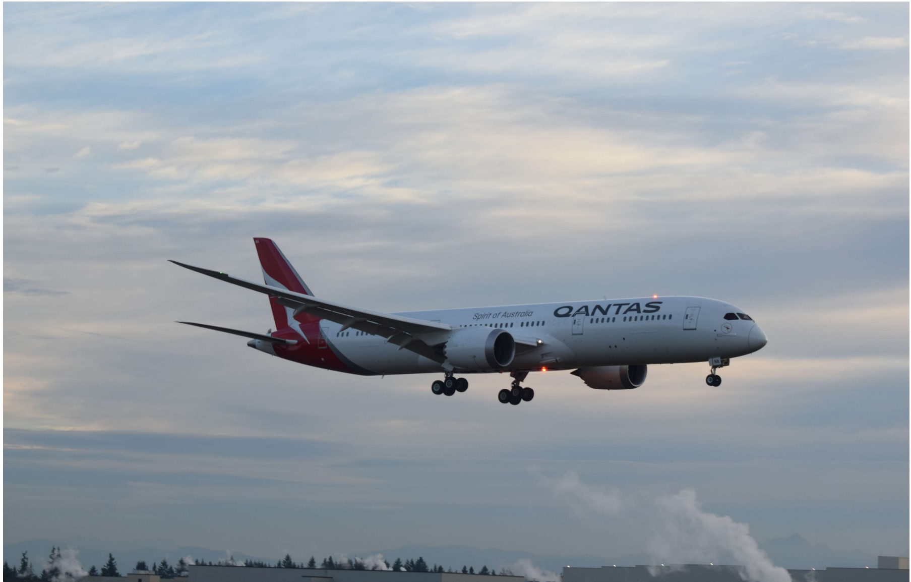
6-Oct-17 – B2 Flight Approach