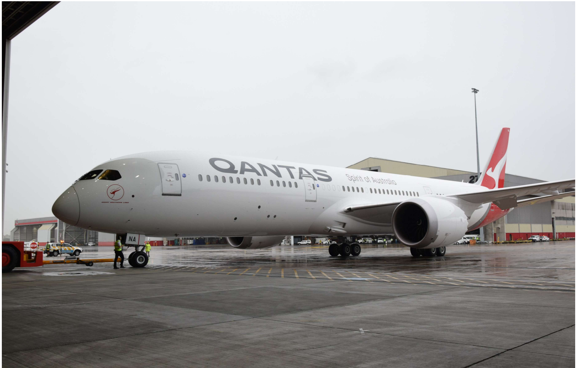
20-Oct-17 – Arrival at Hanger 96 Sydney