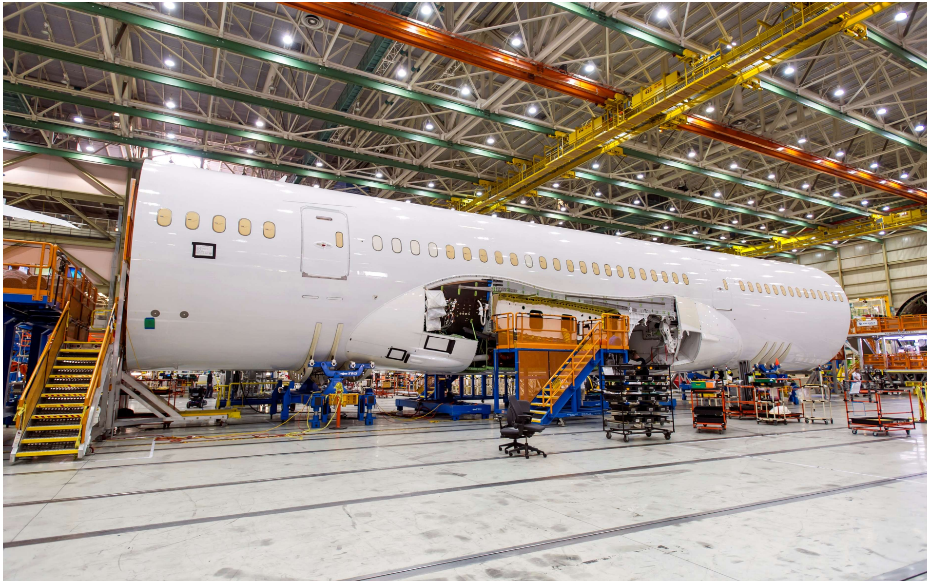
8 Aug-17 - Position 0 - Mid Body Assembly