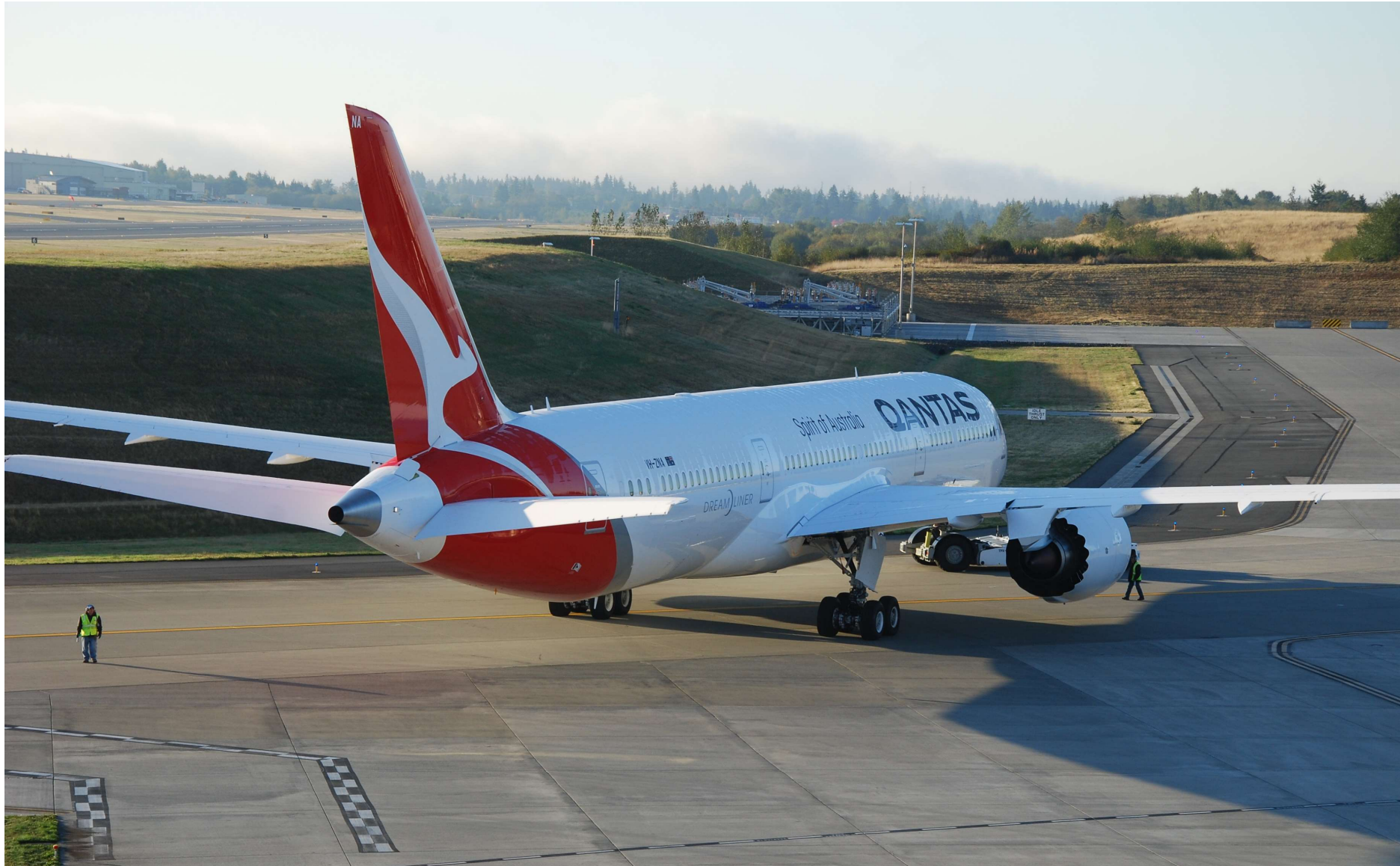
16-Oct-17 – Aircraft Movement