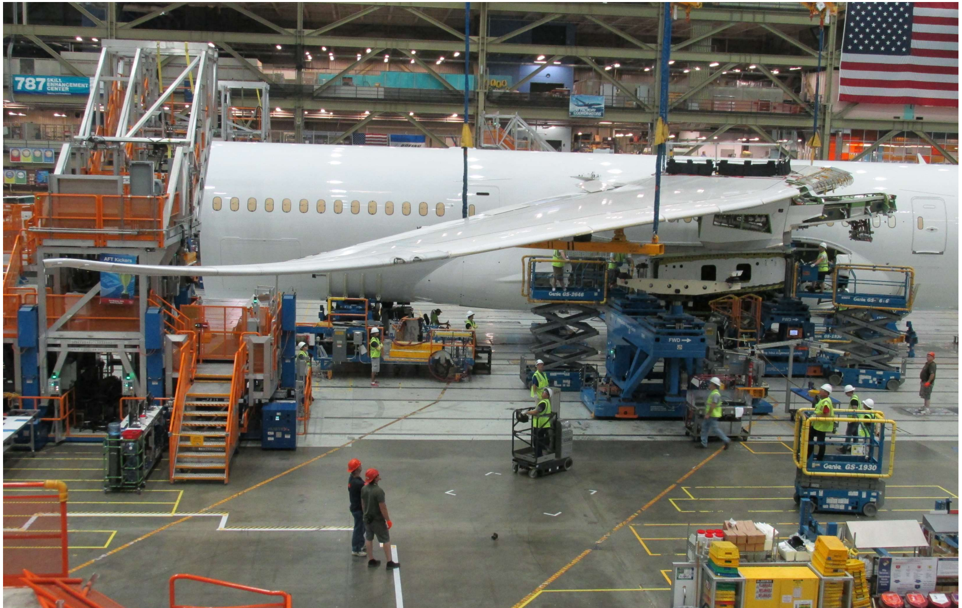
8-Aug-17 – Position 1 – Wing Positioning