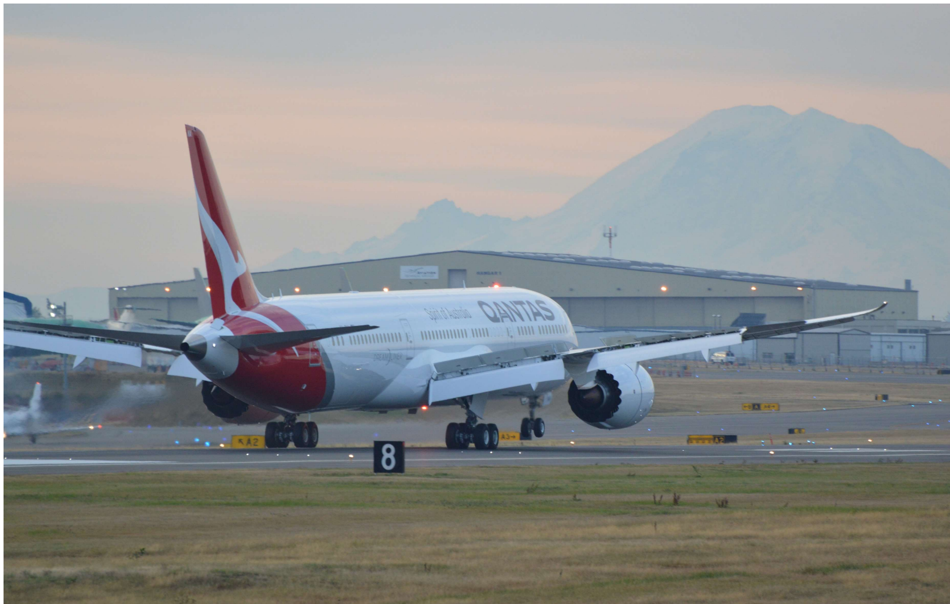
6-Oct-17 – B2 Flight landing