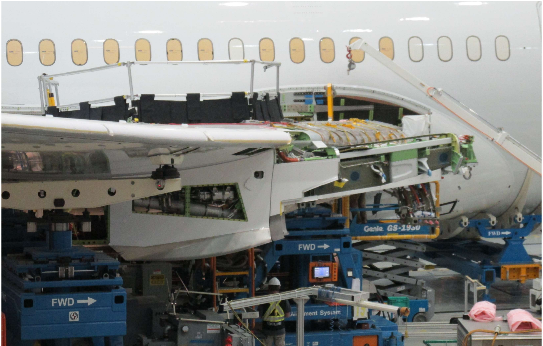
8-Aug-17 – Position 1 – Wing Positioning