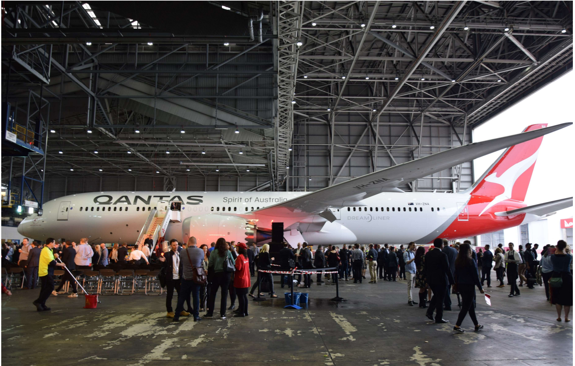
20-Oct-17 – VH-ZNA Welcomed to Sydney