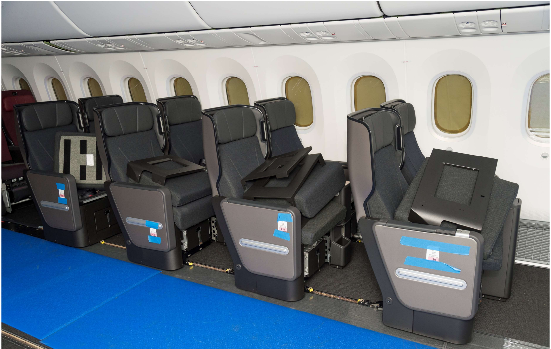
9-Sep-17 – Premium Economy Seats