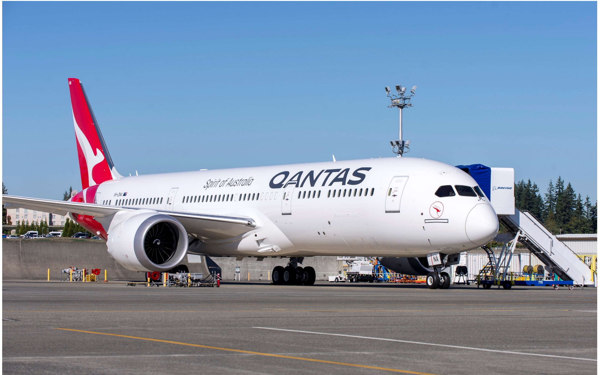
28-Sep-17 - B1 (First Boeing) Flight