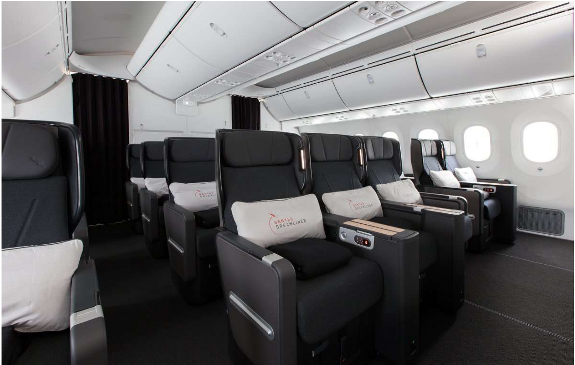
11-Oct-17 – Premium Economy Seats