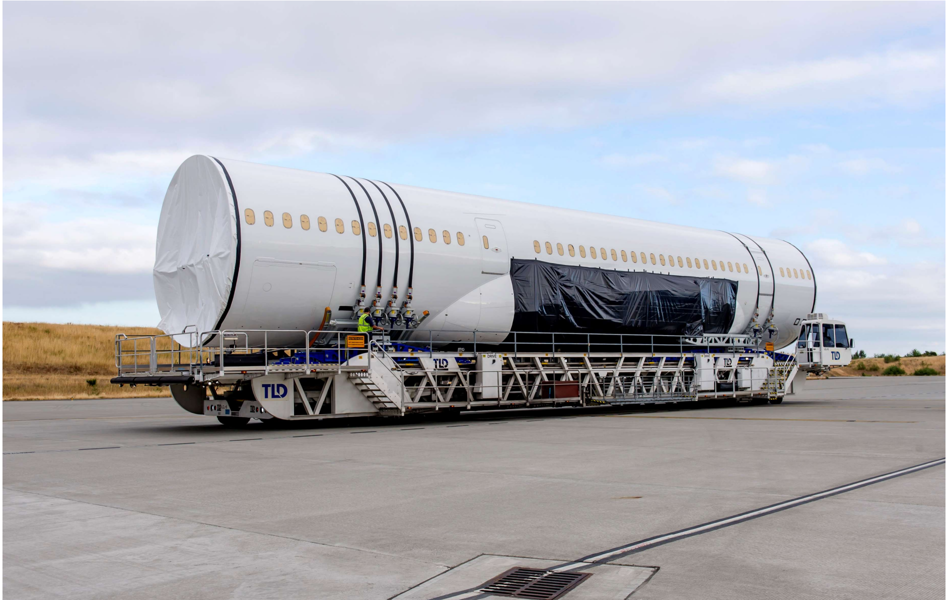
27-Jul-17 - Mid-Body Assembly from Charleston