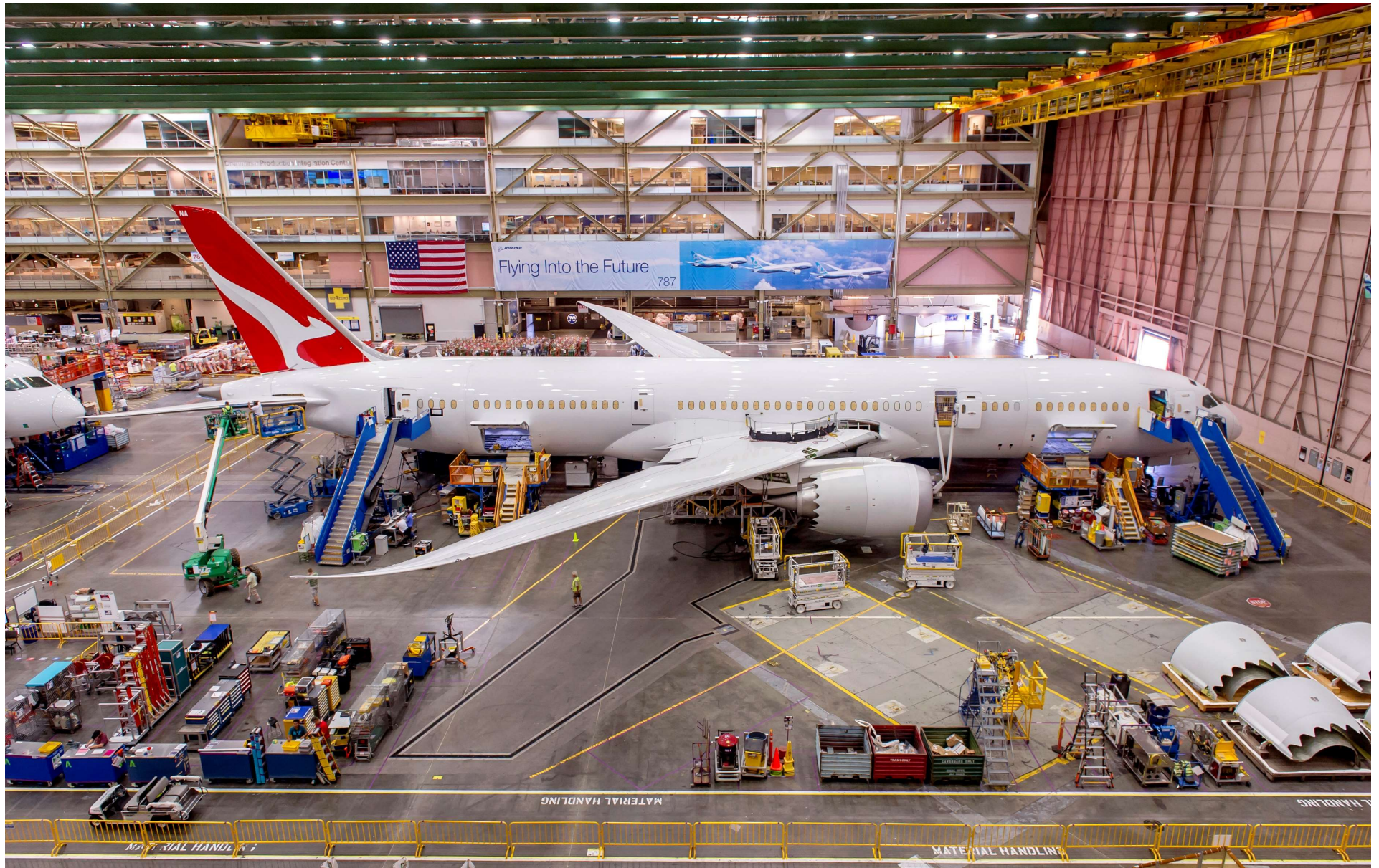
23-Aug-17 – Position 4 – Interior and Engines Installed