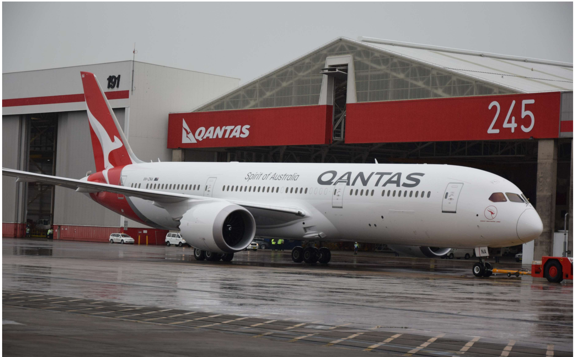
20-Oct-17 – Arrival at Hanger 96 Sydney