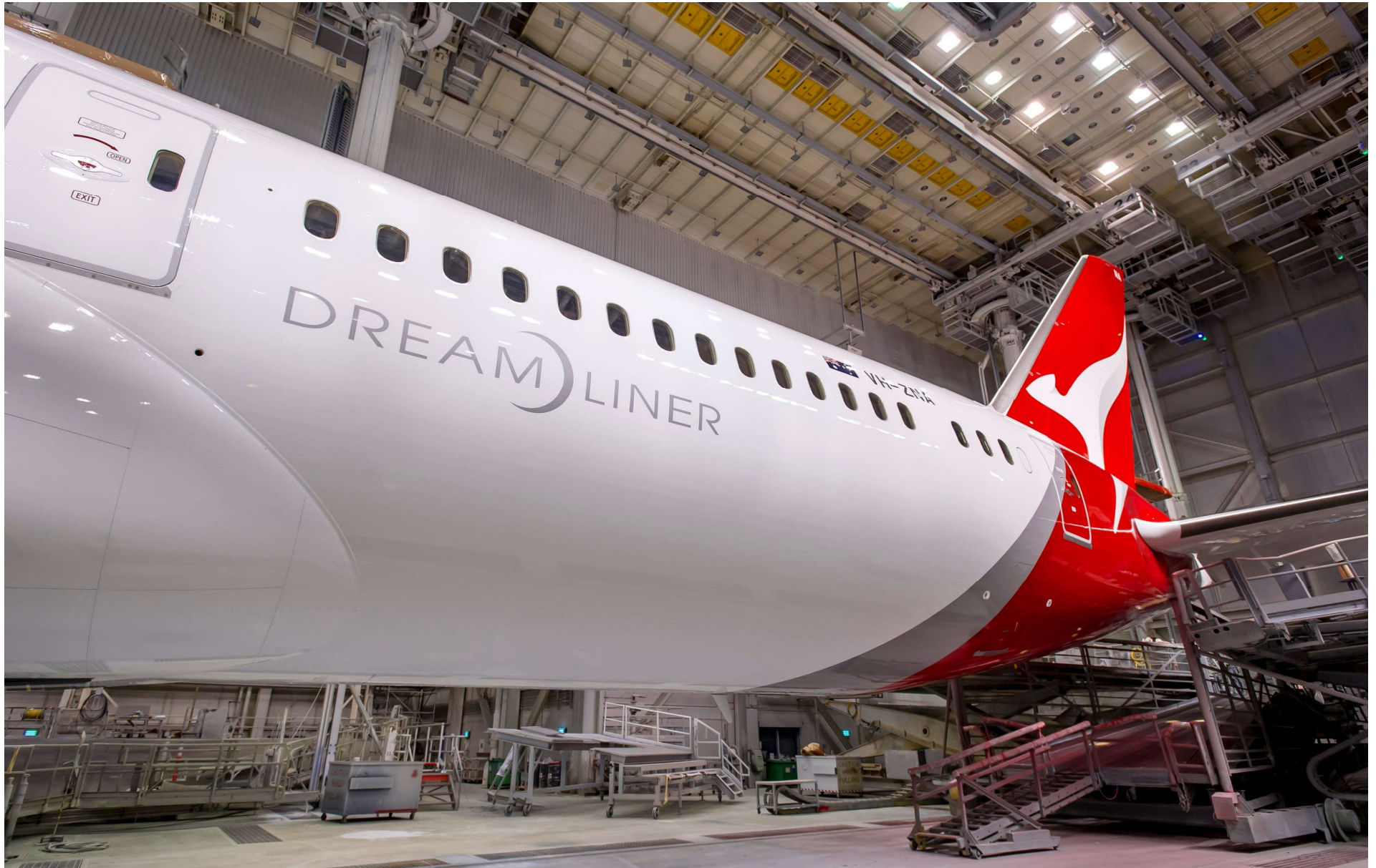
20-Sep-17 - Paint Hangar Roll-Out