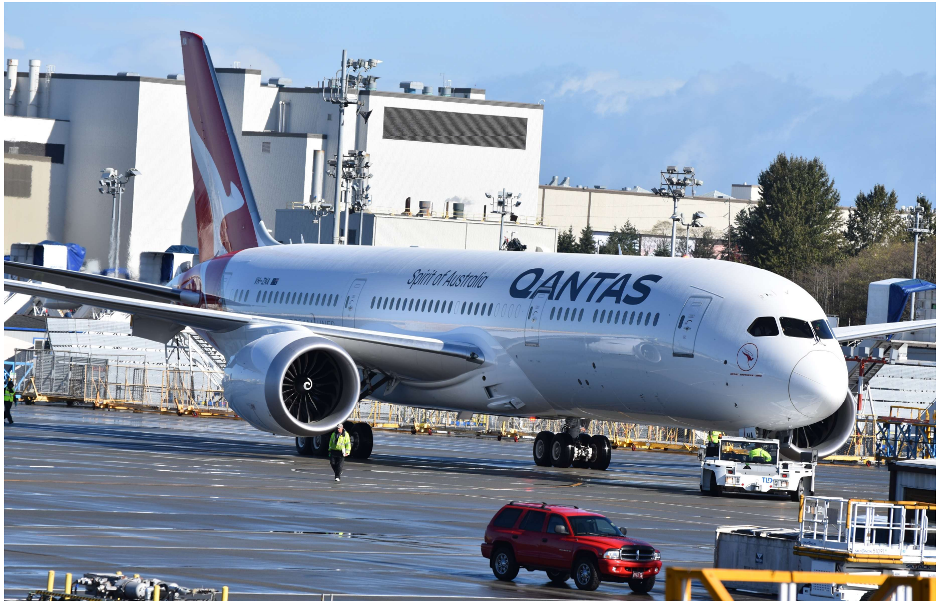
17-Oct-17 – Towing to Paine Field Airport