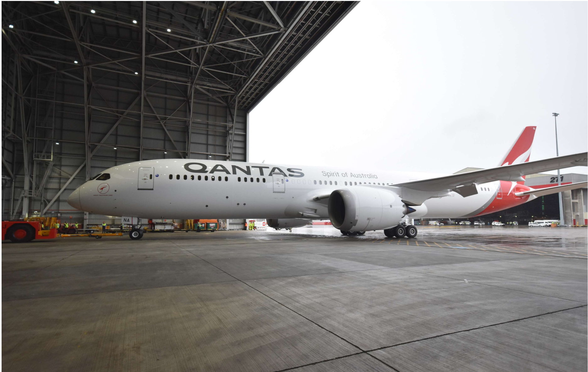
20-Oct-17 – Arrival at Hanger 96