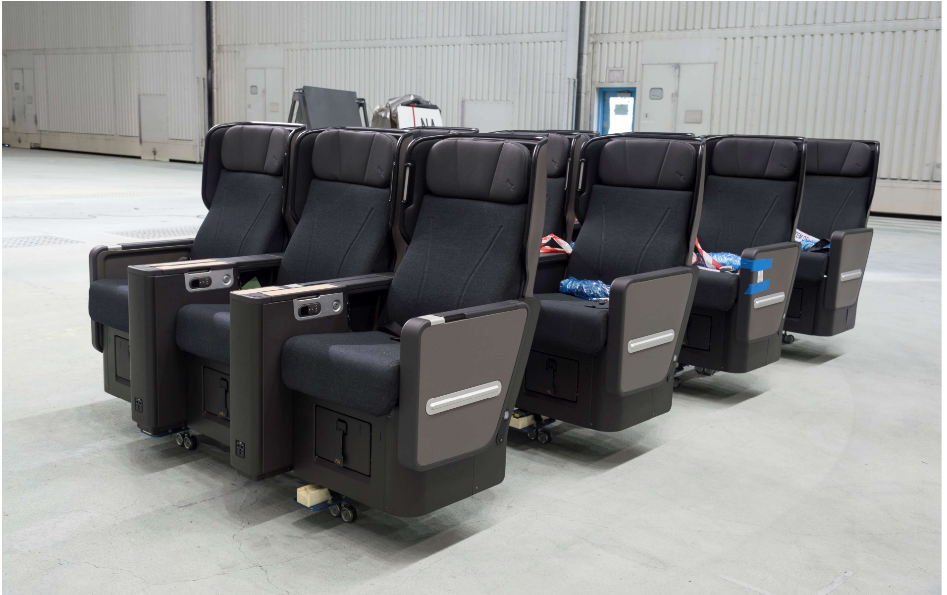
9-Sep-17 – Premium Economy Seats