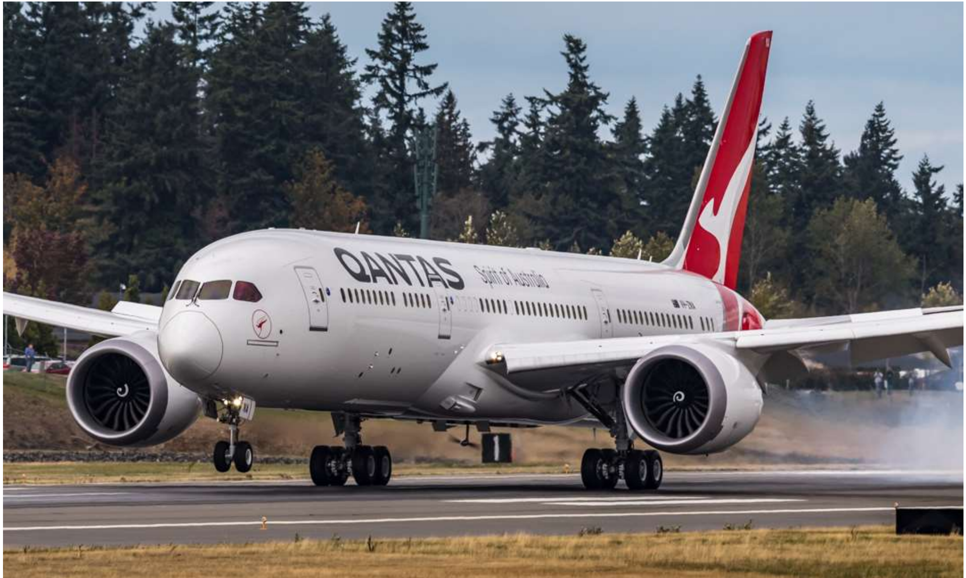
6-Oct-17 – B2 Flight Landing