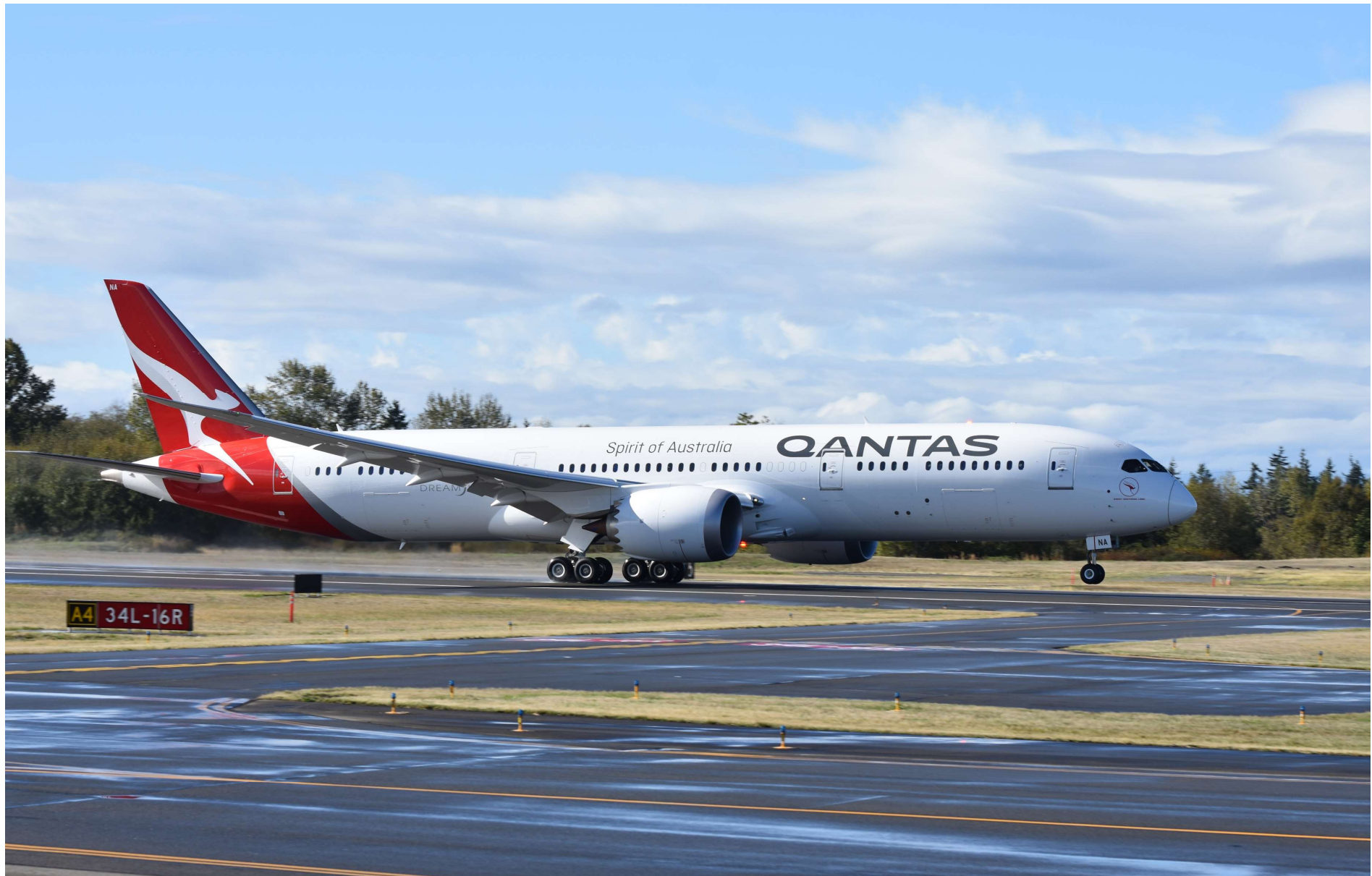
17-Oct-17 – Take Off Roll