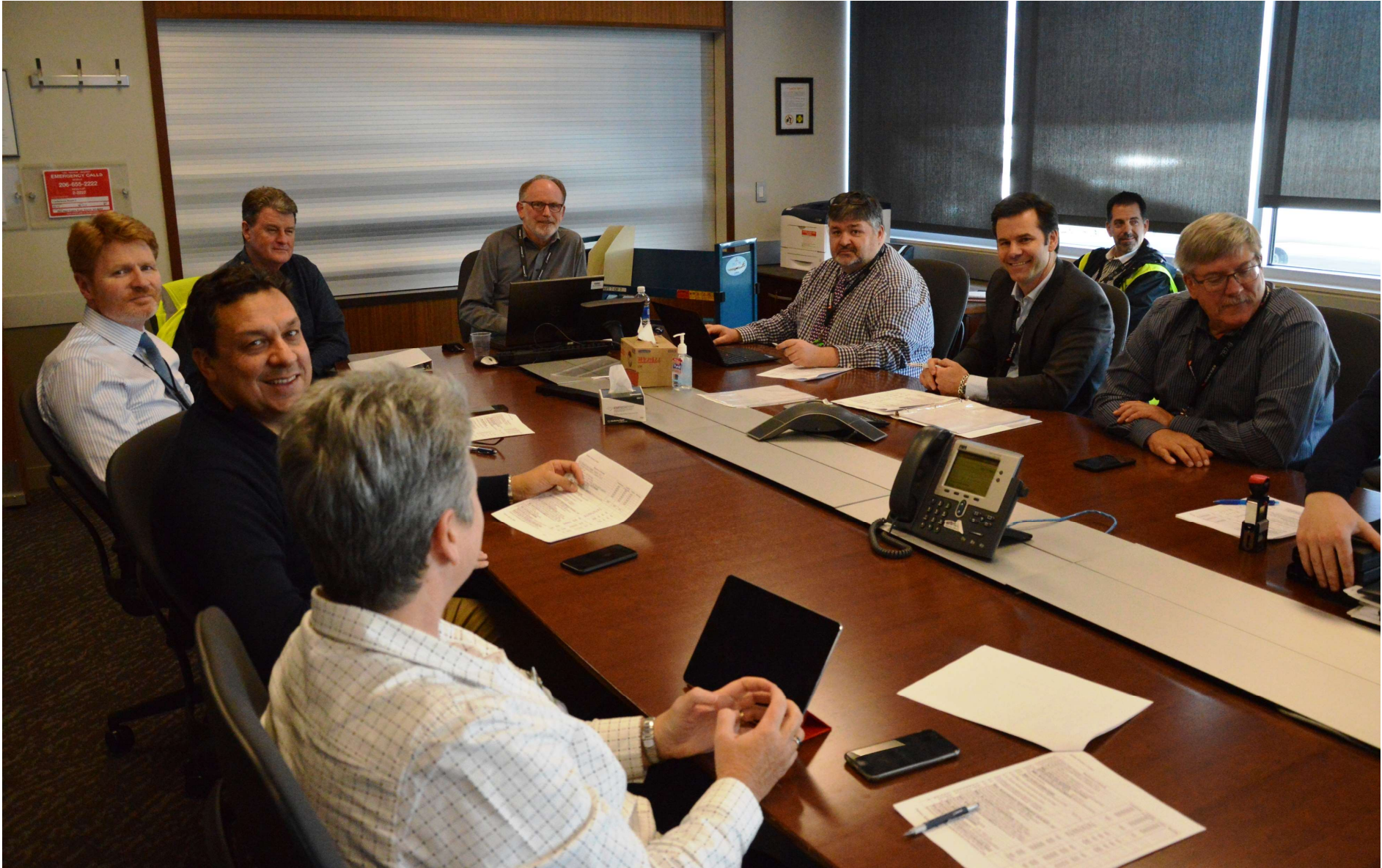
11-Oct-17 – Delivery Room