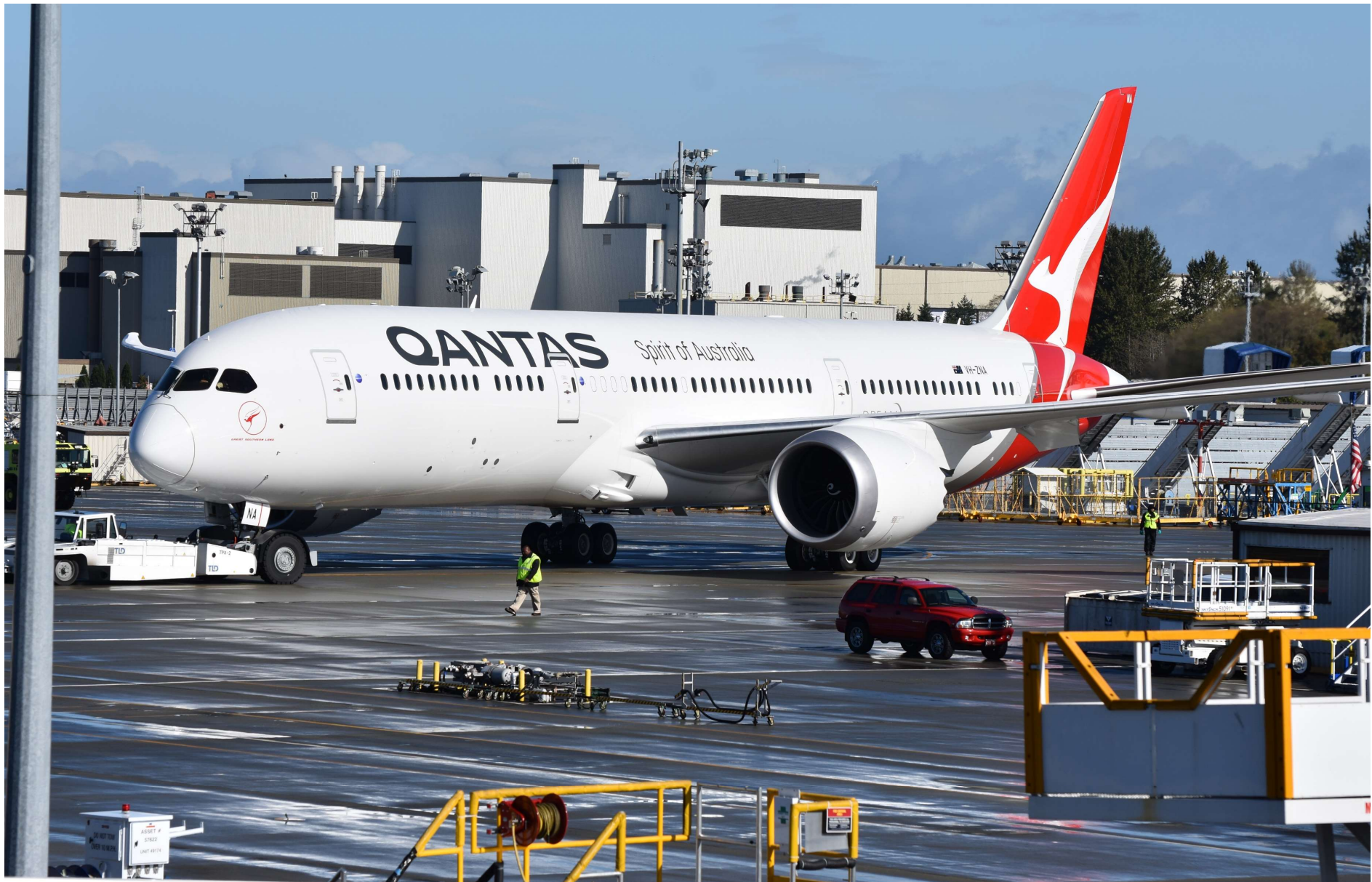
17-Oct-17 – Ready for taxi