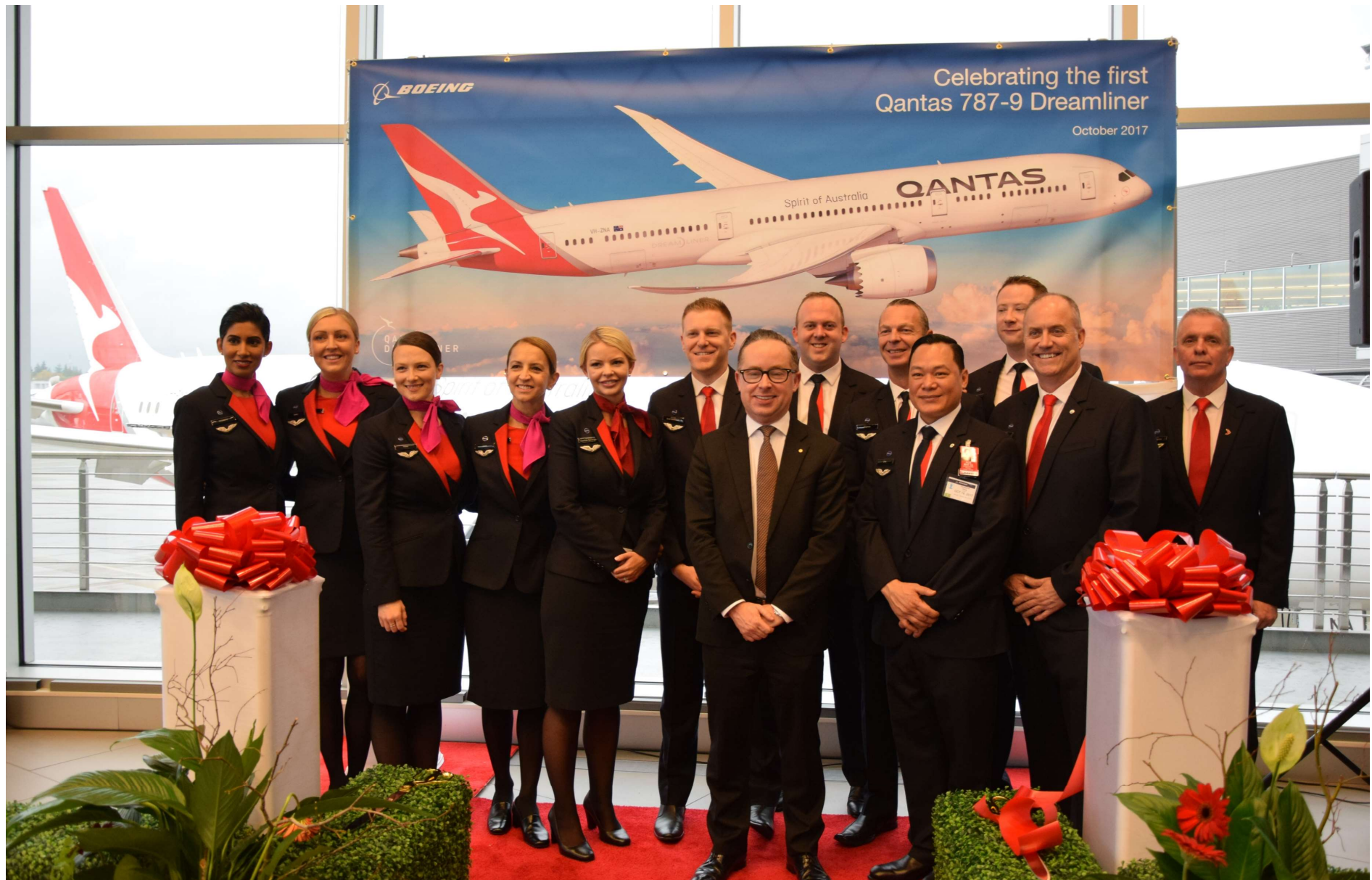
17-Oct-17 – Alan Joyce and Operating Cabin Crew