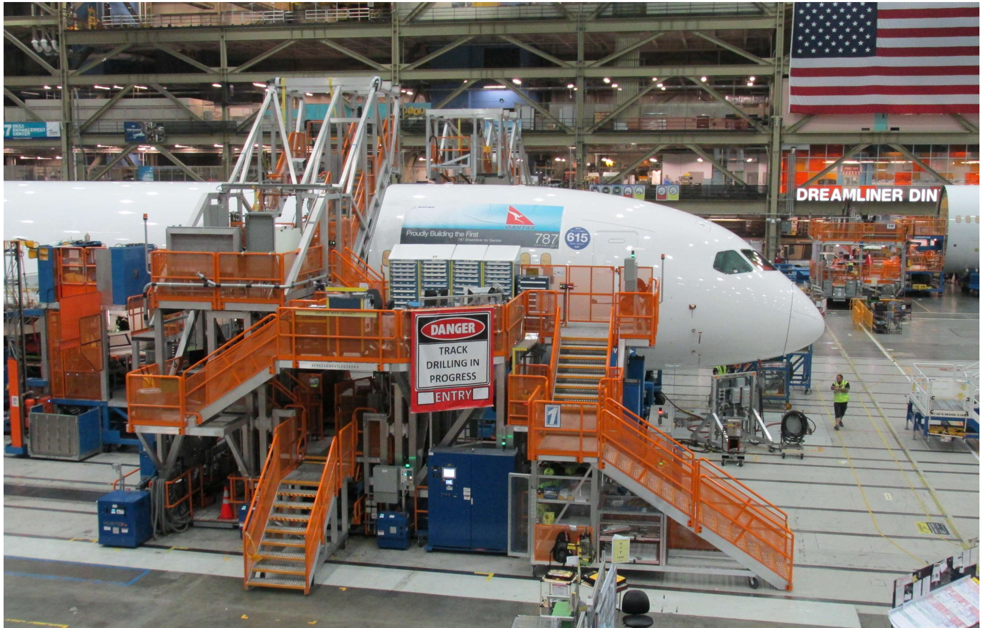
8-Aug-17 – Position 1 – Forward Body Join