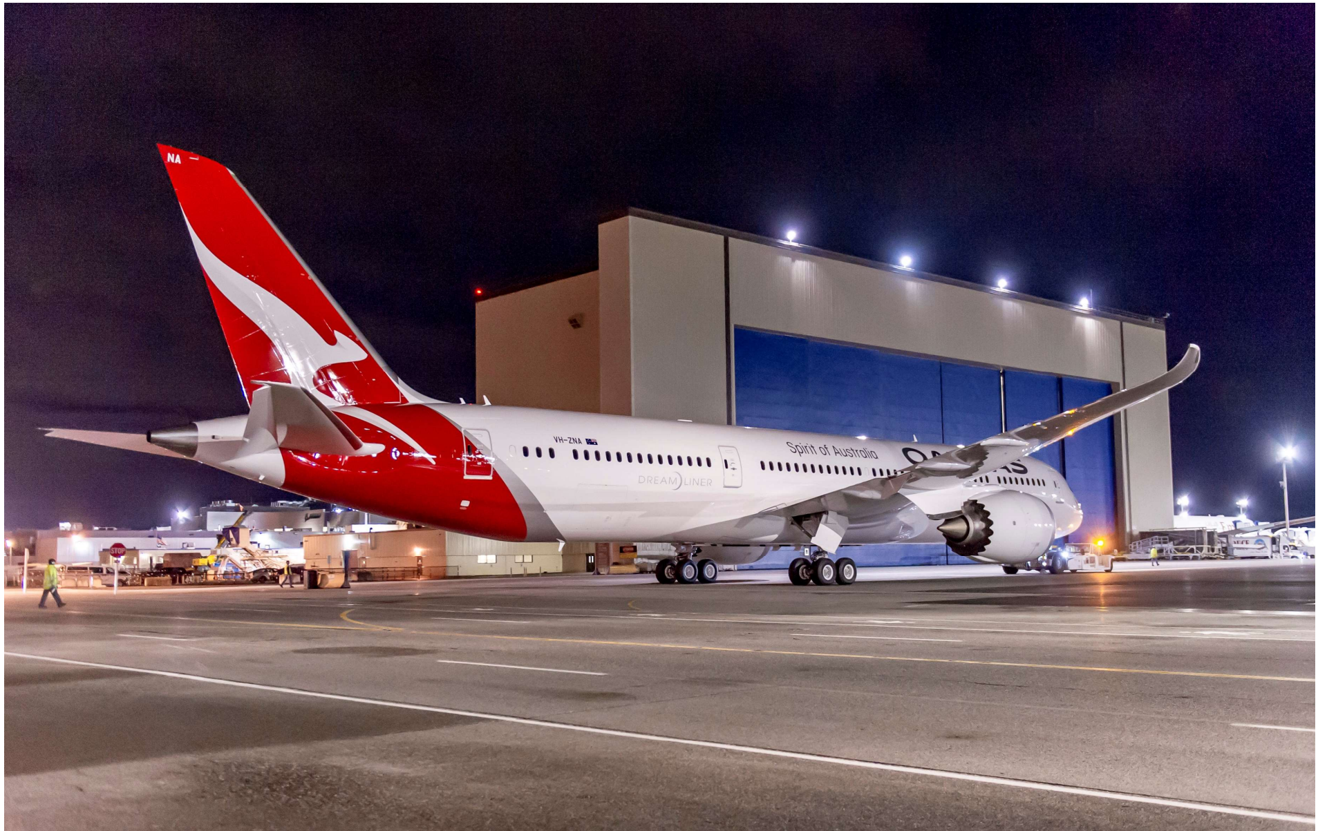
20-Sep-17 - Paint Hangar Roll-Out