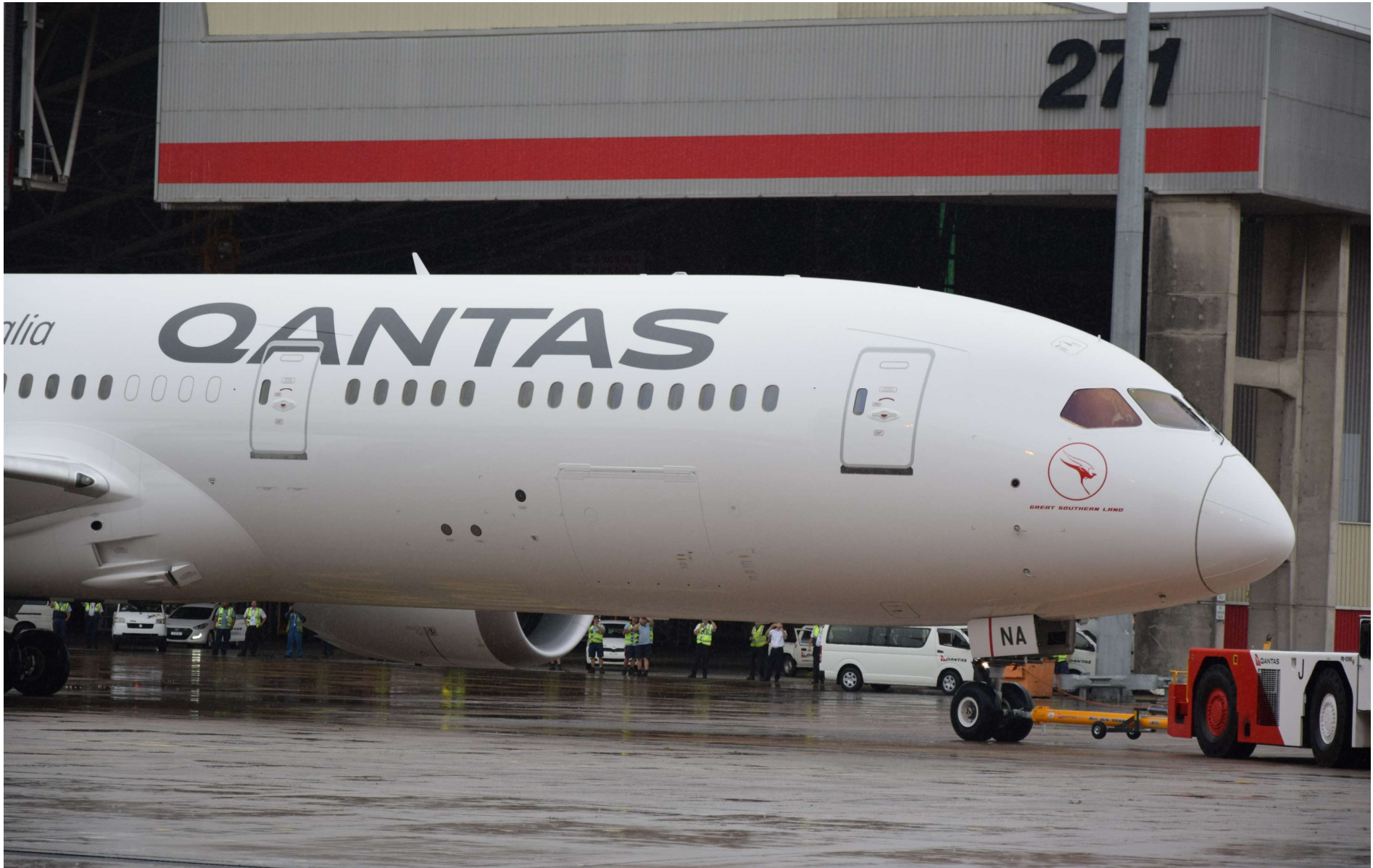
20-Oct-17 – Arrival at Hanger 96 Sydney