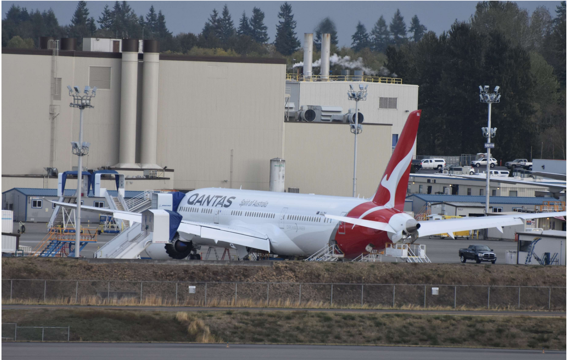
21-Sep-17 - ZNA On the Flight Line