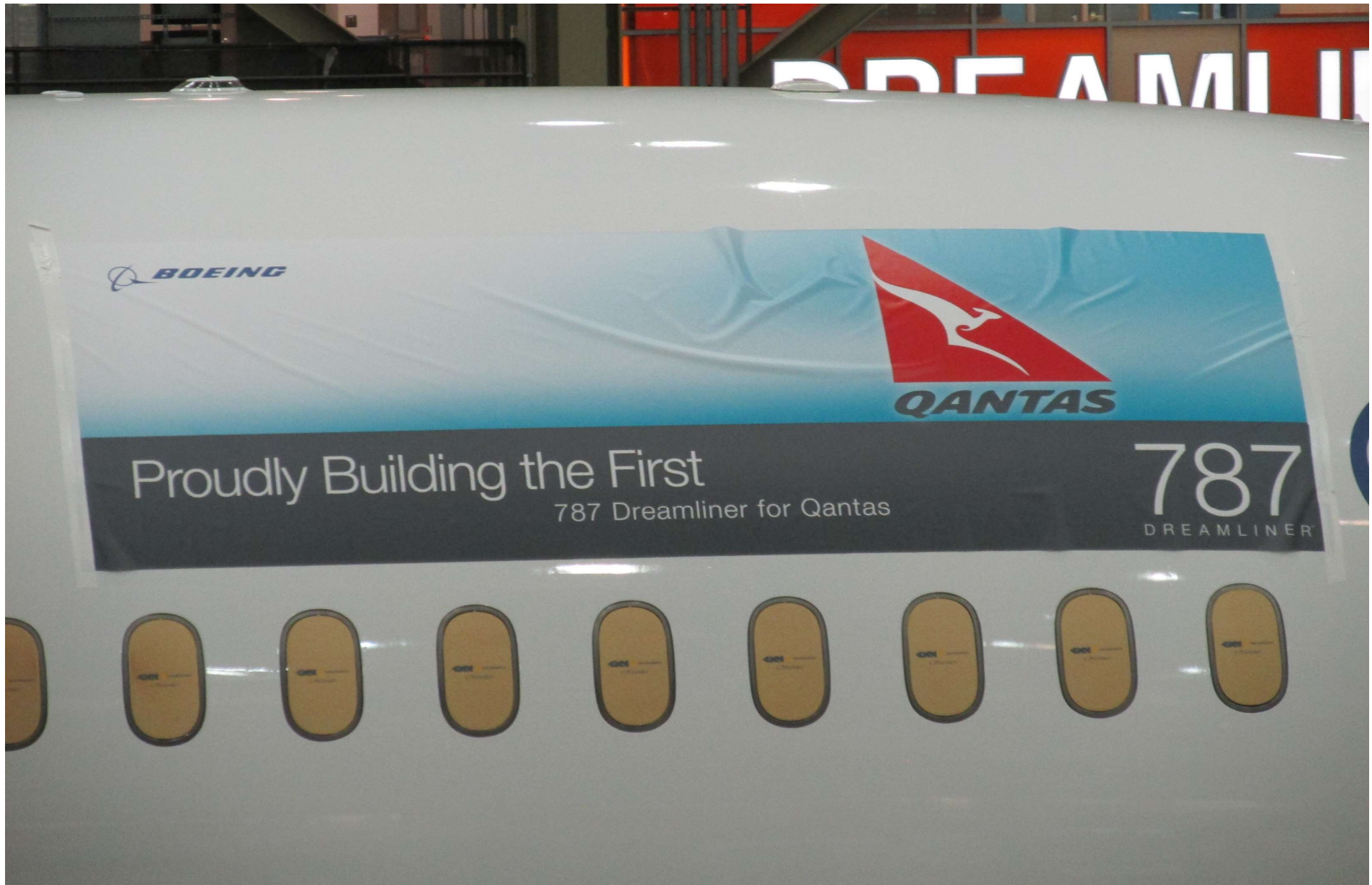
8-Aug-17 – Position 1 – Forward Fuselage