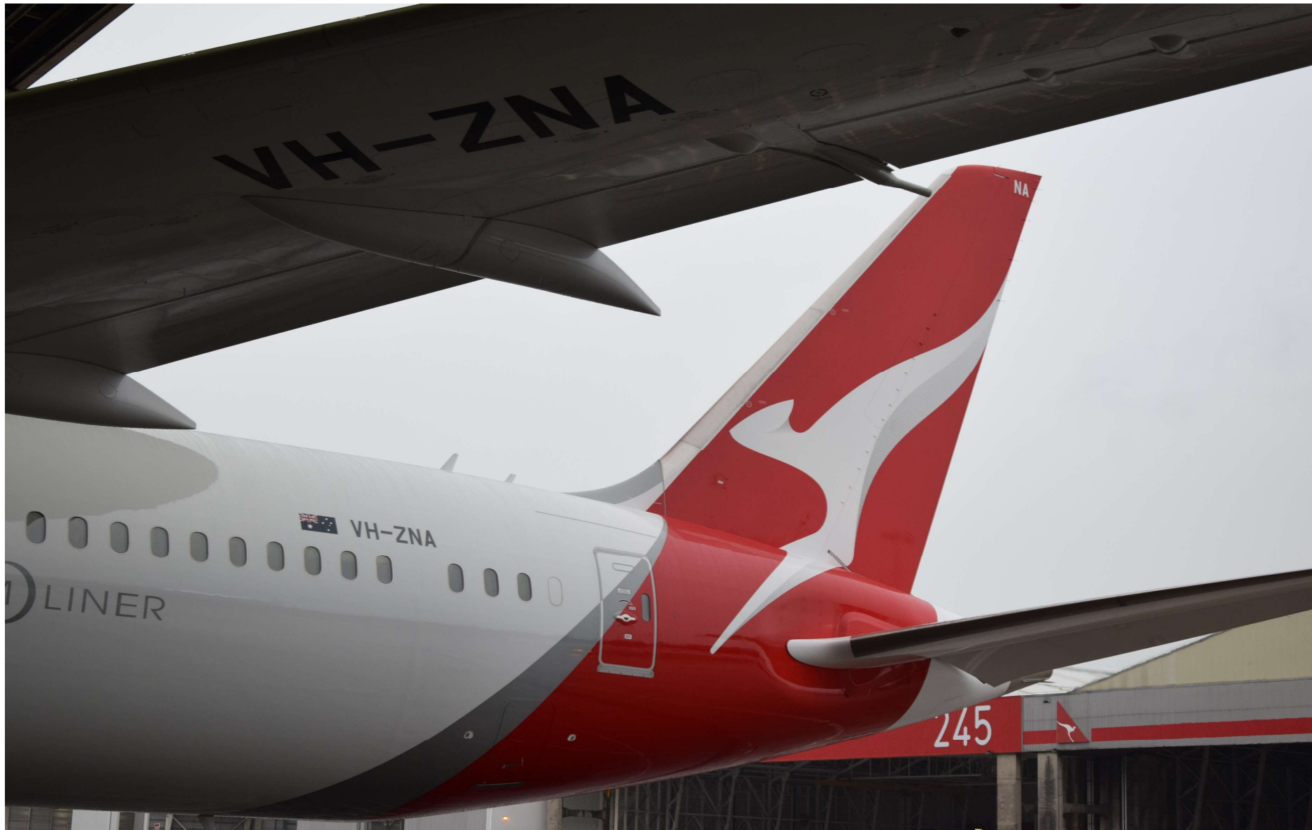
20-Oct-17 – New Silver Roo Livery