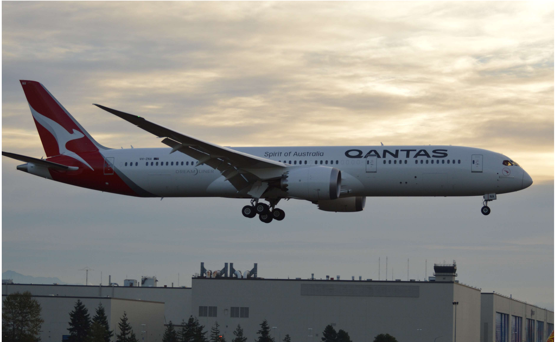
6-Oct-17 – B2 Flight Landing