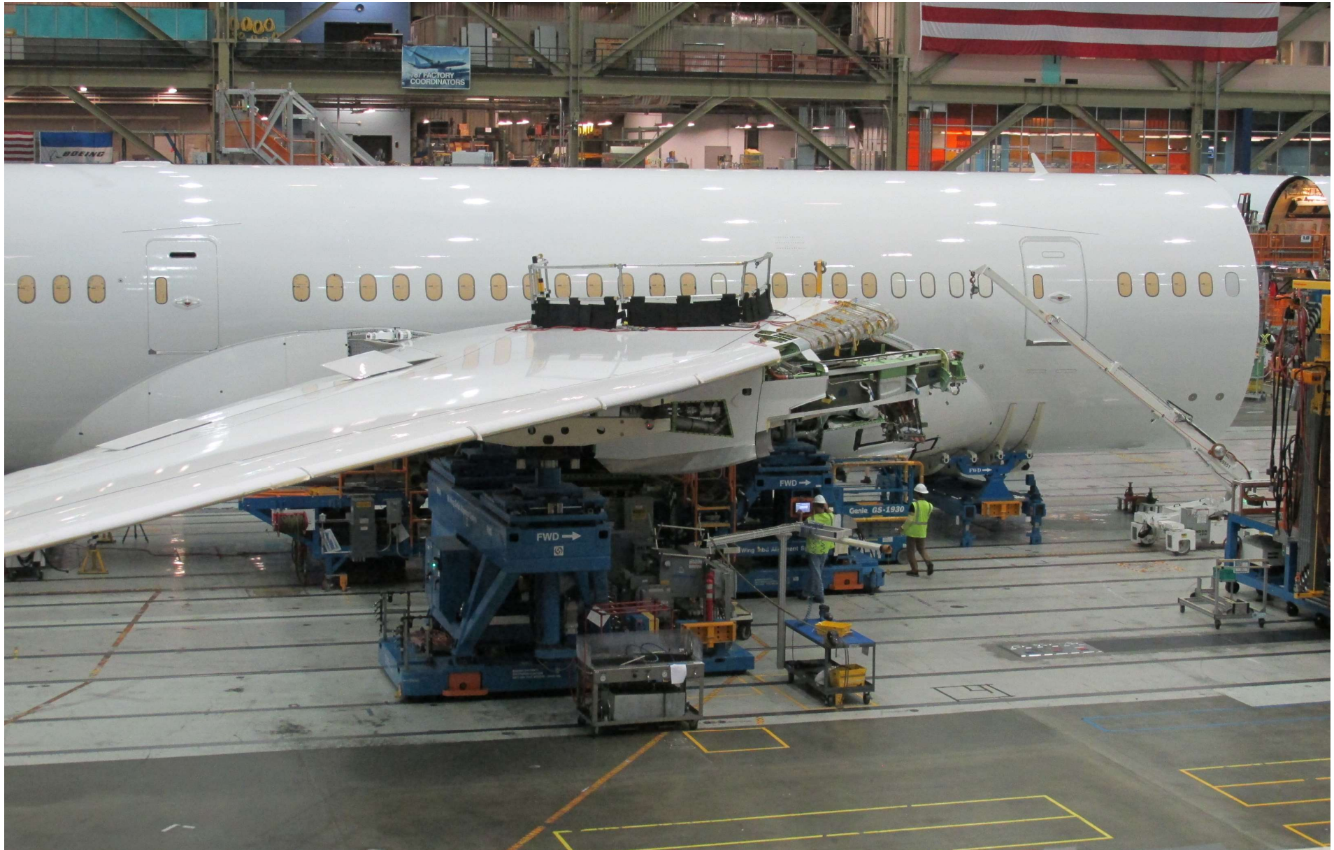
8-Jul-17 – Position 1 – Wing Positioning