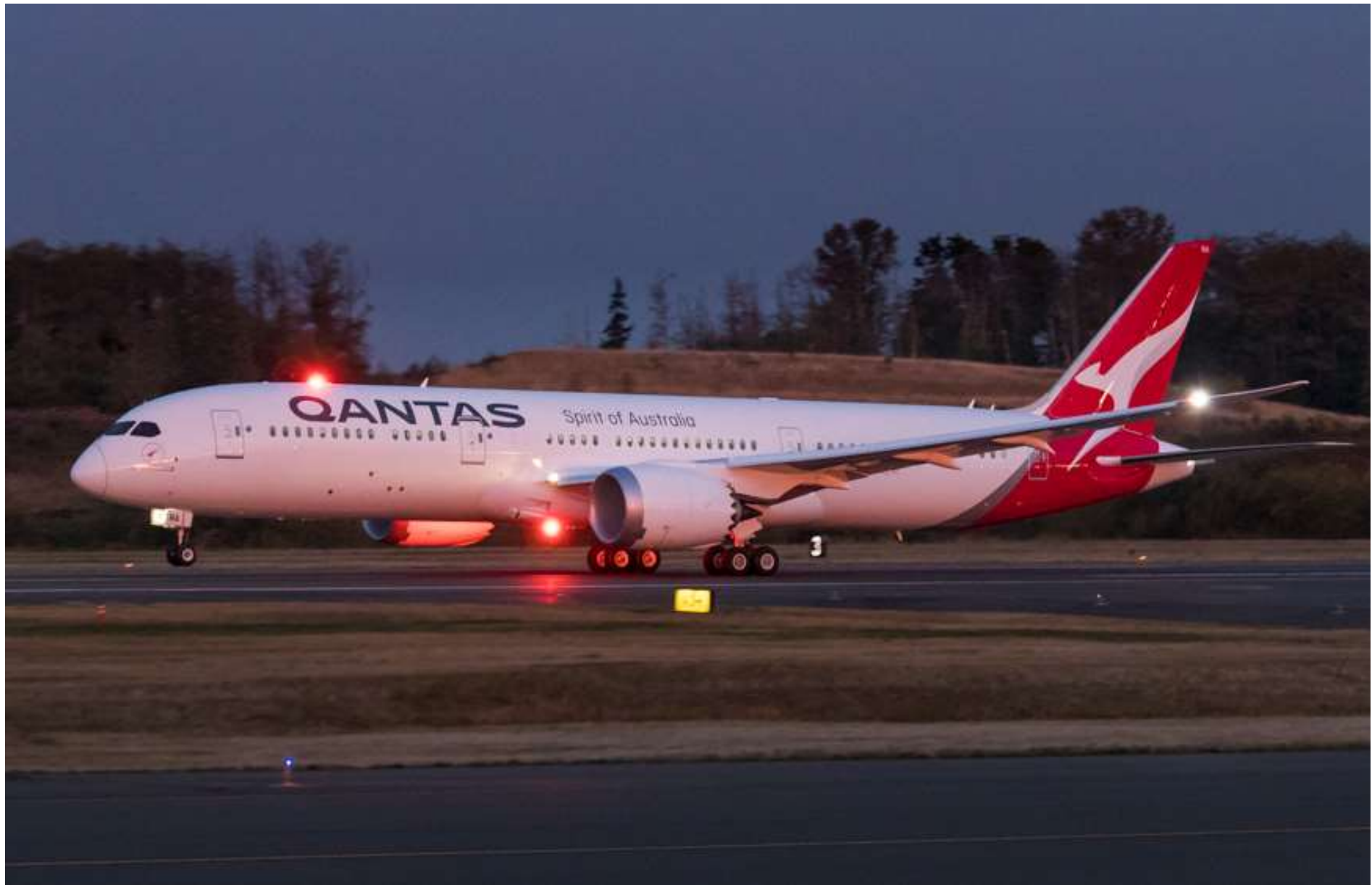
6-Oct-17 – B2 Flight Take Off