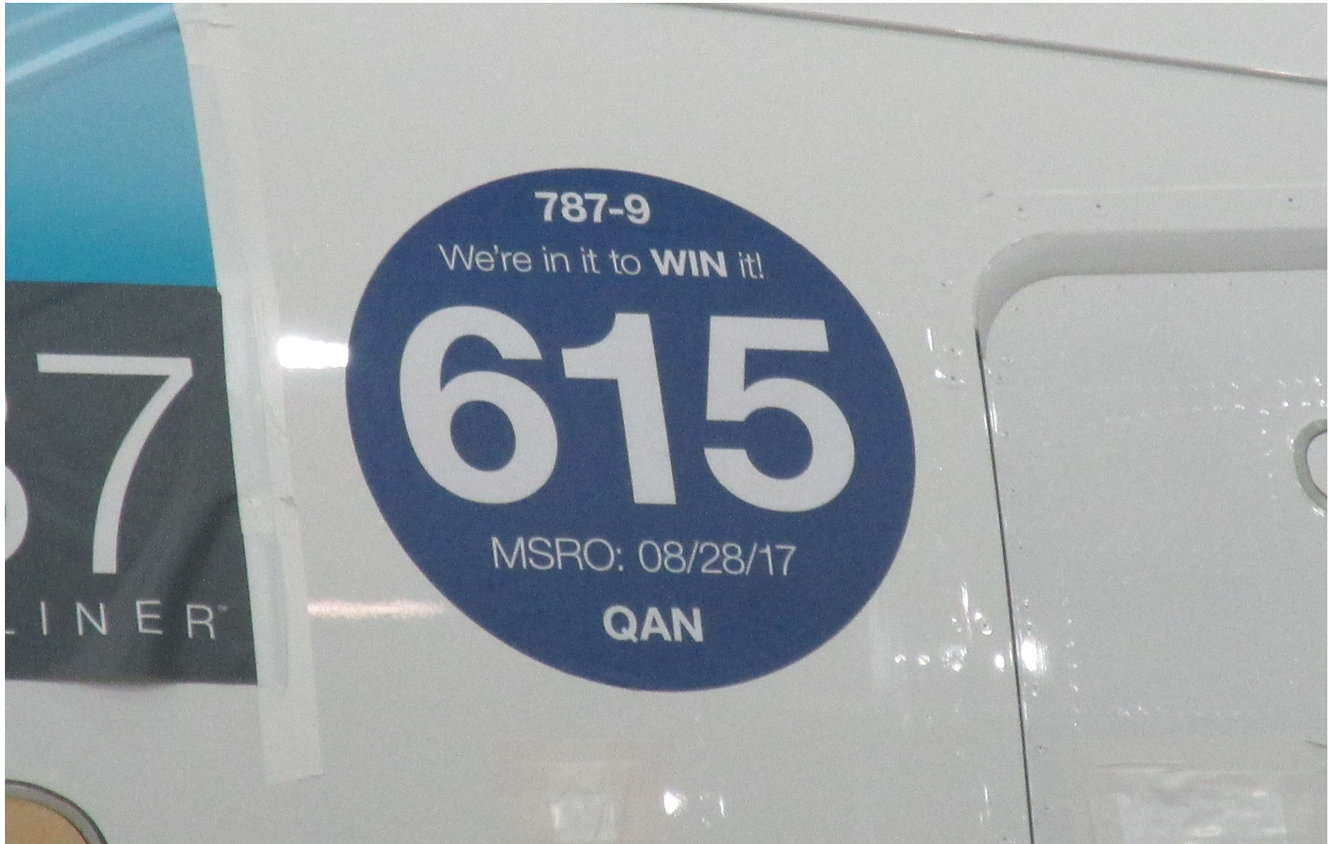
8-Aug-17 – Position 1 – Qantas 787-9 VH-ZNA – Line Number 615