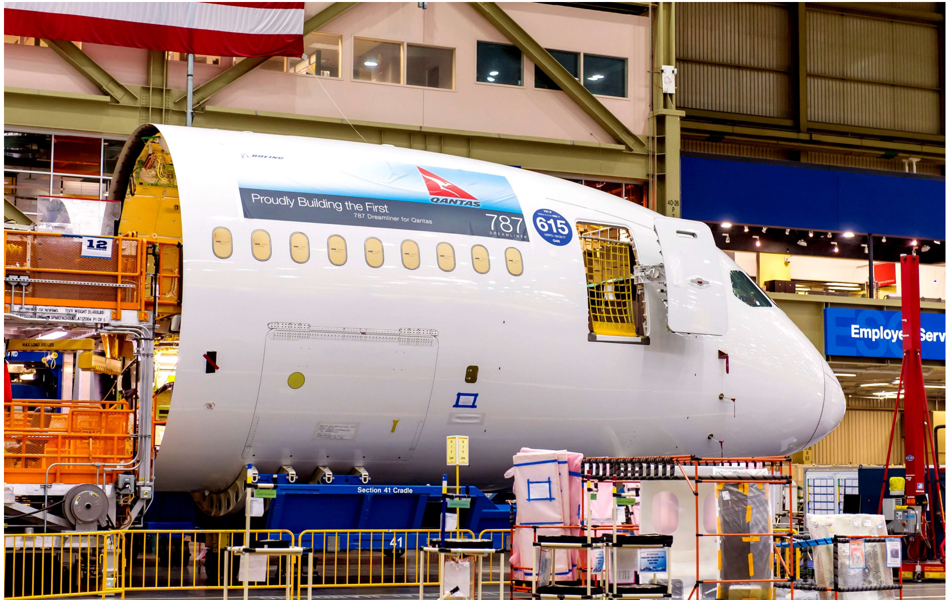
8-Aug-17 – Position 0 - Fwd Fuselage – Section 41