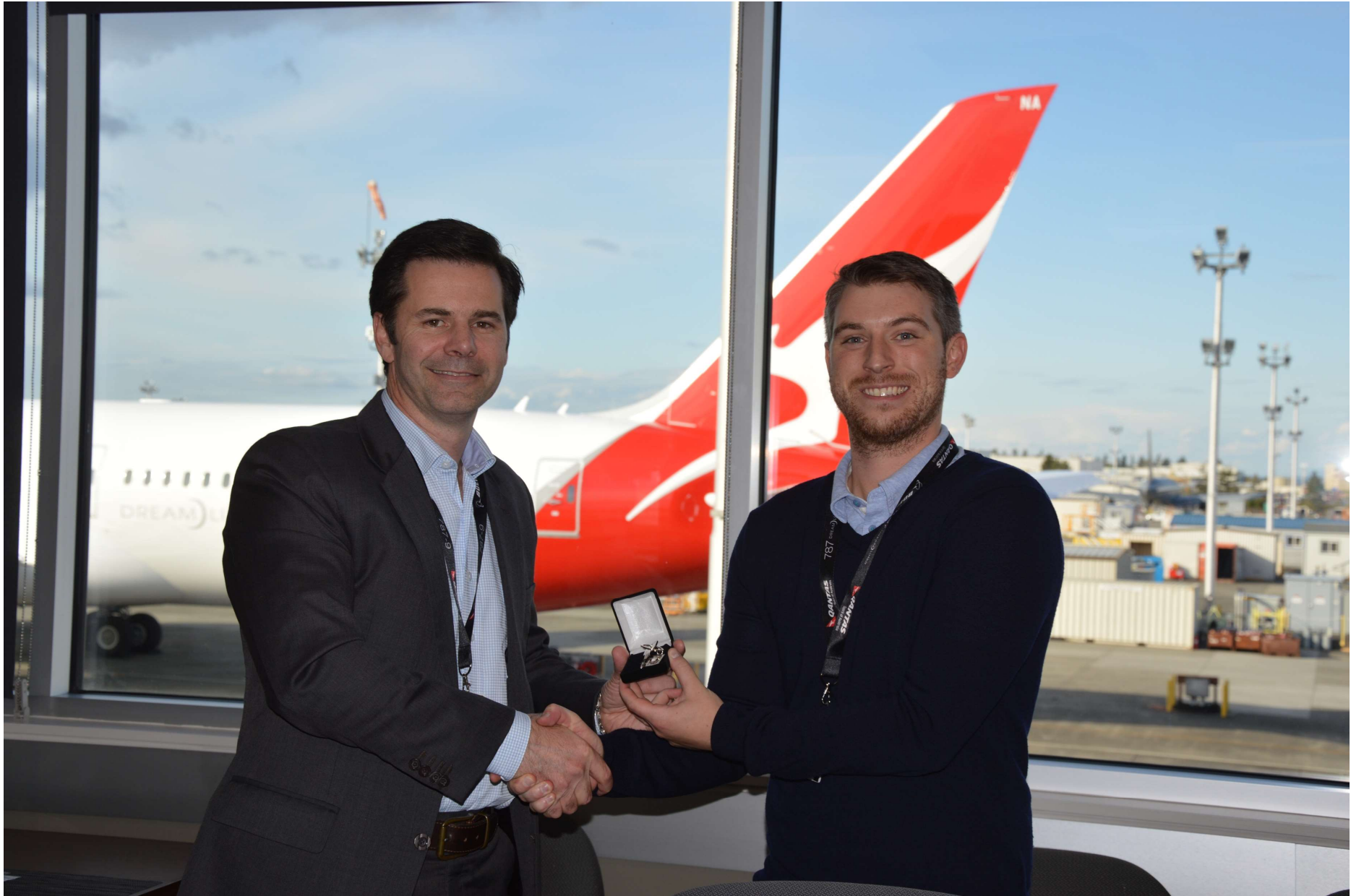
11-Oct-17 – Delivery Completed – Handover of Ceremonial Key