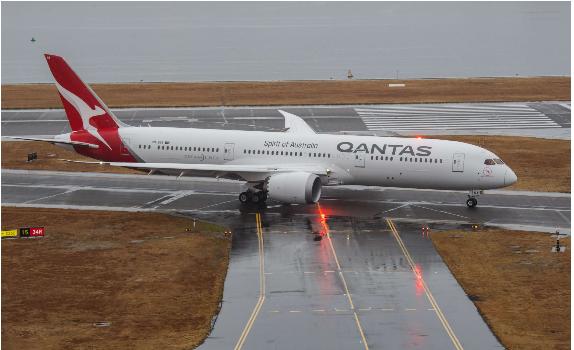
20-Oct-17 – Taxing Sydney