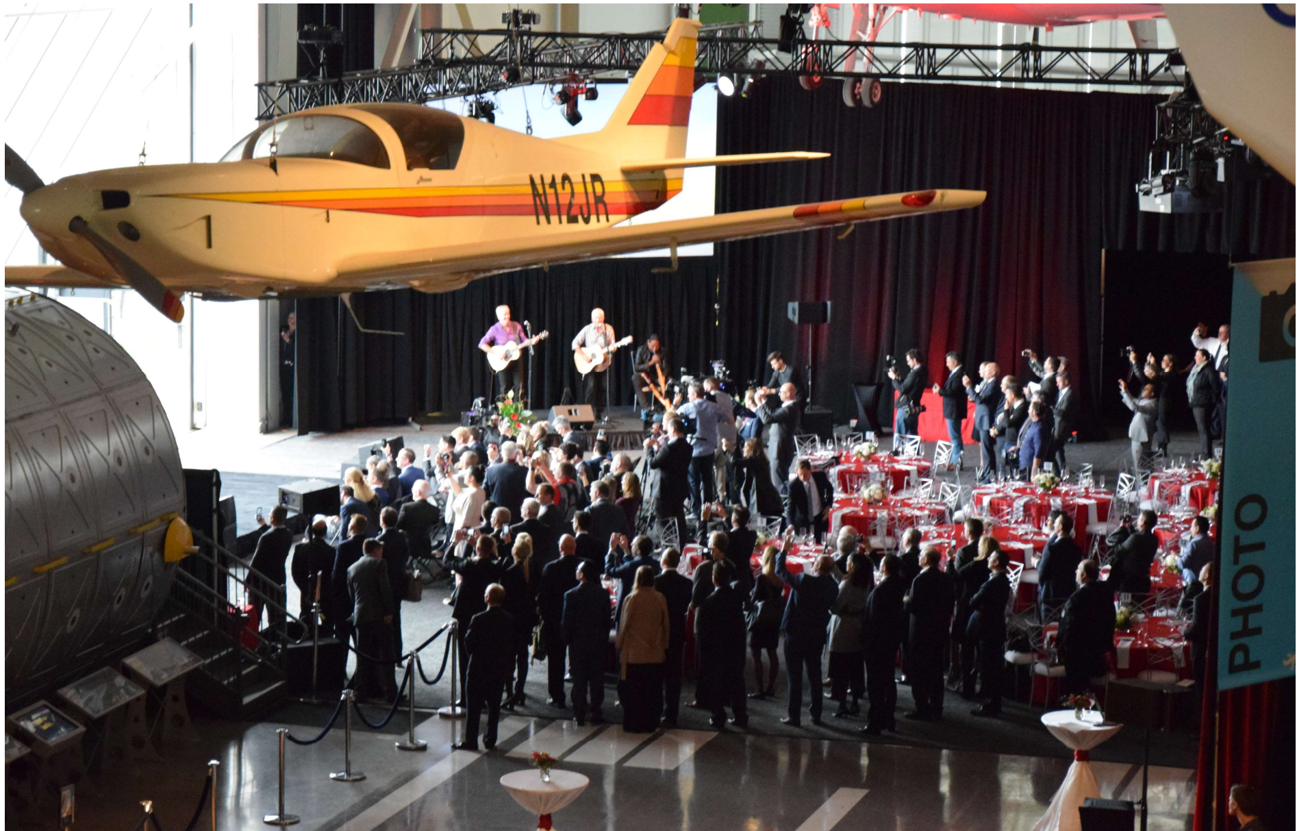
16-Oct-17 – Unveiling Ceremony and Dinner