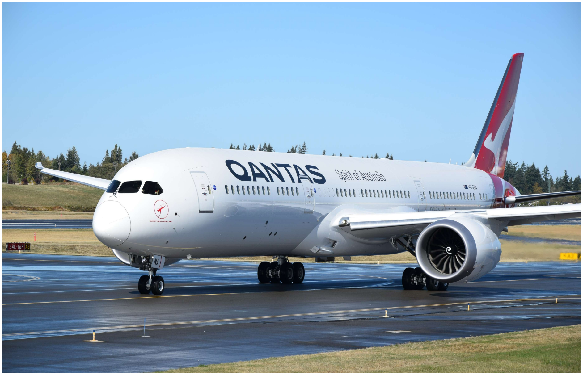
17-Oct-17 – Taxi For Take Off