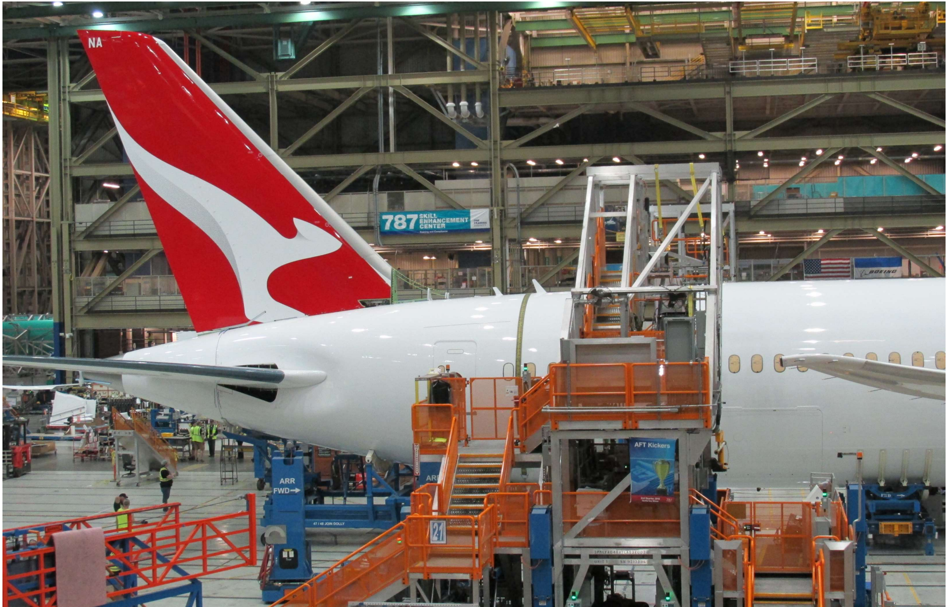
8-Aug-17 – Position 1 – Aft Fuselage Join