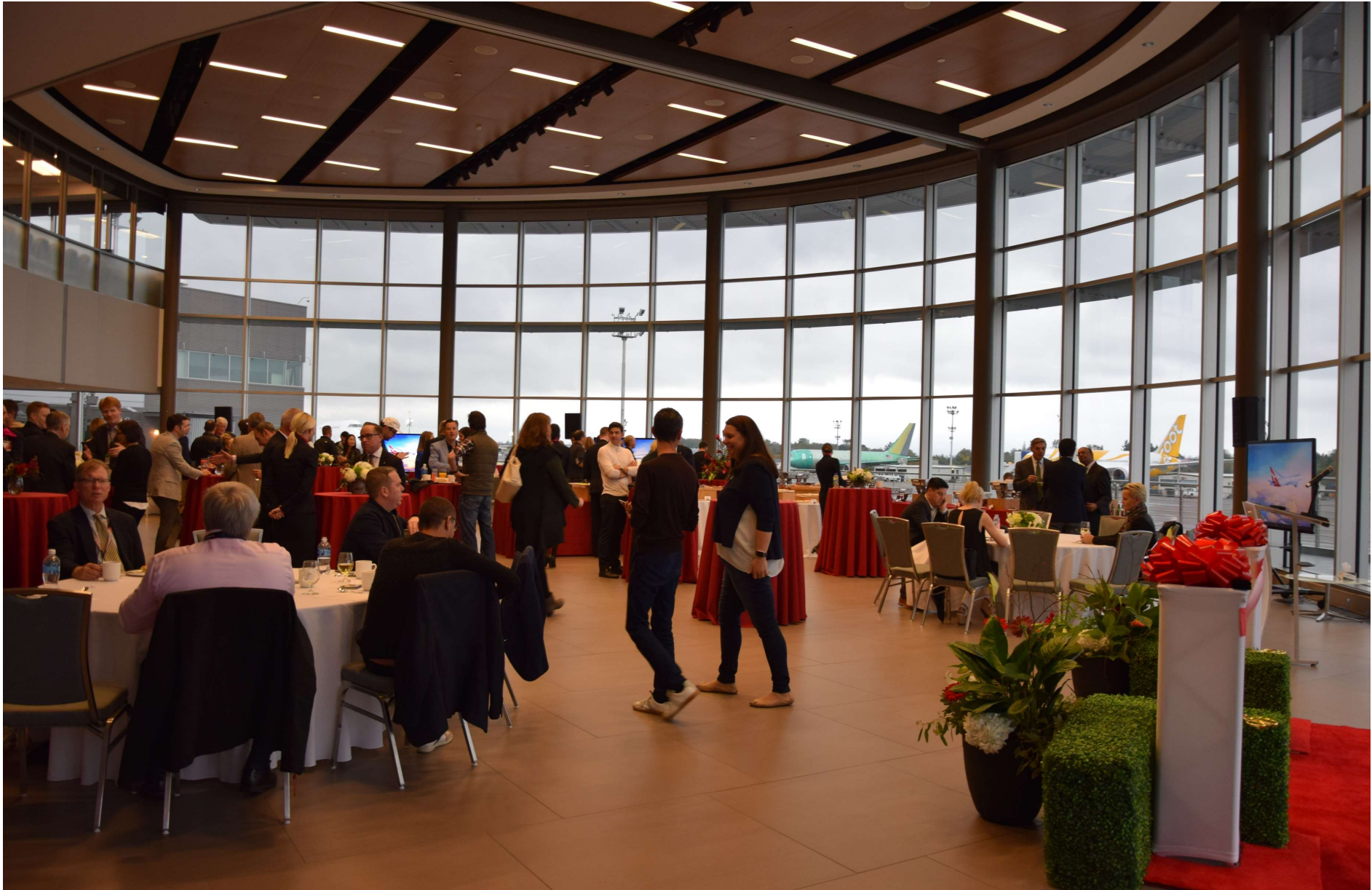
17-Oct-17 – Boeing and Qantas Guests