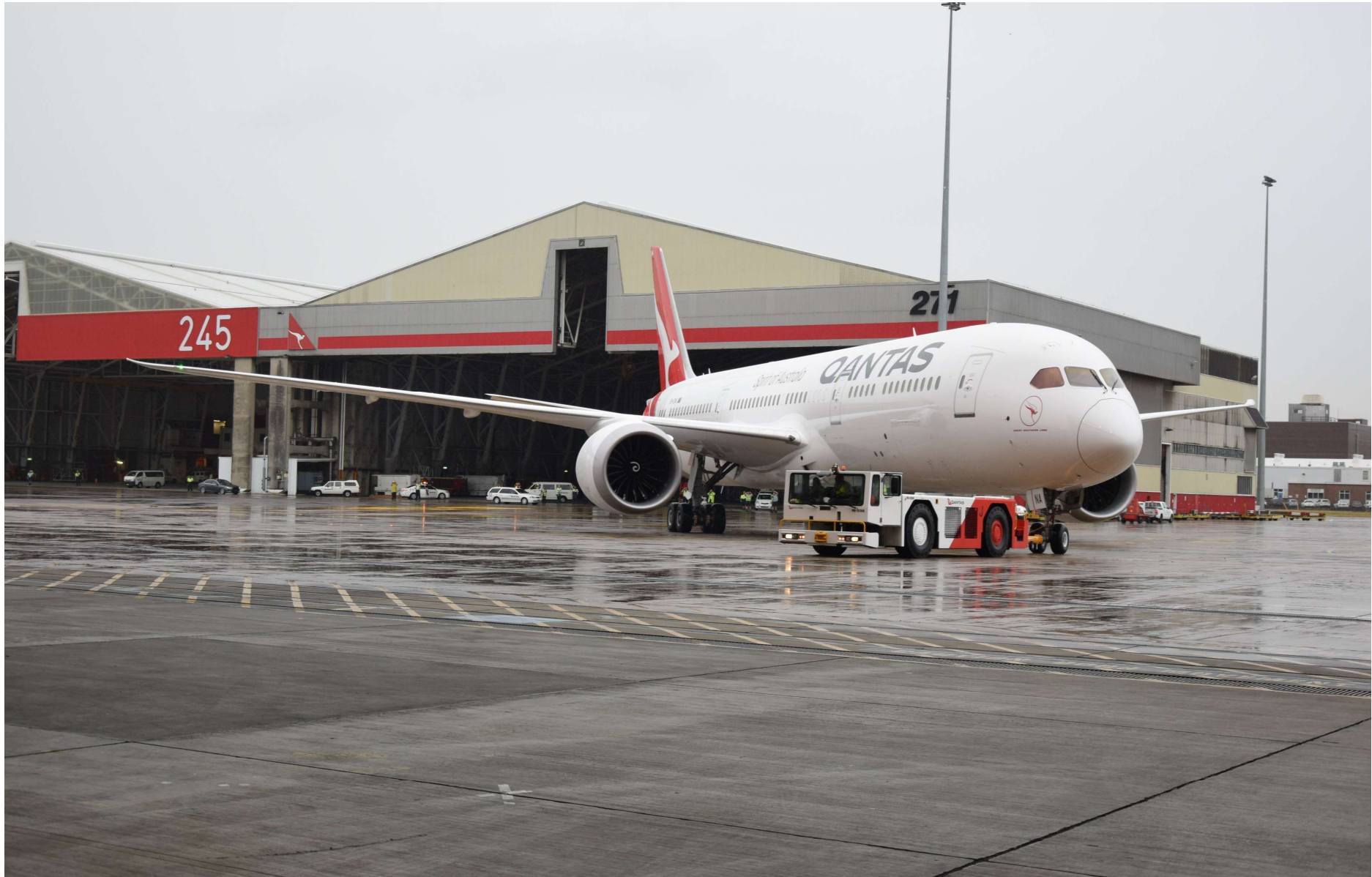
20-Oct-17 – Arrival at Hanger 96 Sydney