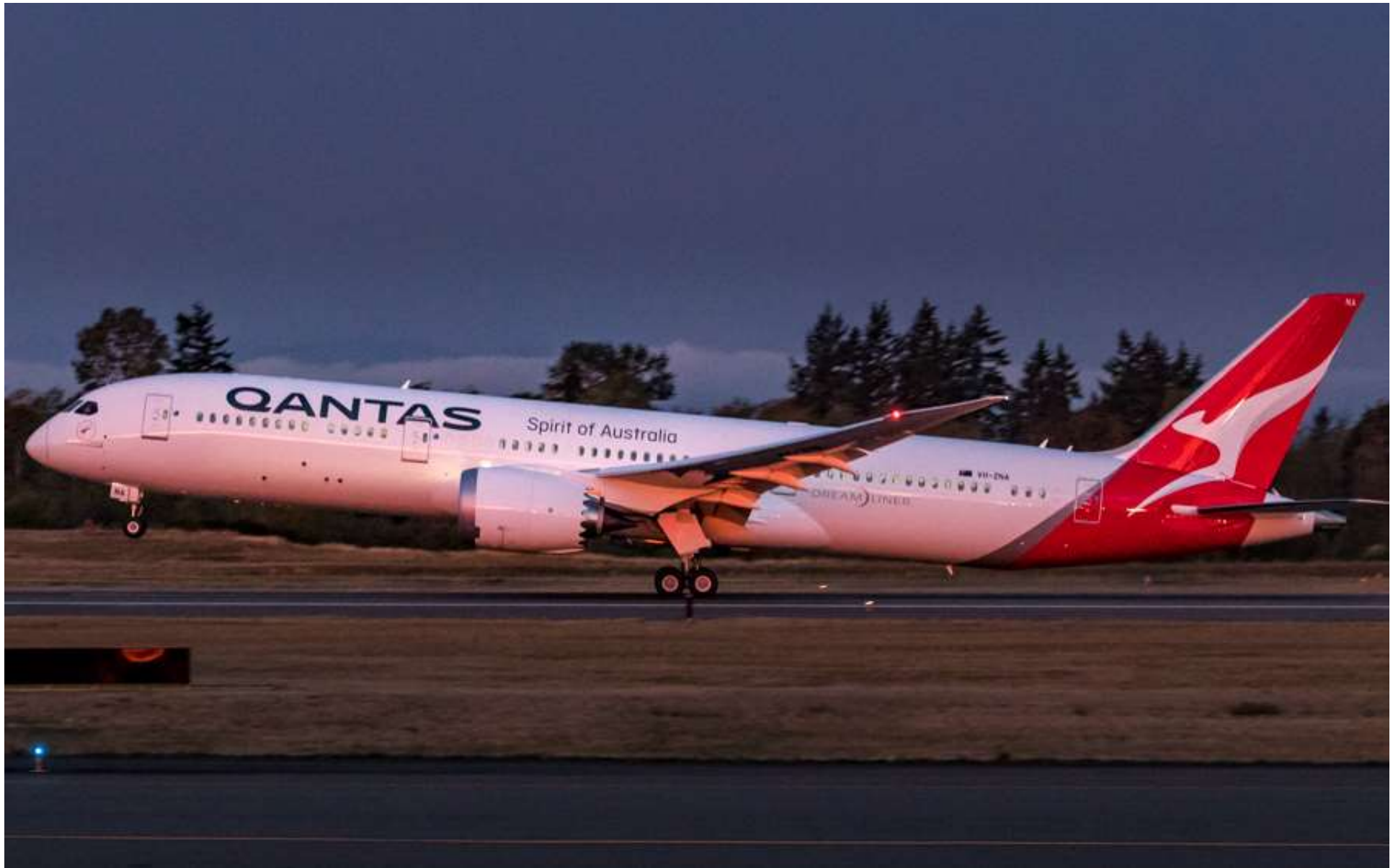
6-Oct-17 – B2 Flight Take Off