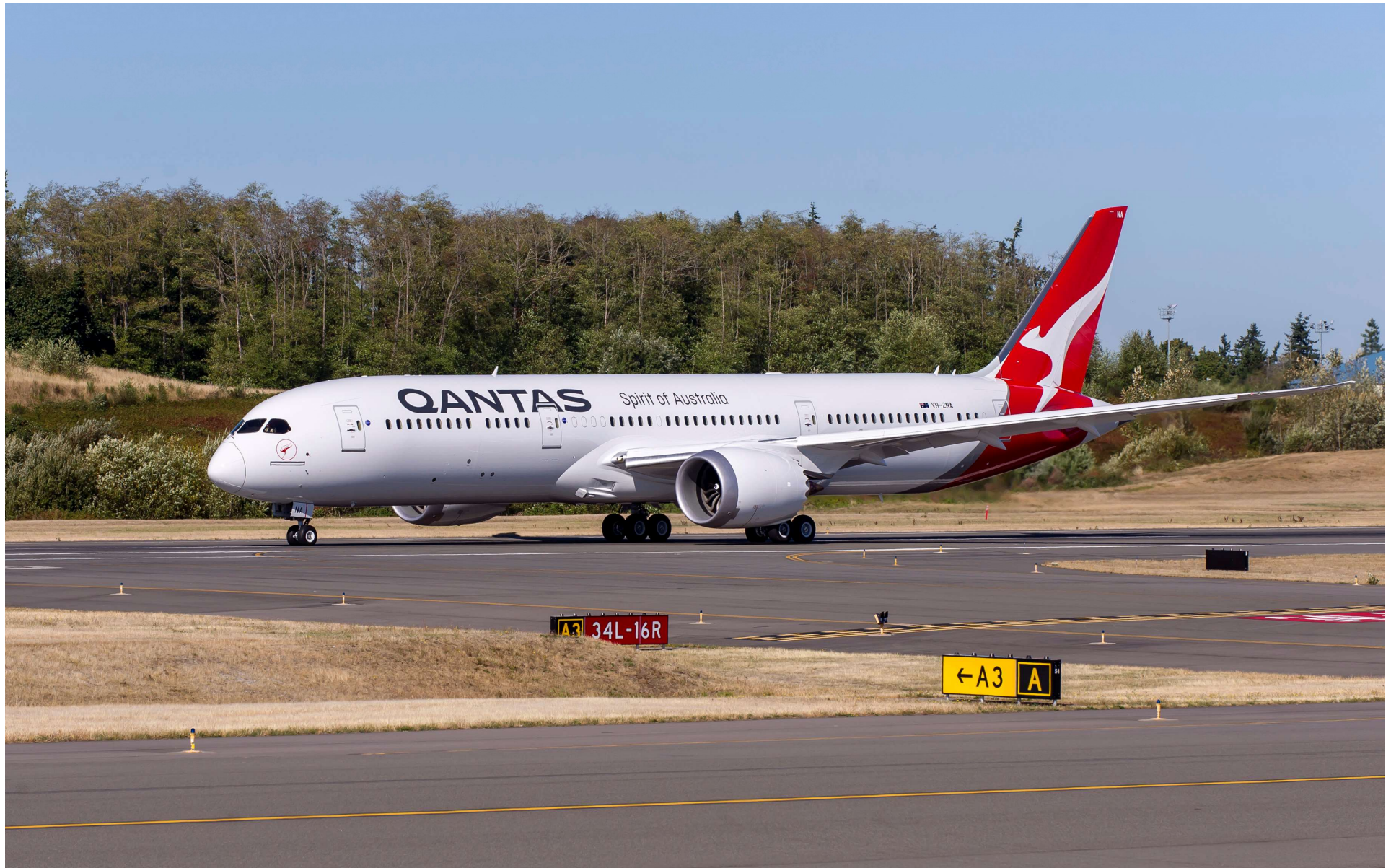
28-Sep-17 - B1 Flight Taxi Checks