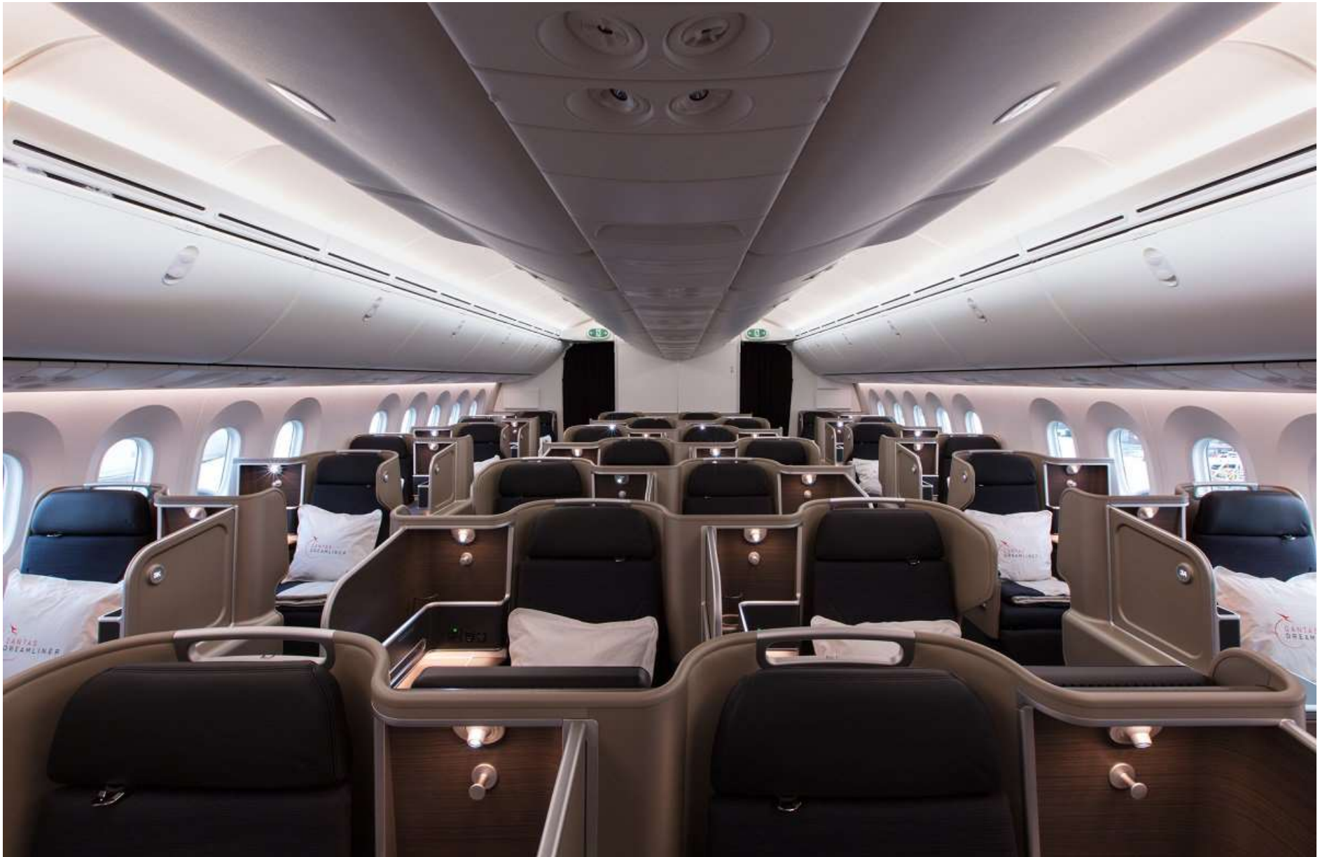
11-Oct-17 – Business Class Seating