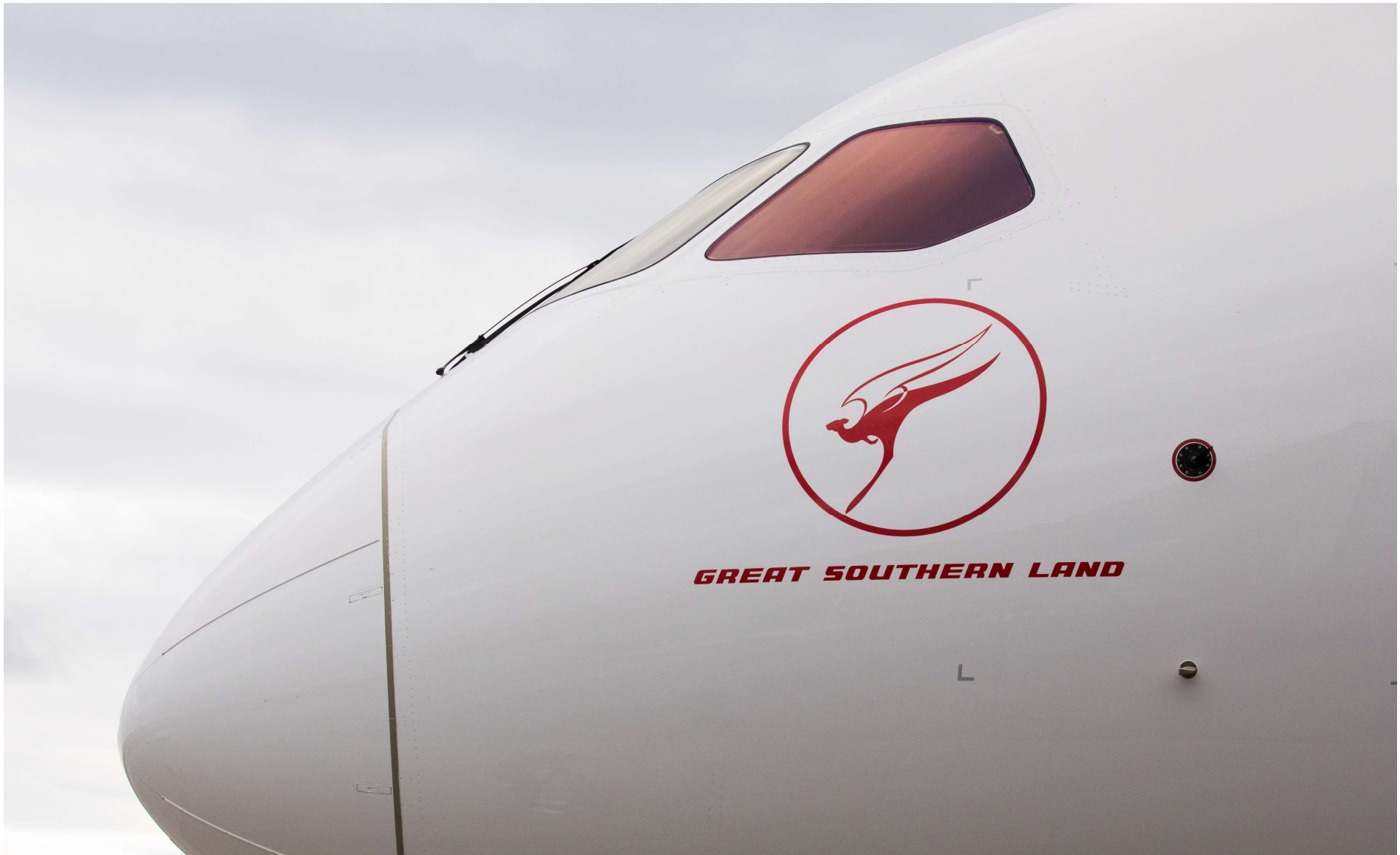
16-Oct-17 – Unveiling Great Southern Land