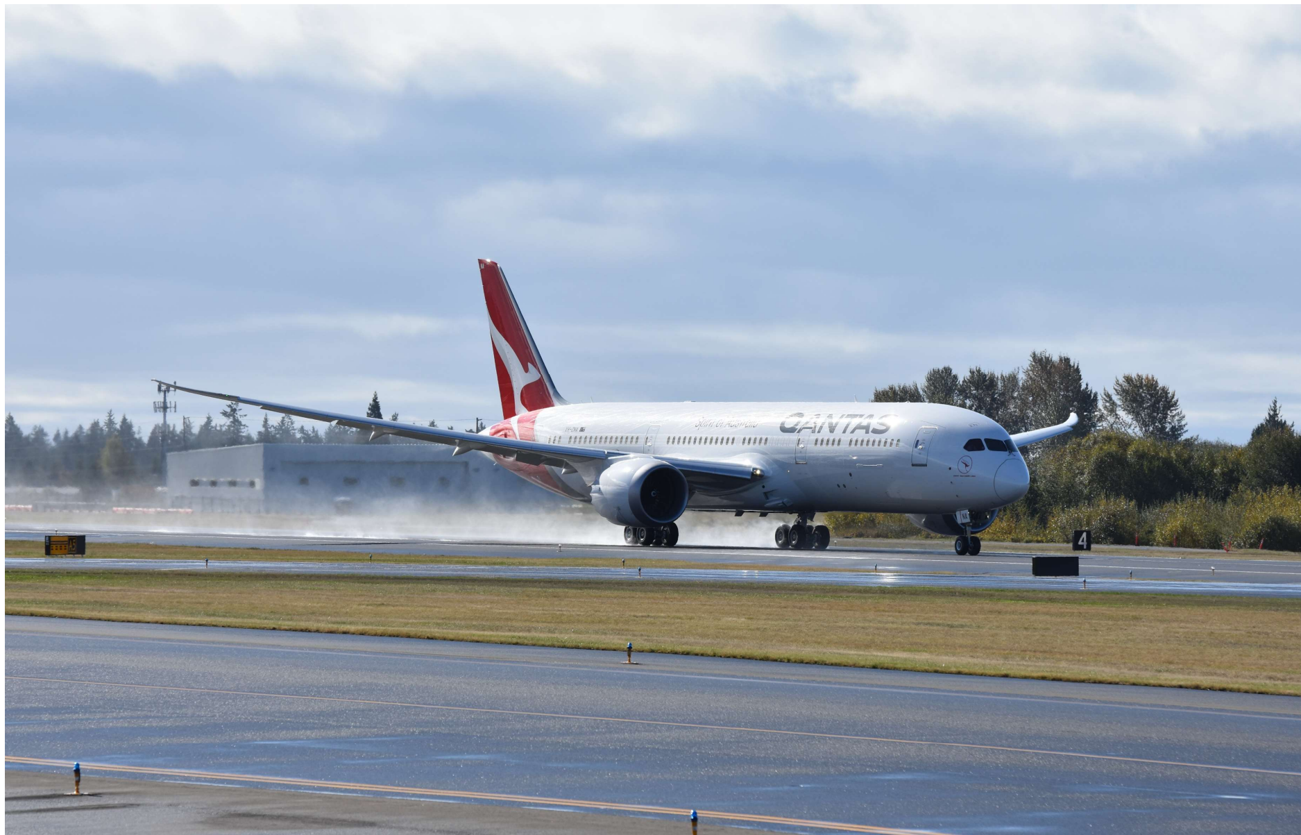
17-Oct-17 – Take Off Roll