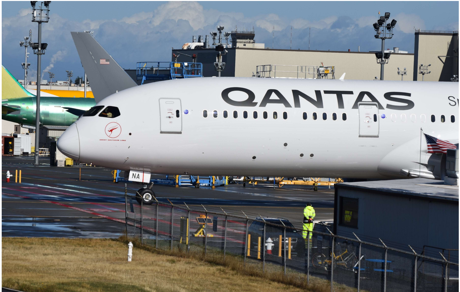
17-Oct-17 – First Qantas Movement