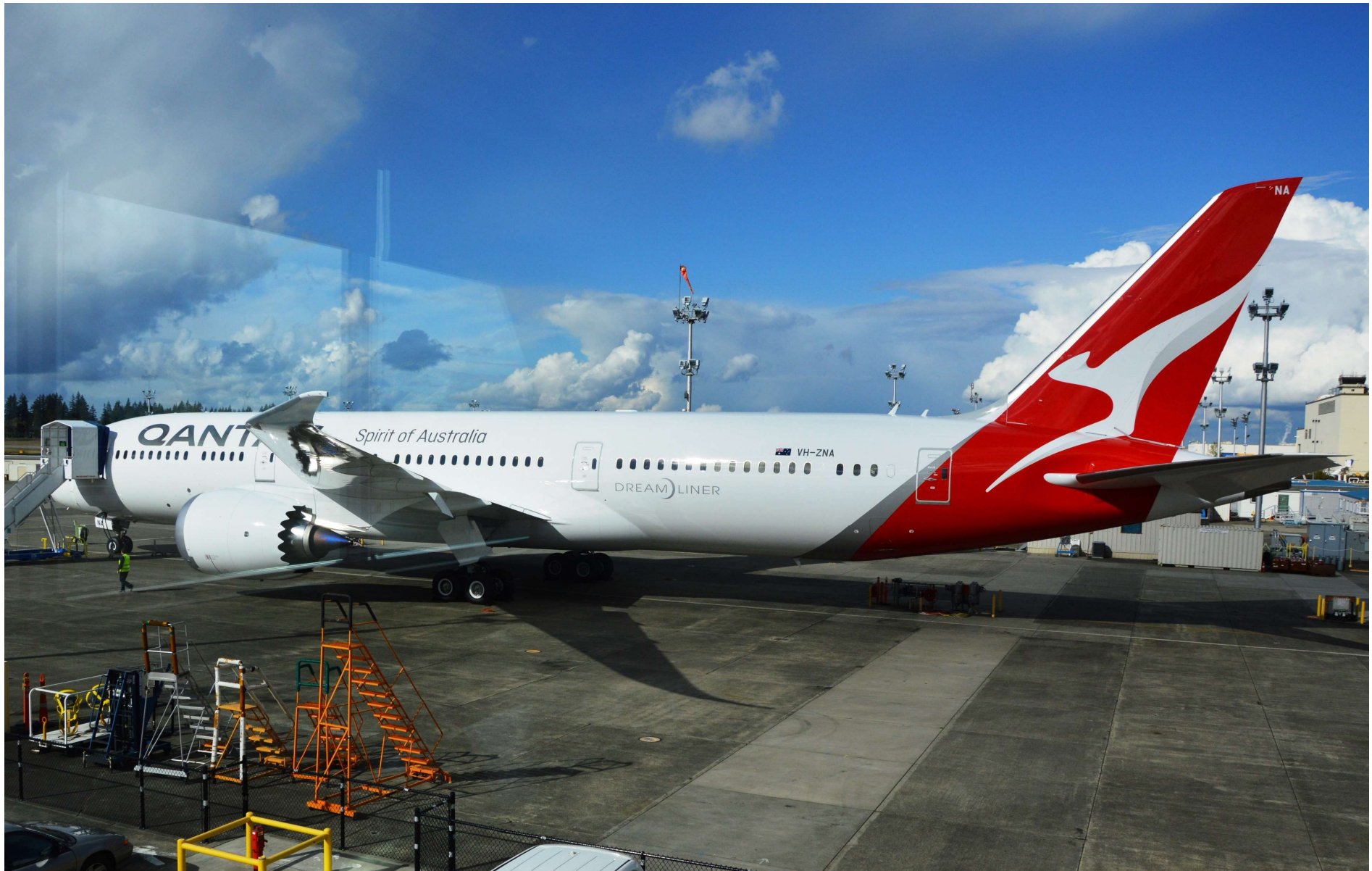
11-Oct-17 – Aircraft Prepared for Delivery