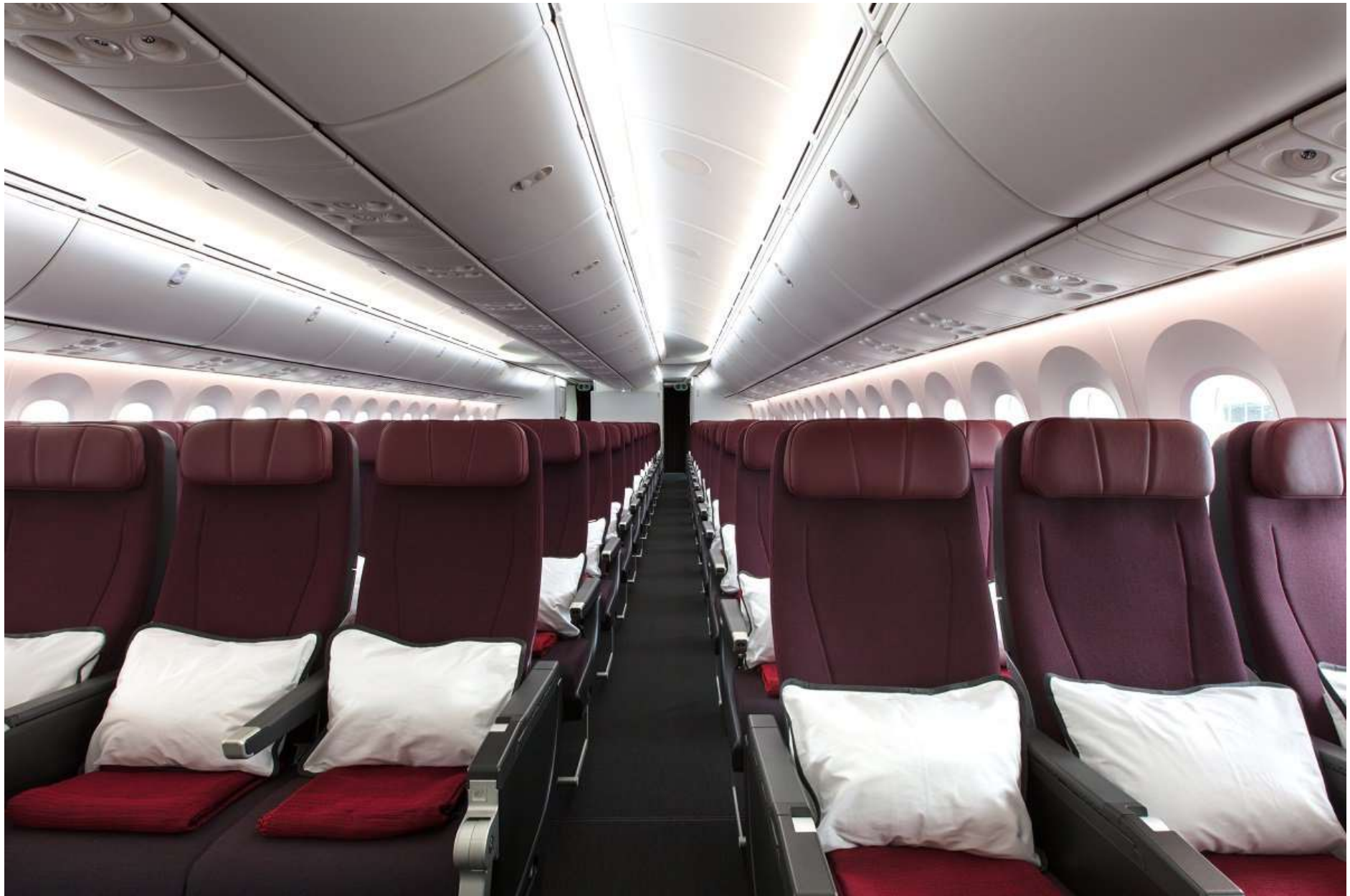
11-Oct-17 – Economy Class Seats