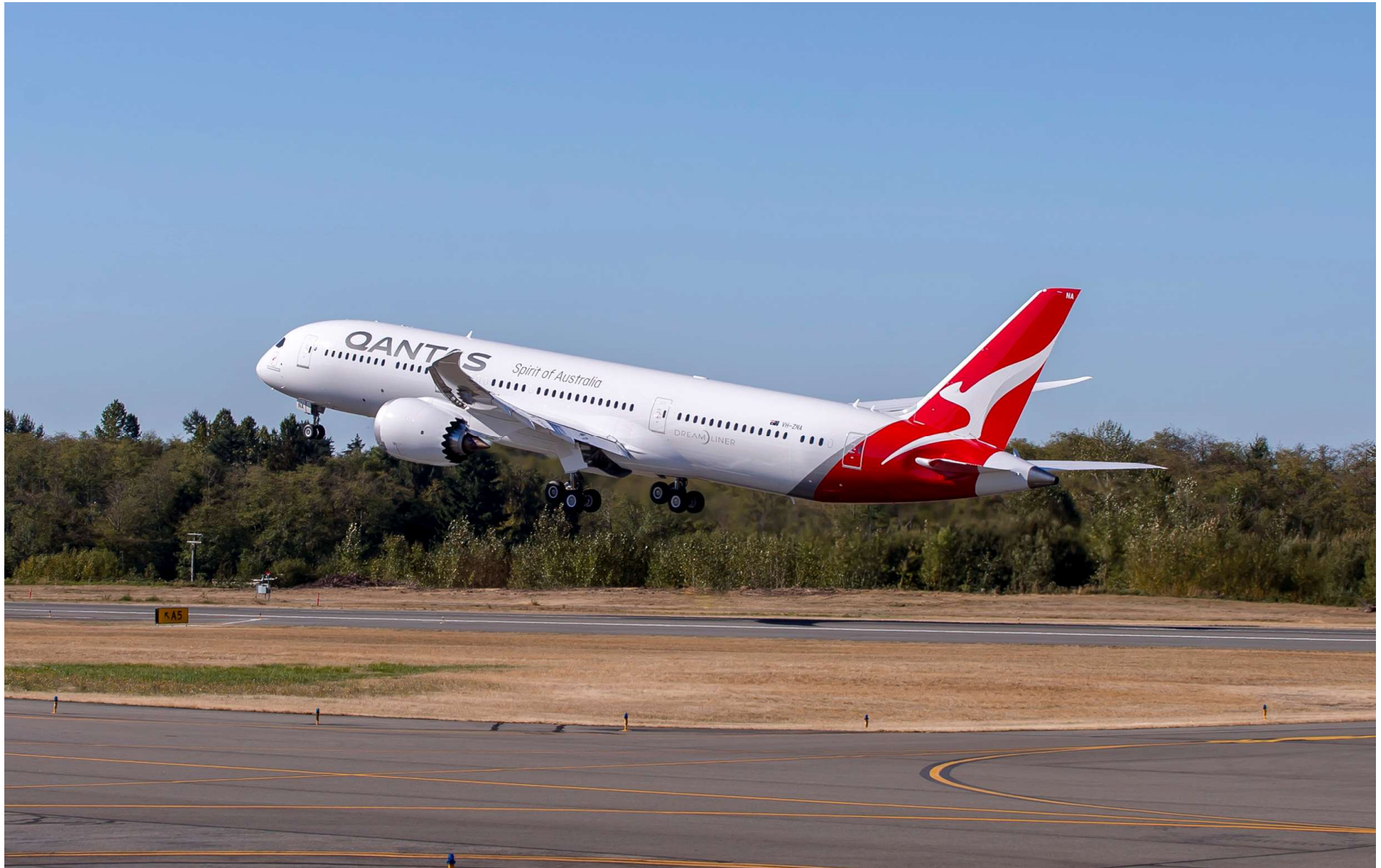
28-Sep-17 – B1 Flight Take Off