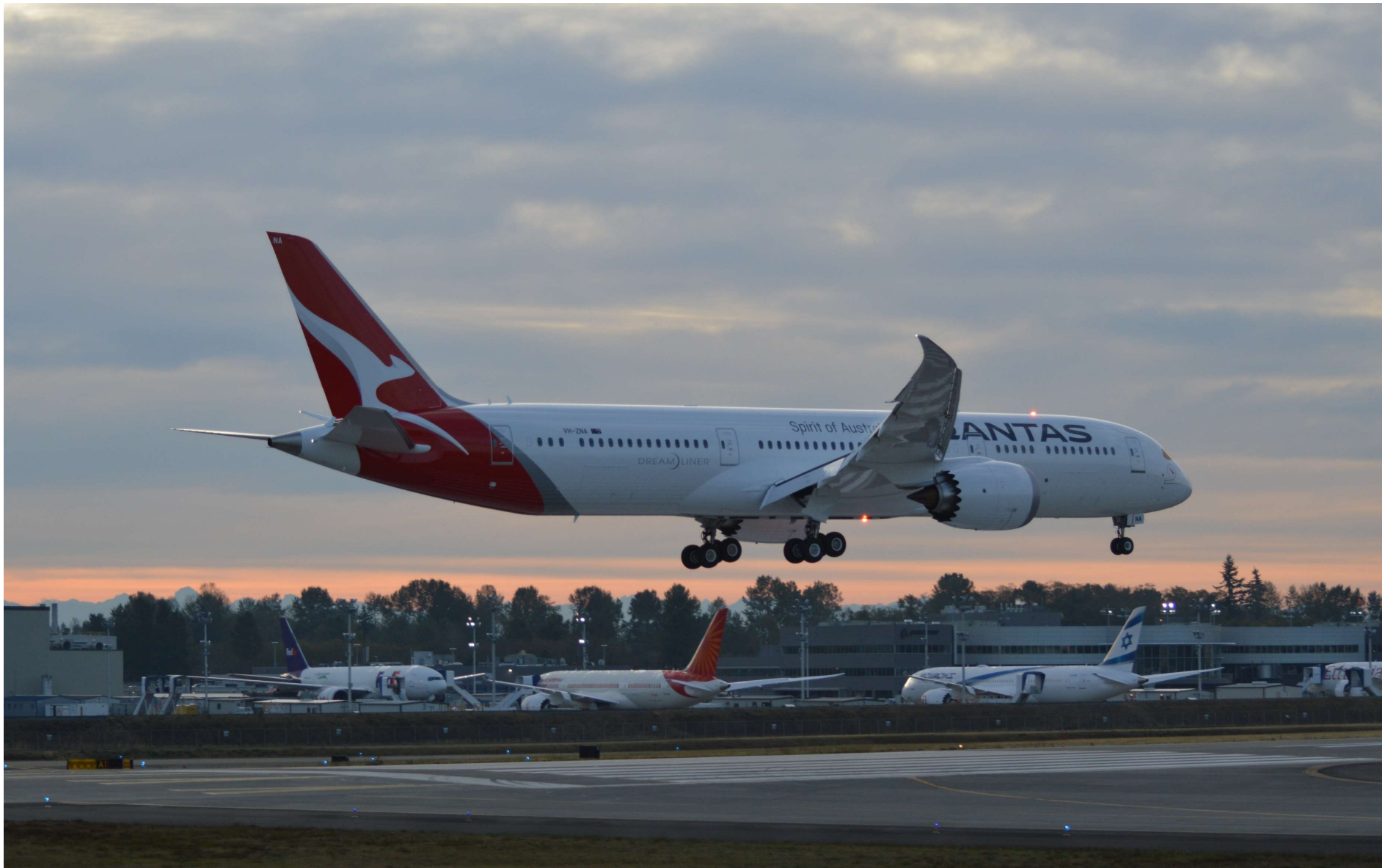
6-Oct-17 – B2 Flight Landing