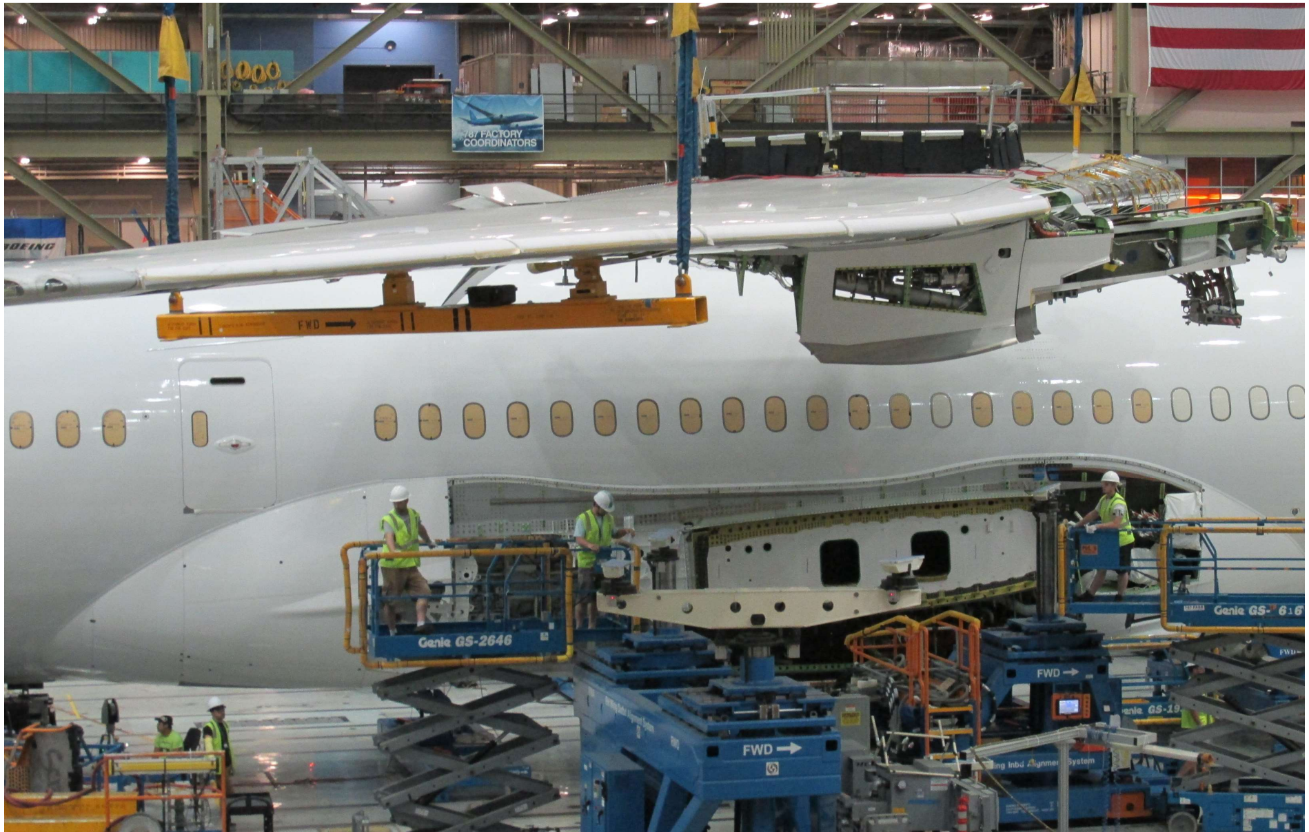
8-Aug-17 – Position 1 - Start of Final Assembly