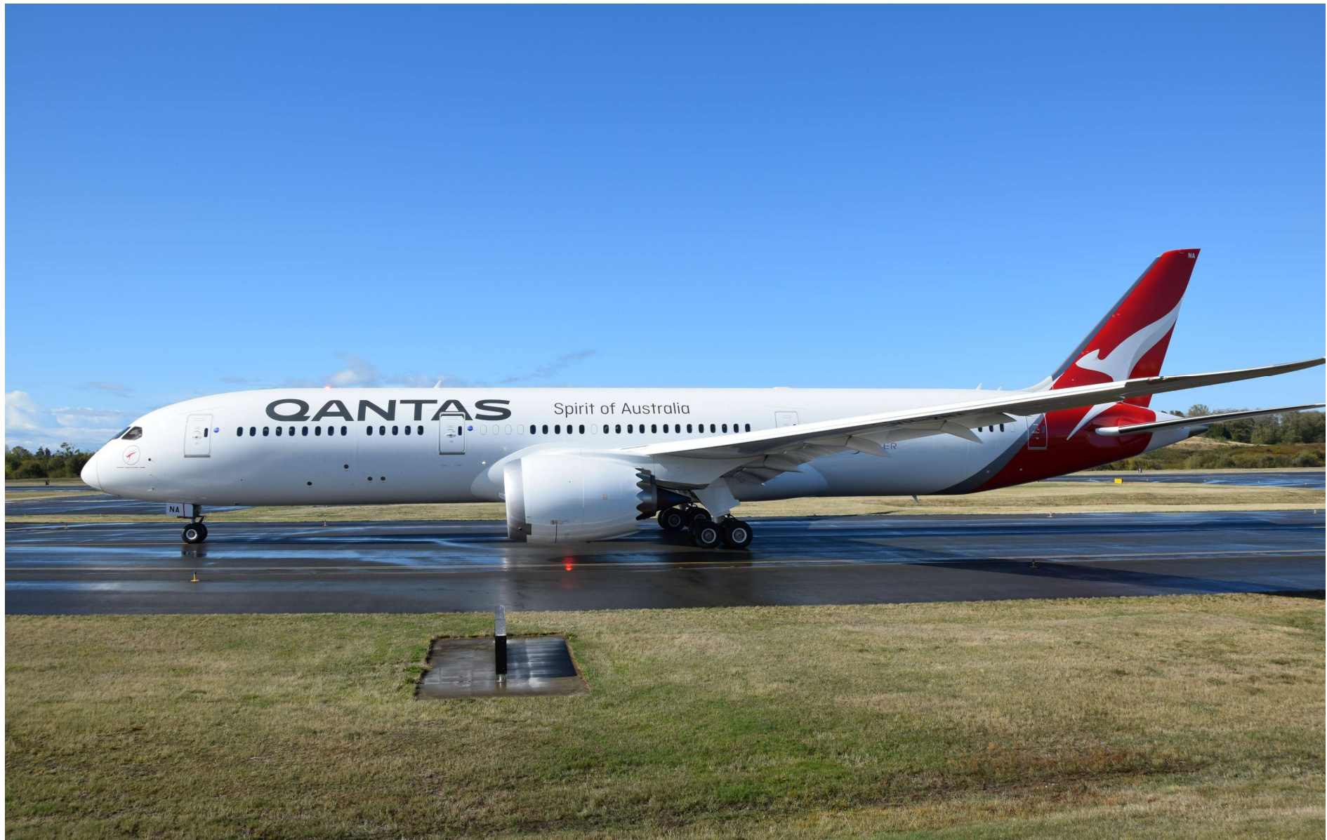
17-Oct-17 – Taxi for Take Off