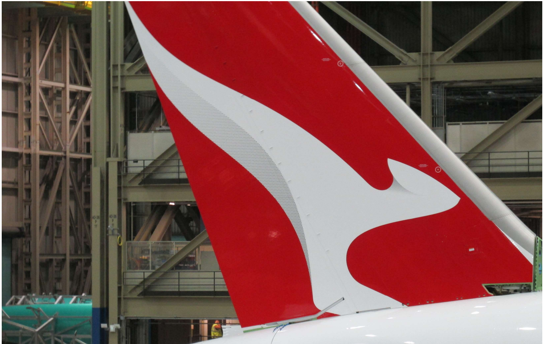
8-Aug-17 – Position 1 – Qantas Silver Roo