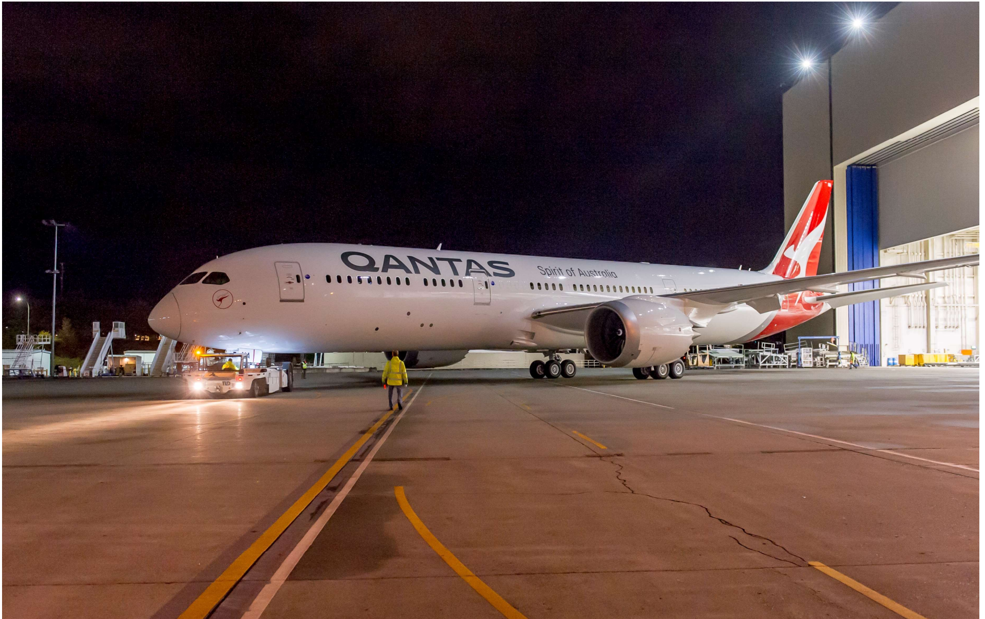
20-Sep-17 - Paint Hangar Roll-Out