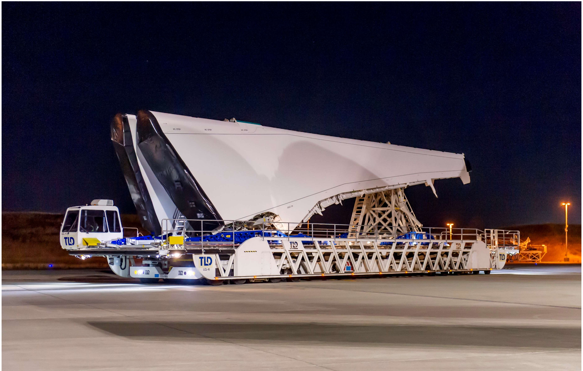
27-Jul-17 – Wings from MHI Japan