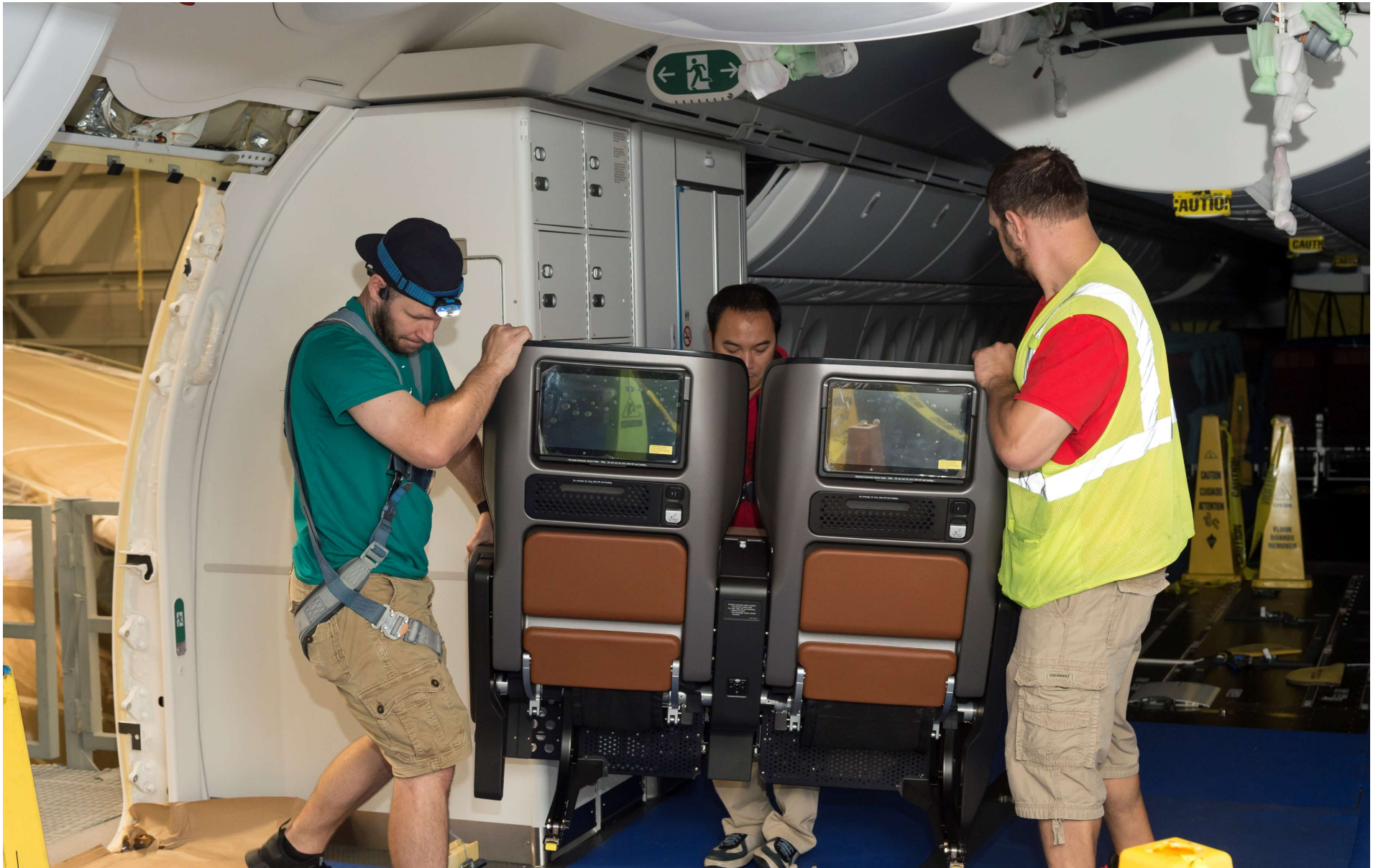
9-Sep-17 – Premium Economy Seat Loading