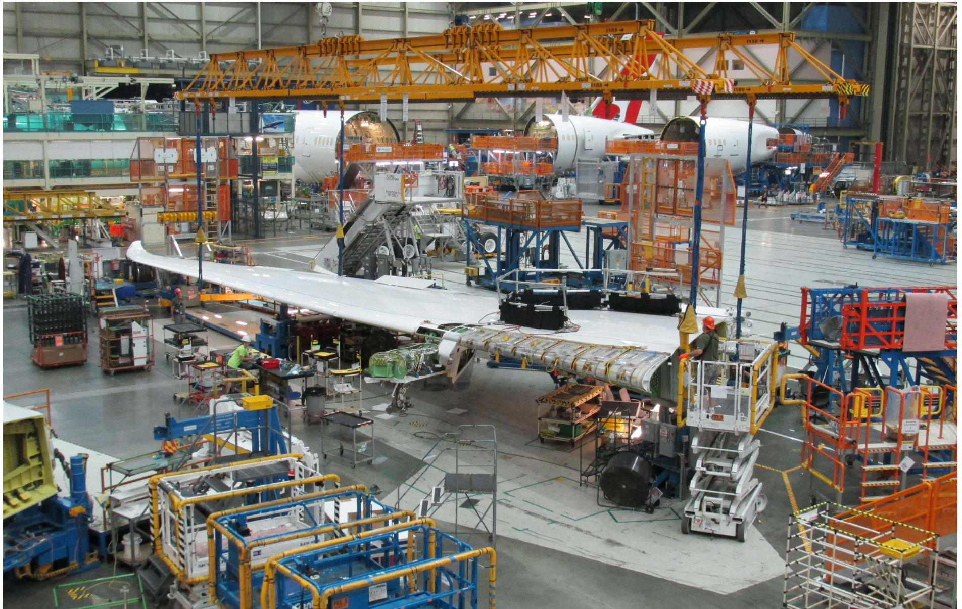
8-Aug-17 – Position 1 – Right Hand Wing