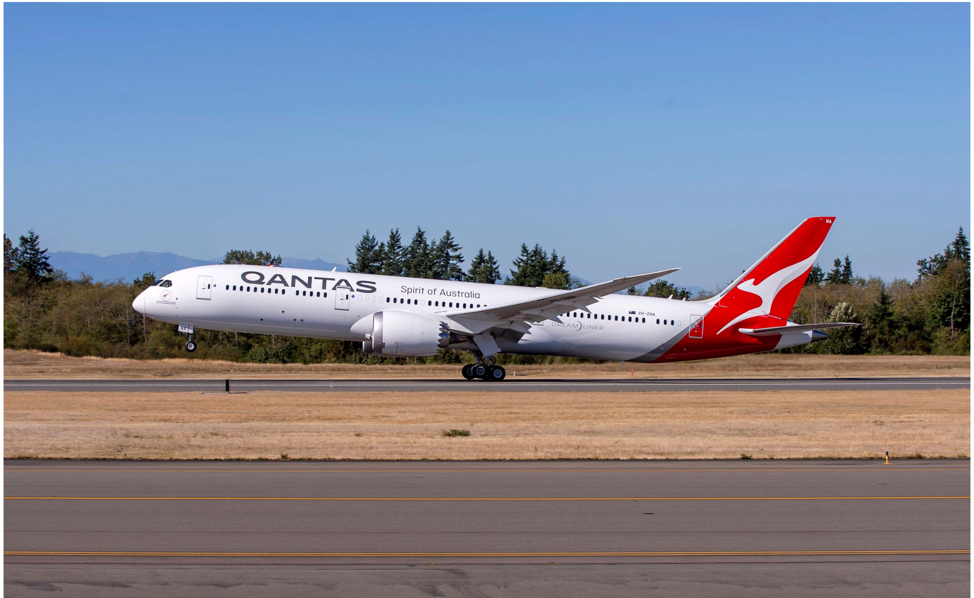
28-Sep-17 - B1 Flight Take Off