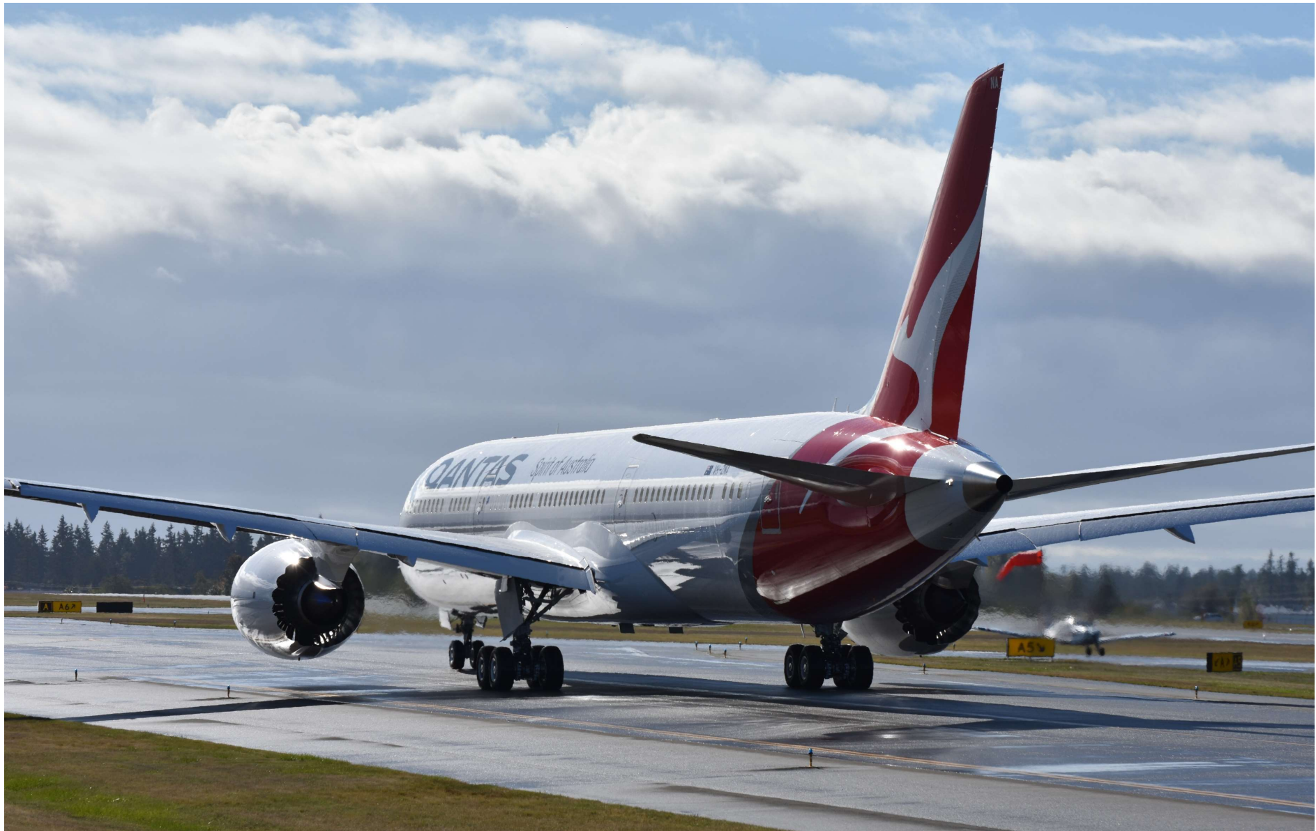
17-Oct-17 – Taxi for Take Off