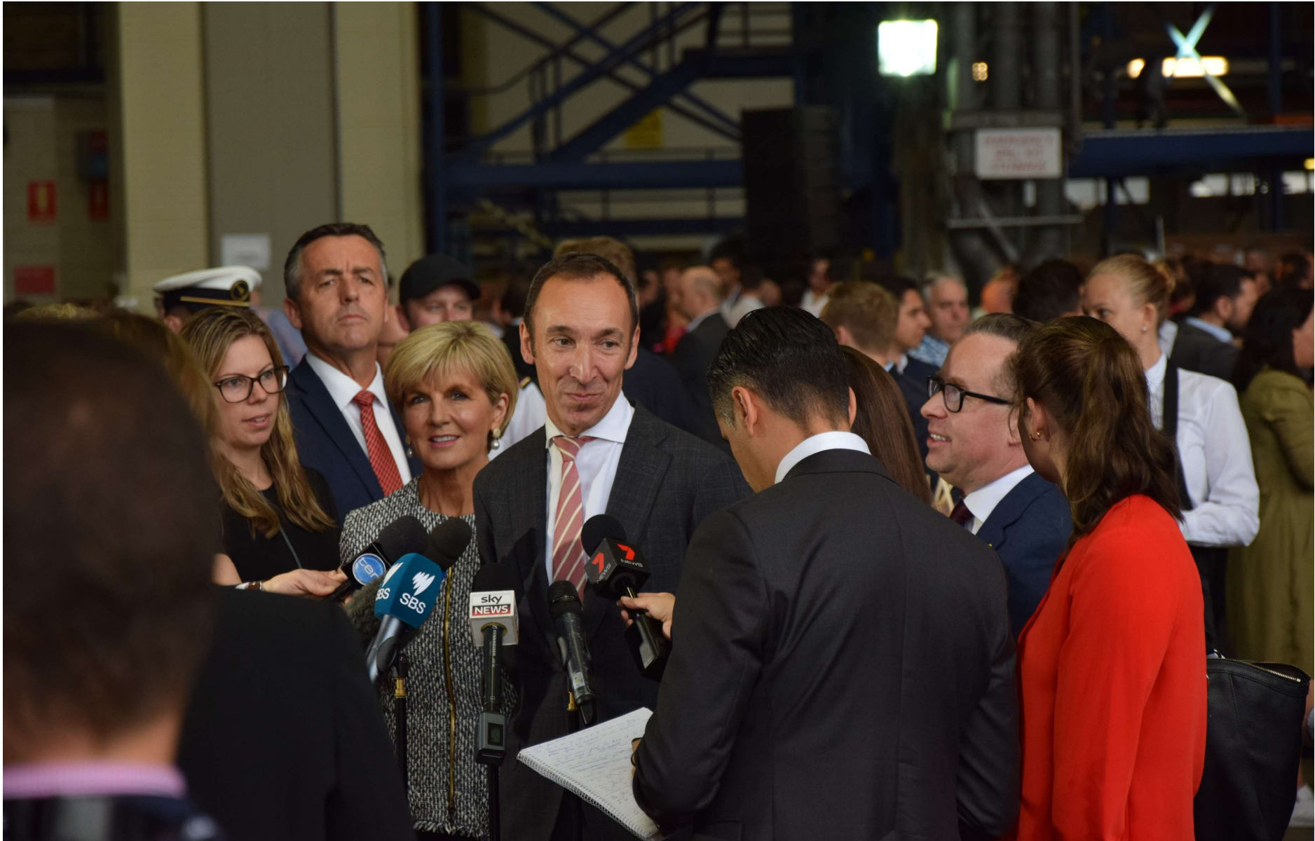
20-Oct-17 – Meeting the Press with Julie Bishop