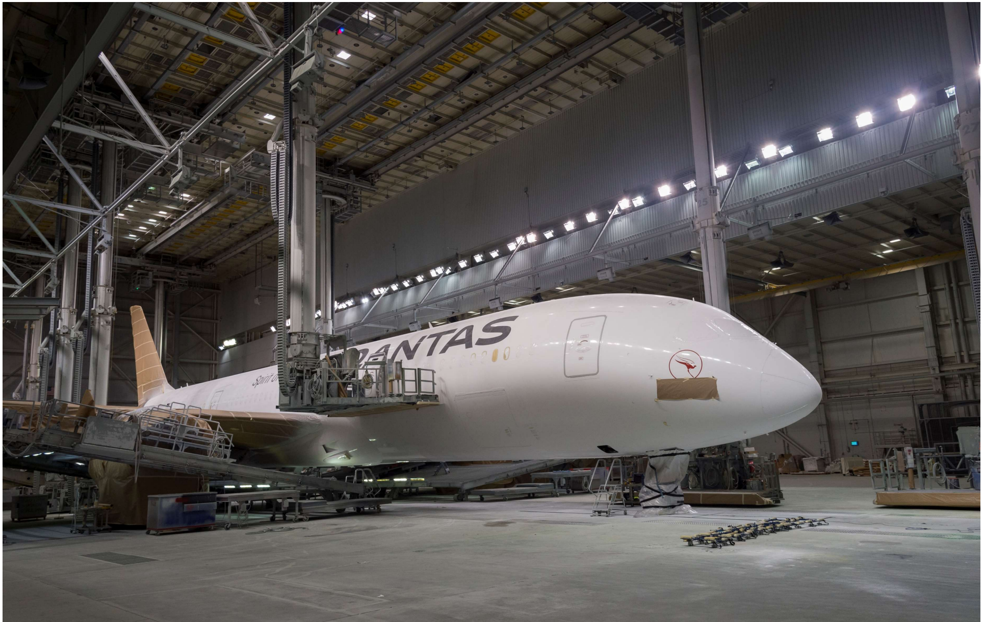
9-Sep-17 – Aircraft Painting