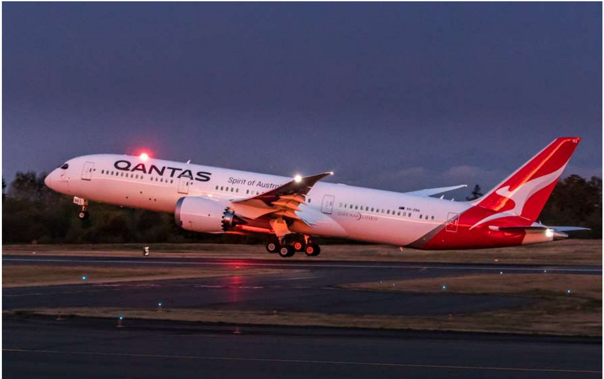
6-Oct-17 – B2 Flight Take Off