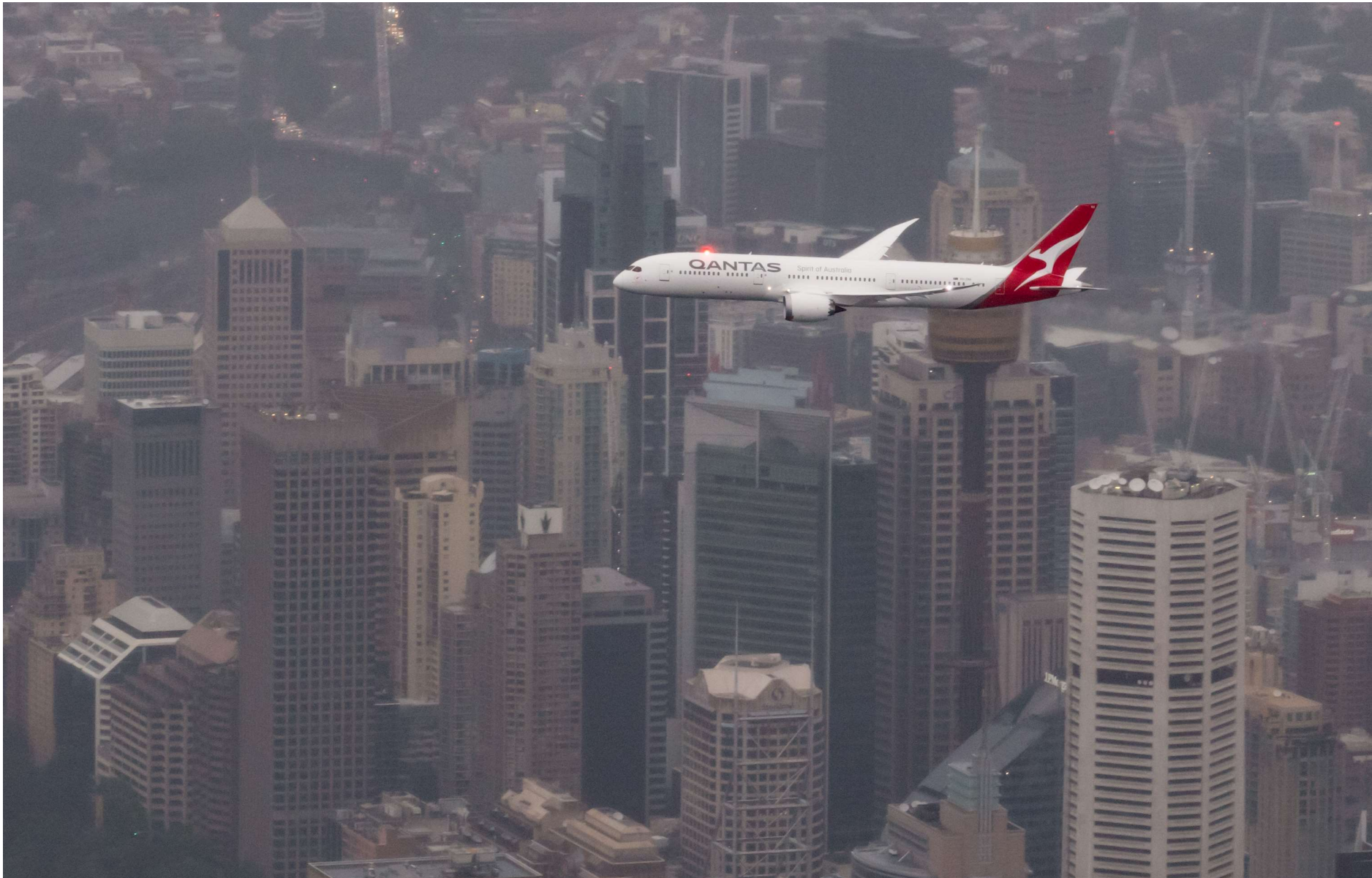
20-Oct-17 - Fly Past Over Sydney CBD