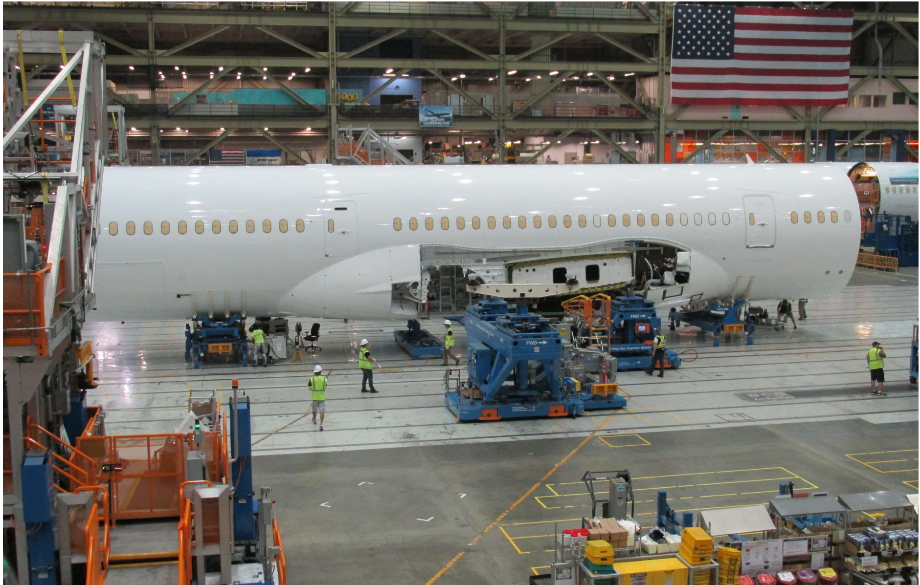
8-Aug-17 – Position 1 - Mid Body Assembly