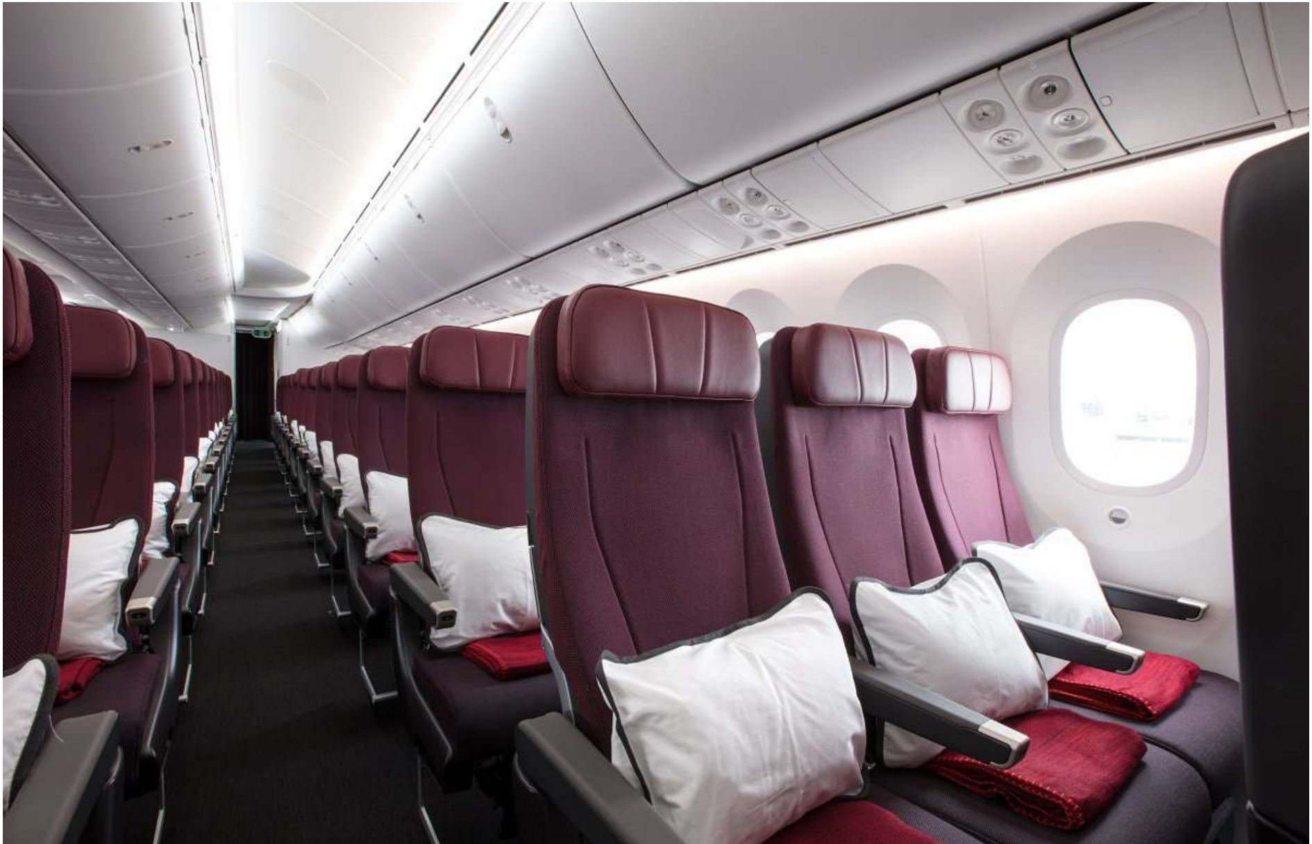
11-Oct-17 – Economy Class Seats