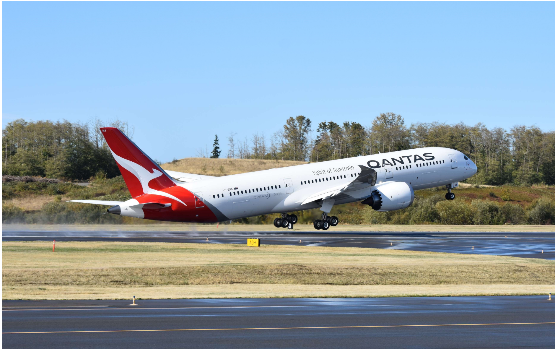
17-Oct-17 – Lift Off from Paine Field, Everett