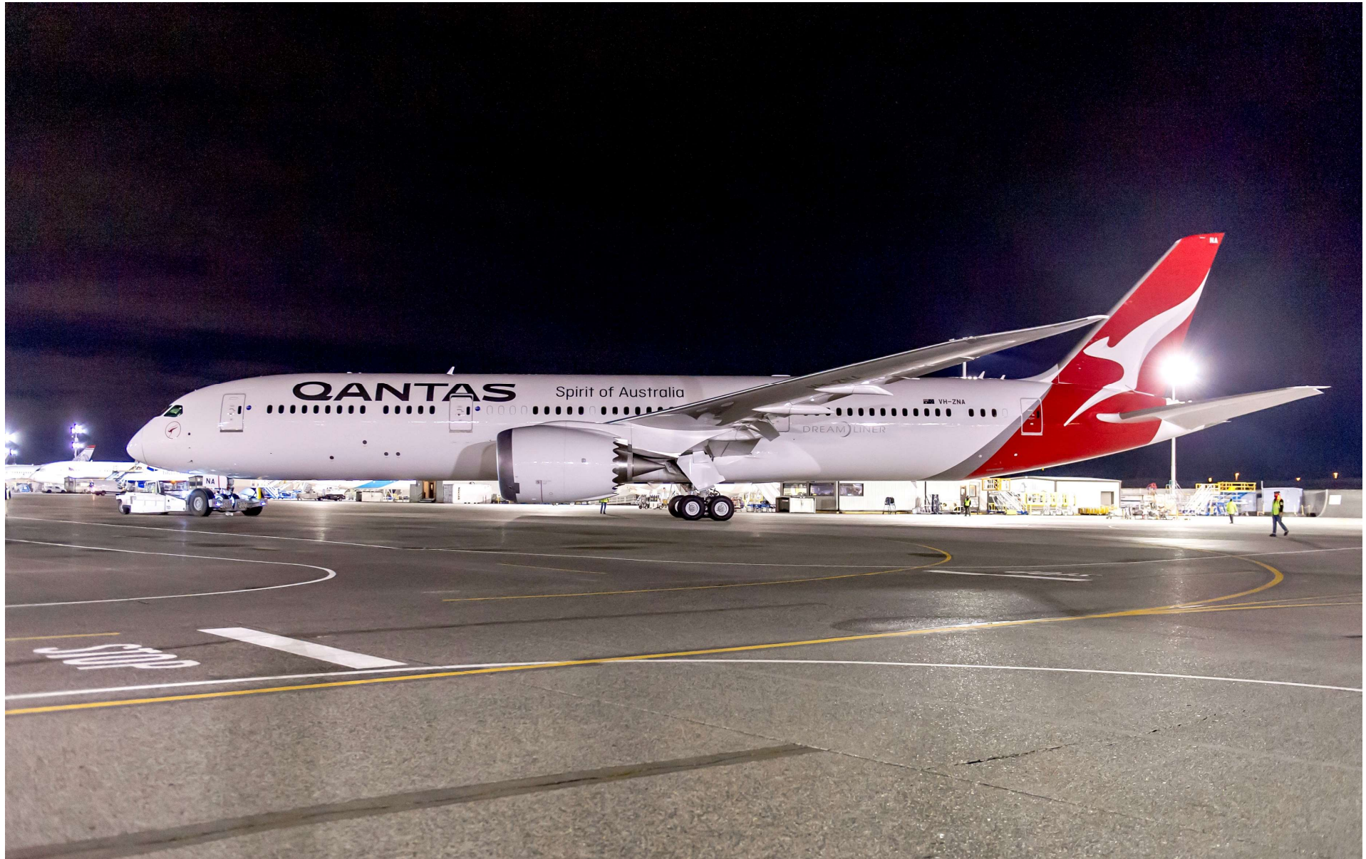
20-Sep-17 - Paint Hangar Roll-Out